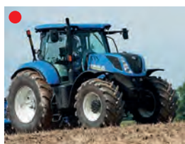
REF: 71118161 2018 New Holland T7.260 50k, 650/75R38 Michelin, front lkg & PTO, guidance ready, warranty. 1600hrs. £95,000 Contact AT