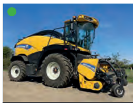
REF: 71119920 2016 New Holland FR600, 3m Grass Pick Up, 4WD, crop processor, auto greaser, additive tank, air compressor. Low hrs. £128,000 Contact AT