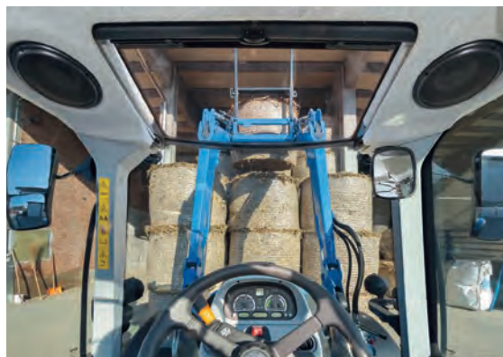
Above: The T5 Dynamic Command's innovative super-visibility roof pane is ideal for loader work.

The ultra-quiet Horizon™ cab with its super high-visibility roof pane offers the best all-round view in its class – including the important view upwards which makes loader positioning so much easier. User comfort is enhanced by intuitive features such as the SideWinder™