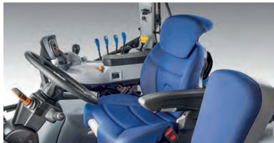
Below: Ergonomics in the ultra-quiet Horizon™ cab place all controls easily to hand and the SideWinder™ armrest adds comfort.

armrest, perfectly placed for operating all the key controls.