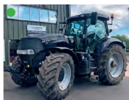
REF: 41116117 2017 Case IH Puma 200CVX 50k, front axle & cab suspension, front linkage, hyd. top link. 6000hrs. £45,000 Contact SC

● Finance offer 1+2 @ 0%. Offer based on maximum balance financed of 50% of the advertised price. Require a deposit and/or trade in with a minimum value of 50% of the advertised price.