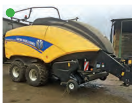
REF: 11119535 2019 New Holland BB890 Packer Cutter, tandem steer axle, auto greaser, electric bale length. 10,000 bales. £75,000 Contact AD