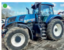
REF: 61117427 2016 New Holland T8.350 40k UltraCommand, 710/70R42, guidance ready, 5 rear remote valves. 4200 Hrs. £59,500 Contact PC