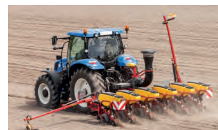
Top: Tempo TPF8 8-row planter. Above: Tempo T6 mounted 6-row planter. Below: Unmatched precision at high speed.