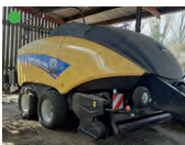
REF: 71120075 New Holland BB1290 Plus, tandem axle, moisture meter, bale weigher, low bale count, excellent cond. £78,000 Contact AT