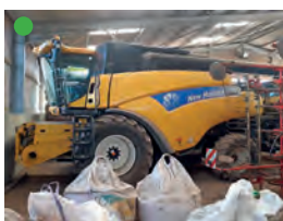
REF: 71119972 2010 New Holland CR9080, 30ft Varifeed, laser pilot, yield meter. £85,000 Contact AT