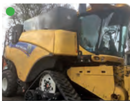
REF: 61118820 2013 New Holland CR9080S, 30ft Varifeed, 24" tracks, twin rape knives & trailer, straw chopper, chaff spreader. Eng/Drum Hrs: 1567/1270 £124,000 Contact PC