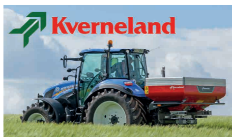
Top: Kuhn Axis 40.2 EMC fertilizer spreader Above: Kverneland Exacta CL spreader. Below: Hardi Commander 10000 trailed sprayer

Norwegian-built Kverneland mounted spreaders are among our favourites and are available from our Hereford branch where we have a CL1100, HL1500 and self-weighing TL1500 in stock offering capacities up to 1,500 litres with a spreading width from 10 - 54m.