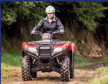
Lightweight, versatile ATV for the spring