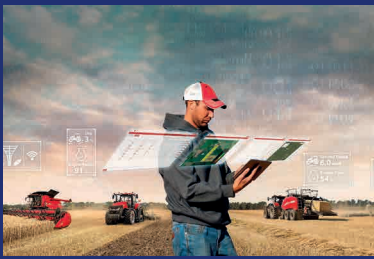
New telematics to harmonise mixed fleets