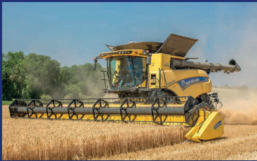
Make the most of our 2020 demo fleet