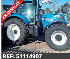
REF: 51114907 New Holland T7.230 SW MY18 (SWII), T4B 50 kph, Power Command, Michelin tyres £95,500