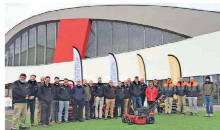
Haynes Motor Museum, Sparkford