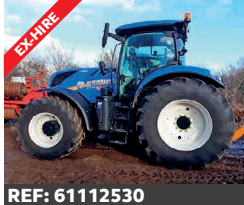
REF: 61112530 New Holland T7.245 AC T4B, 50 kph, eco cvt, fender PTO control, full autoguidance £97,000