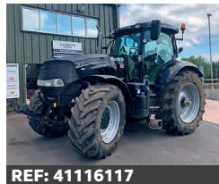
REF: 41116117 2015 Case IH Puma 200 ECO CVX, 50k CVT, front axle & cab susp, air brakes, front linkage £58,000 SC