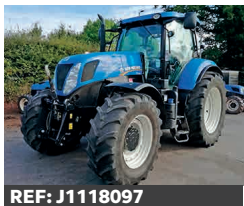
REF: J1118097 2012 New Holland T7.250, 50kph, Powershift, sidewinder, front linkage £43,000 WF