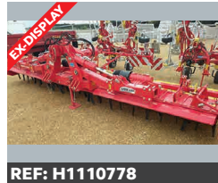
REF: H1110778 Pöttinger Lion 6000 Power Harrow, 6m folding width for tractors up to 270hp £25,000