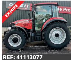
REF: 41113077 Case IH Farmall 115C HD, 40kph, airseat, pushback seat, front weight £39,050