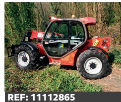
REF: 11112865 2015 Manitou MLT 735 120 powershift LSU, fully dealer serviced, very nice condition £39,000 CD