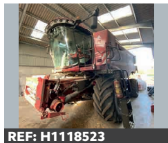
REF: H1118523 2017 Case IH Axial Flow 7240, 25' varifeed header, 1 rape knife, full AFS, 2 seasons warranty £183,500 CM