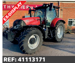
REF: 41113171 Case IH Maxxum 150, 50kph, cab suspension, front weight £63,850