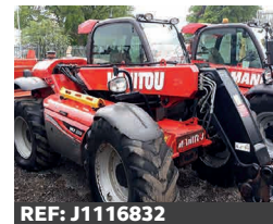
REF: J1116832 2016, Manitou MLT 629, 5 hyd spools, 48" fixed forks, pneumatic seat with susp, air con £36,000 WF