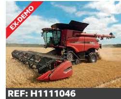
REF: H1111046 Case IH 8240 Combine autoguidance, hi-cap unload auger, engine compressor, luxury cab, magnacut £POA