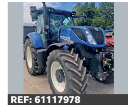
REF: 61117978 2018 New Holland T7.260AC, T4B engine, MY18, 50kph, comfort pack, front linkage £98,000 RL