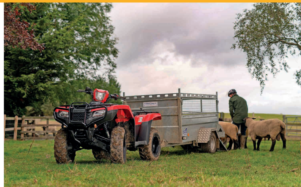
Above: Honda TRX520 FM6 Below: Honda Pioneer 700

With additional electric gearchange and full automatic option, the DCT transmission on the FA models give you more gear options than any other ATV on the market. For 2020 the advanced new 'Skip Switch' enables you to select reverse as you come to rest with virtually no delay – all at the press of a button. Choosing the TRX40FA6 model gives the rider the benefit of comfortable and robust independent rear suspension for grip and stability along with a rear hydraulic disc brake. From £7,325.00 + vat