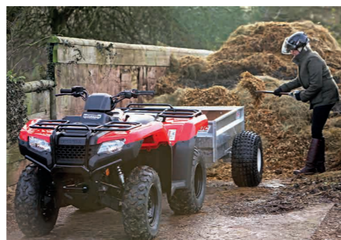
Honda TRX420 FM