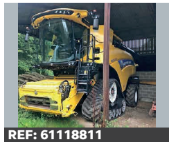
REF: 61118811 2018 New Holland CR9.90, 28.5 flex tracks, 35' varifeed, twin rape knives, 1 year service plus remaining £268,500 RL