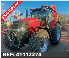
REF: 41112274 Case IH Puma 200, T4B, 50kph, Michelin tyres 650/70R42 £105,350