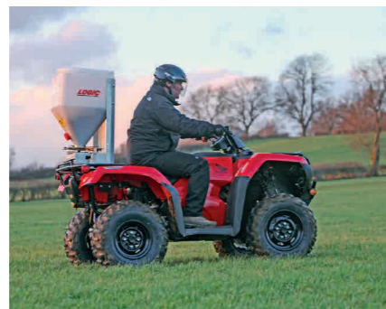
Honda TRX420 FA5

A tough performer in all conditions, 2/4wd on demand, 385kg towing ability and straightforward 5 speed foot gearchange.