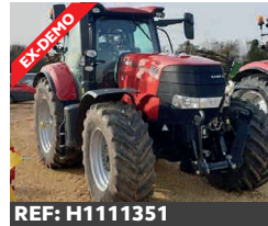
REF: H1111351 Case IH Puma 200 T4B, 50kph, exhaust brake, air trailer brakes, adv hmc, 156l pump, 4 rear valves £92,750