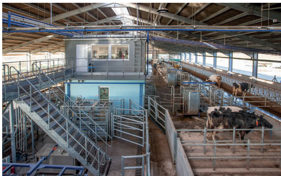
The four DeLaval VMS milking units are housed in booths beneath the dairy office.

just under 200 and there are plans to expand further to around 240. Based on a nominal figure of 60 cows for each VMS station, the new shed is set out in four sections, each with its own milking station.