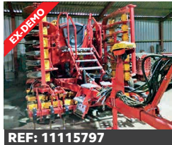
REF: 11115797 Väderstad Rapid RDA600S Combi Drill, 3 rows of coulters, depth control £82,000