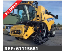
REF: 61115681 New Holland CR8.90 Combine, 30ft varifeed header, engine hrs 193, threshing hrs 116 £POA