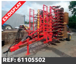
REF: 61105502 Väderstad Carrier 525XL, Disc Cultivator, 5.25m working width £38,150