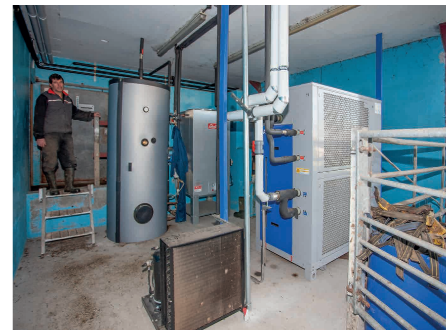
Top: The new 20,000-litre cooling tank at Bridge Farm. Above: The CWC and heat recovery system.

“The whole system was installed very neatly by a single T H WHITE engineer who made a beautiful job of it. We are impressed!”