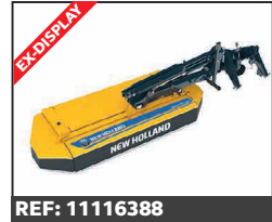
REF: 11116388 New Holland Disc Cutter 320P Mower Condition £10,950