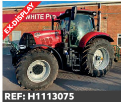
REF: H1113075 Case IH Puma 175 CVX, 50kph, front linkage, full autoguidance £94,450