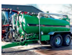
2017 HiSpec 3500 gallon TD-S Slurry Tanker, topfill, internal agitator, hyd drive pump £36,750 BG