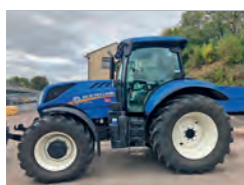
2016 New Holland T7.190, 50kph, c/w semi p/shift, joystick, very good condition £59,000 JW