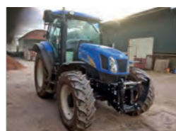
2012 New Holland T6070 Elite, 40k trans, front linkage, 4,300 hrs, very nice condition £35,000 CD