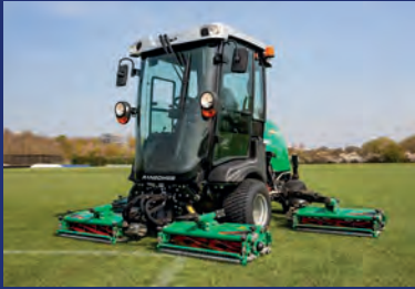
Clean cut at University of Warwick