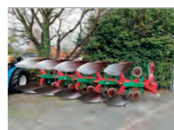
2008 Kverneland 5/200 5F, mounted reversible, no 28 bodies, combi wheel, headstock lock £10,500 BL