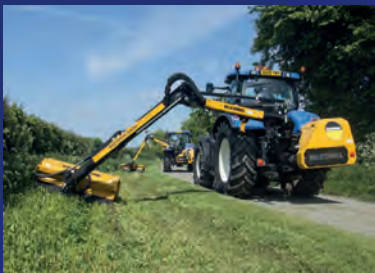
Get a cut above with an 'early bird' purchase