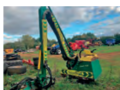
Spearhead Excel 605 Hedge Trimmer, good working order, 1.2m head, hyd roller £12,500 AT