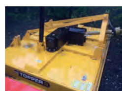
2018 McConnel topper 9, heavy duty rotary mower, 9ft cut £POA CD