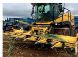
2008 New Holland A440 Maize Header, 8 row small discs £25,000 AT