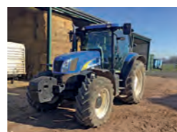
2011 New Holland T6050 Elite 16 x 16 electro Command, 40kph, no weights £33,500 AD