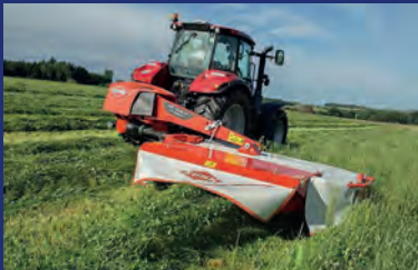
Kuhn grass kit to improve productivity