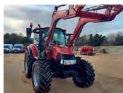
2017 Case IH Farmall C, 24 x 24 hi/lo gearbox, 40kph, LRZ 100 Loader, 2 rear remotes £41,500 CM