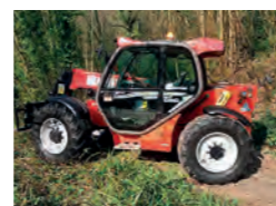
2015 Manitou MLT 735 120 powershift LSU, fully dealer serviced, very nice condition £39,000 CD