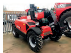
2018 Manitou MLT625, Kubota engine, 75hp/55. 4w stage 3B, hydrostatic transmission £49,800 CD