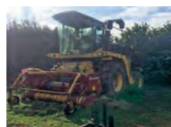
1995 New Holland FX300 Forage Harvester, in working order, sold as seen £18,000 AT