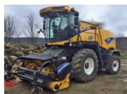
2011 New Holland FR9050 Forage Harvester, hours: engine 2134, chopping 1582 £83,000 AT