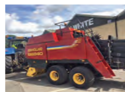
2005 New Holland BB940 Baler, single axle hyd brakes, 92,000 bales £15,000 AT