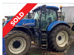
2014 New Holland T7.250 Power Command Classic, c/w front linkage & PTO, air brakes £43,500 AD