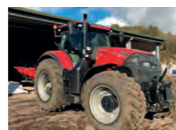
2016 Case IH Optum 300, front linkage, 5-electric remotes, hyd top link, full guidance £98,000 SC