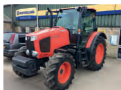
2014 Kubota M135GX, 2 rear spools, 40kph, front suspension, 850 hrs from new £36,000 RD