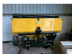
2017 Claydon front mounted tank, RDS control box, distribution head, pipework & fertilizer coulters £POA AD