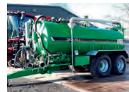
2017 HiSpec 3500 gallon TD-S Slurry Tanker, topfill, internal agitator, hyd drive pump £36,750 BG