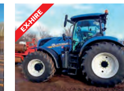
REF: 61112530 NH T7.245 AC T4B - 50 kph, eco cvt, hydr single, full autoguidance, joystick, aircon £105,000