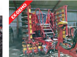
REF: 11115797 Väderstad Rapid RDA600S Combination Drill £82,000