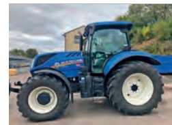
2016, New Holland T7.190, 50kph, c/w semi p/shift, joystick, very good condition £59,000 JW