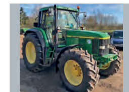
John Deere 6910, 40k Powerquad, 11,050 hrs, 80% tyres, LH reverser, TLS suspension £20,500 CD