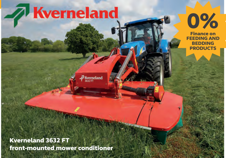
Kverneland 3632 FT front-mounted mower conditioner