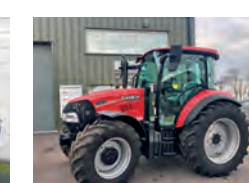
REF: 41109251 Case IH Farmall 105C HD - high-lo 24 x 24 2 speed p/ shift, 40kph, HD rear axle, 3 rear remotes, aircon £POA

All items offered are subject to remaining unsold. Prices shown do not include VAT.