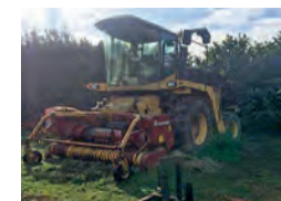
1995 New Holland FX300 Forage Harvester, in working order, sold as seen £18,000 RM