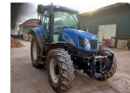
2012 New Holland T6070 Elite, 40k trans, front linkage, 4,300 hrs, very nice condition £35,000 CD