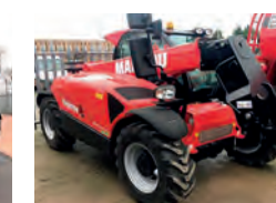
REF: 61113887 Manitou MLT 625-75H Elite - Kubota engine, 42" fixed forks & carriage, 5 hyd services £49,800