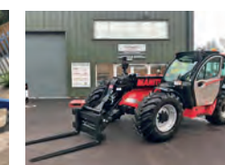
REF: 51115523 Manitou MLT741 Vario transmission, 7m reach, 4.1 tonne lift capacity £66,000