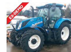
REF: 11113494 New Holland T6.175 DC T4B, 50kph, engine speed management, cab susp, front linkage £69,950