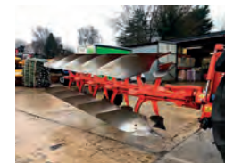
EX-DEMO - Kuhn Multi Master 5 Furrow Plough, auto reset, LP66D wide bodies £16,800 CO