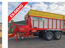
REF: 51110456 Pöttinger Torro 6010I Combine Loader Wagon - tandem sprung steering axle, 45 knives £69,250