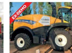
REF: 71111582 New Holland FR650 T4B - 4wd diff lock, 40kph, engine compressor, autofloat, climate control £205,000