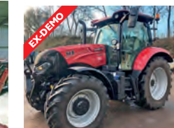
REF: H1112435 Case IH Maxxum 145, 50kph - 540/540E/1000 PTO, front linkage, 90mm lift ram, susp f/ axle with brakes £69,650