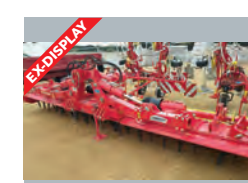
REF: H1110778 Pöttinger Lion 600 folding Power Harrow £25,000