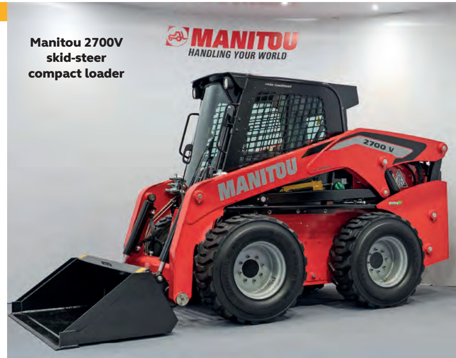
Manitou 2700V skid-steer compact loader

We understand that new machinery isn't the right choice for everyone so we are also offering deals on a selection of quality used Manitou equipment. Contact your T H WHITE Agricultural branch or local sales rep for full details.