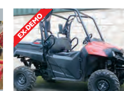
REF: 1110687 Honda 700M2, 2 year warranty, handbook, fitted towball, EASI one day free training course £8,495