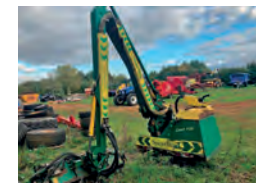
Spearhead Excel 605 Hedge Trimmer, good working order, 1.2m head, hyd roller £12,500 RM