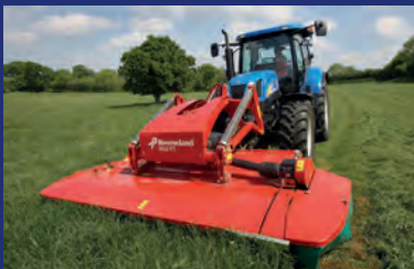
Kverneland joins the T H WHITE fold

PLUS Agricultural clearance stock bargains!