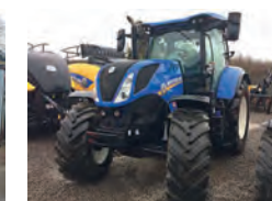
REF: 11116612 New Holland T7.190 50kph, Semi Powershift, cab susp, mech mirrors, LH & RH mirrors £59,000