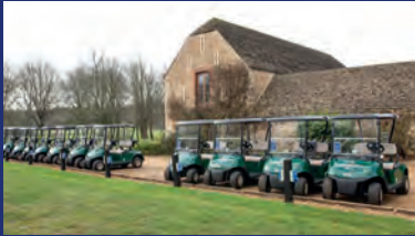
Lithium fleet for Bowood PGA course