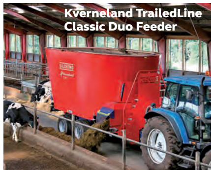
Kverneland TrailedLine Classic Duo Feeder

**There will be an open day/evening at our new Hereford branch on 2 May. If you would like to attend please contact us on 01432 352333**