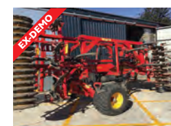
REF: 61110508 Väderstad Top Down 400 multipurpose cultivator £52,000