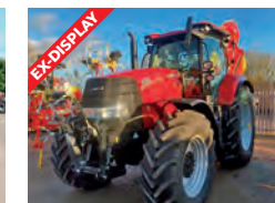
REF: 41112274 Case IH Puma 200 T4B - 50kph, exhaust brake, air trailer brakes, f/linkage, auto aircon £105,350