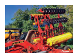
REF: 61110514 Väderstad CR650 Carrier TopDown 400 - crossboard, system disc £44,000