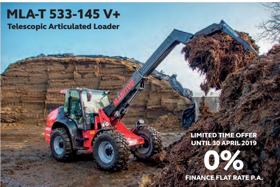
MLA-T 533-145 V+ Telescopic Articulated Loader