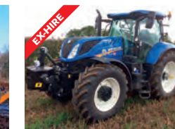
REF: 71109057 NH T7.245 AC - 50kph, front linkage Michelin tyres 540/65R30 fixed, 650/65R42 fixed, 211 hrs £POA