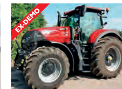
REF: H1107527 Case IH Optum 300 - 50kph cvt, air brakes, front linkage & PTO, AFS 700 screen, full guidance £128,250