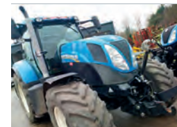
2015 New Holland T7.210 Power Command, 50kph, front linkage, auto steer ready, 3,200 hrs £53,900 PC