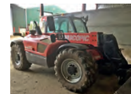
Manitou MLT 741, 4,300 hrs, full dealer history, genuine machine from a genuine farm £19,500 CD