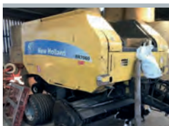
New Holland BR7060 variable chamber crop cutter round baler, 480/45-17 tyres £8,000 RM