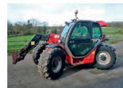
2010, Manitou MLT 634-120 LSU, PUH, JSM controls, 6 speed powershift £19,500 CD