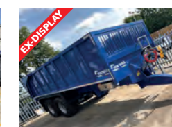
REF: 51108009 Warwick WB14FM 14t Grain Fastmaster Trailer £18,415