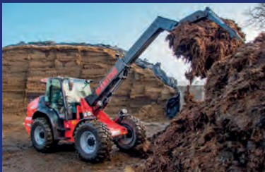
Offers on the latest from Manitou