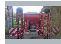
Kuhn Megant 400 4 metre Tine Drill, a/c electric seed metering, Kuhn Quantron S control box £10,000 CD