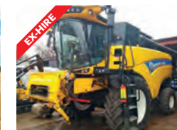
REF: 61112327 New Holland CX7.80 combine - chop & chaff, yield monitor, autoguidance, 22ft varifeed header £183,000