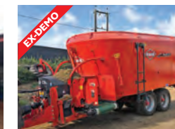
REF: 51111426 Kuhn Profile 24.2CL TMR mixer wagon - cross feeding, 2 vertical augers, 6 auger knives £40,820