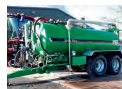
2017 HiSpec 3500 gallon TD-S Slurry Tanker, topfill, internal agitator, hyd drive pump £36,750 BG