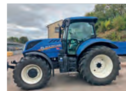
2016, New Holland T7.190, 50kph, c/w semi p/shift, joystick, very good condition £59,000 JW