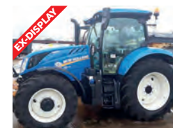
REF: 61113667 New Holland T6.175 T4B - 50kph, 24 x 24 trans, class 3 susp 4wd with brks & terralock, aircon £68,500