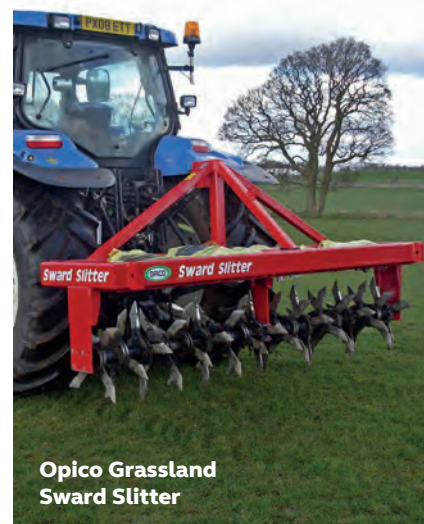
Opico Grassland Sward Slitter