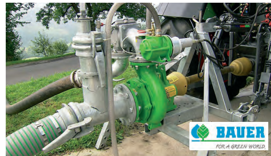
BAUER FOR A GREEN WORLD.

Research has shown that spring application of slurry is far more beneficial to grass than summer spreading, so with the season now upon us the one thing you definitely need is a reliable slurry pump.