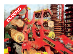
REF: 61110509 Väderstad CR650C Cultivator - system disc aggressive, steel runner £POA