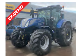
REF: 51111457 New Holland T7.270 AC T4B - 50kph eco cvt, class 4R axle, cab suspension, climate control £114,000