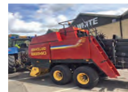
2005, New Holland BB940 Baler, single axle hyd brakes, 92,000 bales £15,000 AT