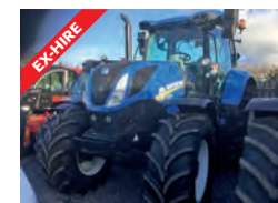
REF: 11112607 New Holland T7.210 T4B - 50kph, full powershift, hyd & pneu track brakes, air con, cab suspension £75,000