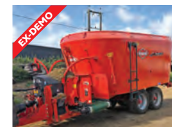
REF: 51111426 Kuhn Profile 24.2CL TMR mixer wagon - cross feeding, 2 vertical augers, 6 auger knives £40,820