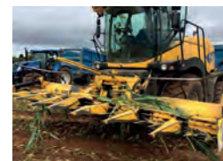
2008 New Holland A440 Maize Header, 8 row small discs £25,000 RM