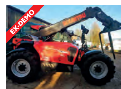
REF: 71107377 Manitou MLT741-140 - Deutz stage 4 engine, m-varioplus transmission, hyd locking, jsm joy stick £POA