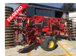
REF: 61110508 Väderstad Top Down 400 multipurpose cultivator £52,000