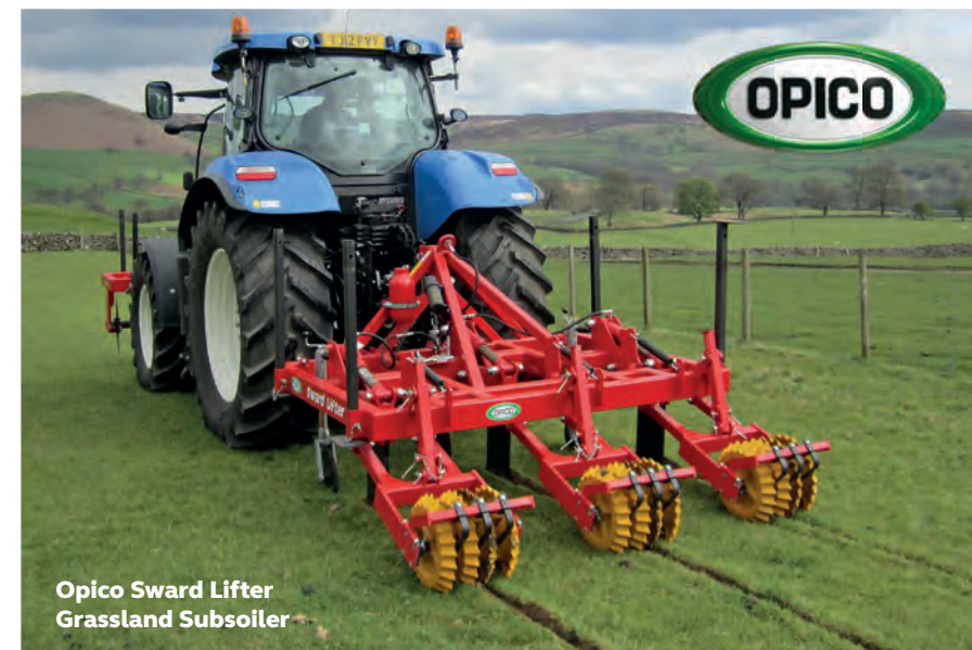
Opico Sward Lifter Grassland Subsoiler

Although slitting or spiking of grassland is not new, OPICO has taken a