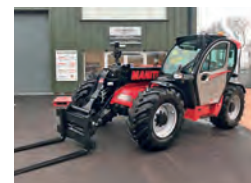
2018, Manitou MLT741, vario transmission, 7m reach, 4.1 tonne lift capacity, 260 hrs, excellent £66,000 JW