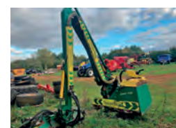
Spearhead Excel 605 Hedge Trimmer, good working order, 1.2m head, hyd roller £12,500 RM