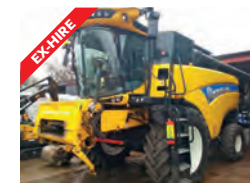
REF: 61112327 New Holland CX7.80 combine - chop & chaff, yield monitor, autoguidance, 22ft varifeed header £183,000