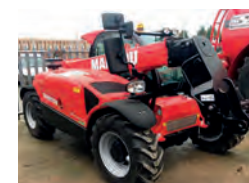
REF: 61113887 Manitou MLT 625-75H Elite - Kubota engine, 42" fixed forks & carriage, 5 hyd services £49,800