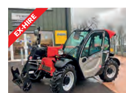
REF: 61108095 Ex-hire Manitou MLT625-75H Elite - Kubota engine, 75hp, 6m reach, 2.5lift capacity £42,200