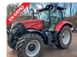
REF: H1112435 Case IH Maxxum 145, 50kph - 540/540E/1000 PTO, front linkage, 90mm lift ram, susp f/ axle with brakes £69,650