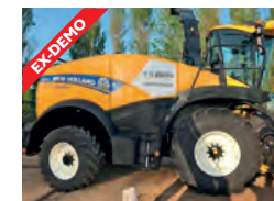
REF: 71111582 New Holland FR650 T4B - 4wd diff lock, 40kph, engine compressor, autofloat, climate control £205,000