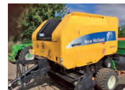
2011, New Holland BR7060, super feed, good order, very nice condition, 20,000 bales £10,500 AD