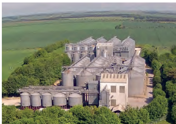
Trinity Grain's 100,000 tonne grain store at Shrewton – the original 30,000 tonne facility in the foreground with the extension beyond.