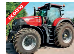
REF: H1107527 Case IH Optum 300 - 50kph cvt, air brakes, front linkage & PTO, AFS 700 screen, full guidance £128,250