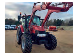
2017 Case IH Farmall C, 24 x 24 hi/lo gearbox, 40kph, LRZ 100 Loader, 2 rear remotes £41,500 CM