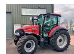
REF: 41109251 Case IH Farmall 105C HD - high-lo 24 x 24 speed p/ shift, 40kph, HD rear axle, 3 rear remotes, aircon £POA

All items offered are subject to remaining unsold. Prices shown do not include VAT.