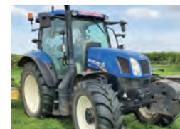
2015 New Holland T6.160, 50kph, 4 cylinder, excellent condition £53,000 RL