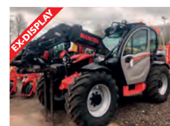
REF: 61112294 Manitou MLT630-105 Vario Elite - Deutz stage 4 engine, 105hp, vario hydro trans, 40kph, heater, £55,500