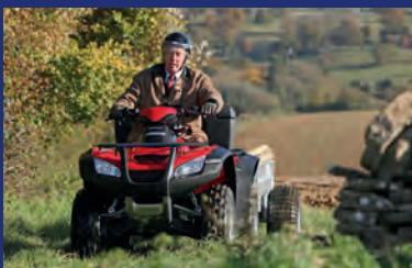
HURRY- 0% finance on ALL Honda ATVs!

PLUS Agricultural clearance stock bargains!