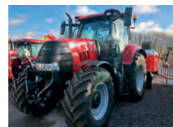
2017 Case IH Puma 150, 50kph, 19 x 6 semi p/shift, front linkage, dual motion air seat £68,000 SC