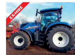
REF: 61112530 NH T7.245 AC T4B - 50kph, eco cvt, hydr single, full autoguidance, joystick, aircon £105,000