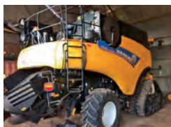
2014 New Holland CR9080 Combine, twin pitch rotors self-levelling cleaning shoe, yield monitor £159,000 RD