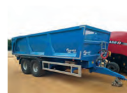
EX-DISPLAY 2017 Warwick WB14FM 14T Fastmaster Grain trailer, 4mm floor, 3mm sides £18,415 CD