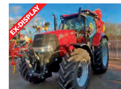
REF: 41112274 Case IH Puma 200 T4B - 50kph, exhaust brake, air trailer brakes, f/linkage, auto aircon £105,350