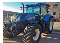
2017 New Holland T7.210, 50kph, full p/shift, fender linkage & PRO controls, cab suspension £67,000 JW