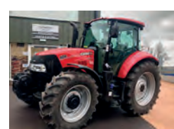
REF: 41106831 Case IH Luxum 120 - 32 x 32 powershift, 40kph, push back hitch, cab susp, air seat, front weight carrier £45,270