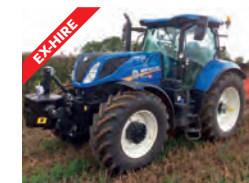
REF: 71109057 NH T7.245 AC - 50kph, front linkage Michelin tyres 540/65R30 fixed, 650/65R42 fixed, 211 hrs £POA