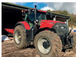
2016 Case IH Optum 300, front linkage, 5-electric remotes, hyd top link, full guidance £98,000 SC