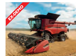
REF: H1111046 Case IH 8240 combine harvester - autoguidance, hi-cap unload auger, engine compressor £POA

All items will be fully checked by our technicians as well as being warranted by T H WHITE.