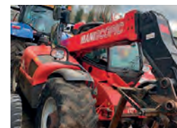
2013 Manitou MLT735, excellent condition £36,000 AT