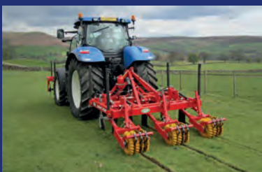
Preparation leads to a good grass harvest