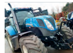
2015 New Holland T7.210 Power Command, 50kph, front linkage, auto steer ready, 3,200 hrs £53,900 PC