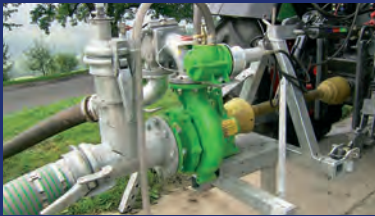
Reliable slurry pumping