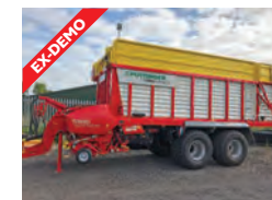
REF: 51110456 Pöttinger Torro 6010I Combiliner Loader Wagon - tandem sprung steering axle, 45 knives £69,250