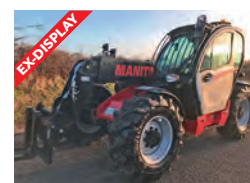
REF: 71110063 Manitou MLT733-105 LSU Premium - Deutz engine, 7m reach, 3.3t lift capacity £56,500