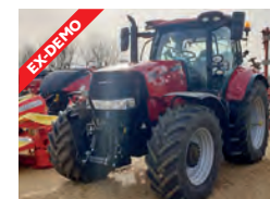
REF: H1111351 Case IH Puma 200 T4B, 50kph - exhaust brake, air trailer brakes, adv hmc, f/linkage, auto aircon £92,750