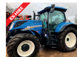
REF: 61112450 New Holland T7.210 T4B - 50kph, full powershift, hyd & pneu track brakes, aircon, cab suspension £77,000