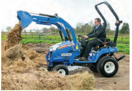
Stepping down a size: Iseki's TXG237 versatile sub-compact tractor is still man-for-the-iob.

needs, just contact the specialists at any T H WHITE Groundcare branch.