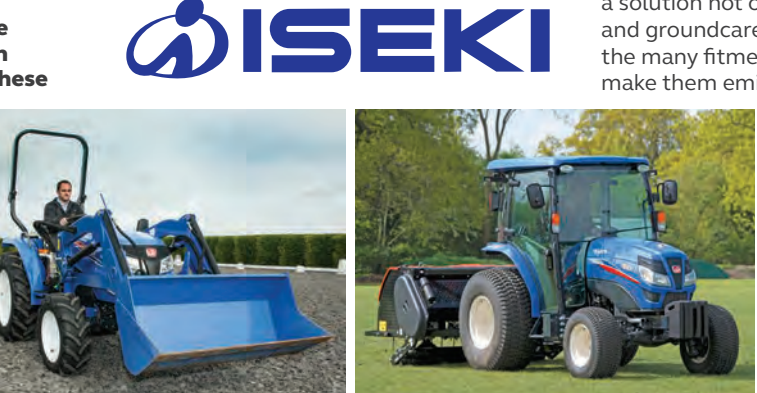
The new Iseki TG6675 PS compact tractor is an extremely versatile machine. Equally at home with ROPS and front loader (left) working on agricultural tyres, or aerating a sports pitch (right) on turf tyres and fitted with an air-conditioned cabin, it's perfect for a multitude of tasks.

However, compact dimensions don't mean a reduction in features or operator comfort. Take the new Iseki TG6675 PS - fitted with turf tyres it is particularly suited for work on golf courses and sports facilities and it can be supplied with a ROPS or a factory fitted, fully airconditioned Category 2 cabin. It features a 65 hp, four-cylinder, Stage IIIB diesel engine, with F12/R12 Power-shuttle transmission. At the rear is a category 1&2 3-point linkage with a capacity of 1,600kg at the ball ends and 1,500kg at 24 inches. Draft control, two auxiliary valves and a front loader joystick are also standard, while the rear PTO is twospeed with a mid PTO also included on the cabin model. An optional front loader is also available