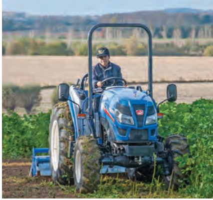
power is needed in tight spaces Below: Iseki TH4335 HST, fitted in this instance with a rear pallet handle

Other tractors in the range span the complete gamut of sizes, power outputs and transmission options, providing