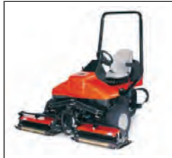
2016 Jacobsen Tri-King Ride On Cylinder Mower, £15,000. Three-wheel drive, power steering, 1.8m cut, 7-knife cylinders, ROPS, ideal for slopes, as-new condition.