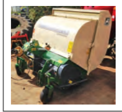
2017 Amazone Groundkeeper GH1350, £6,500. EX-HIRE, 1.35m cut, 1350 litres hopper capacity, low dump collector, mow, scarify, collect, chop and roll in one pass.