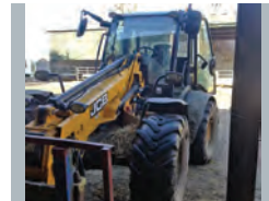
2011 JCB 310 Pivot Steer, 5,100 hours, pin & cone carriage, pick up hitch, immaculate £34,000 RL