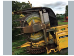
2004 New Holland, RI600Y 8 Row Maize Header, to fit New Holland FR, very good condition £ 15,000 AT