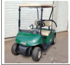
E-Z-GO RXV-E Golf Car, £1,250. EX-HIRE, AC 48-volt drive, drive by wire speed control, auto fall safe parking brake, on-board chargers.