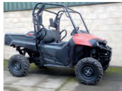
EX-DEMO – 2017 Honda UTV 700M2, 2/4wd and difflock, 2 year warranty, fitted towball, £8,995 TR