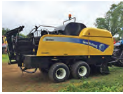
New Holland BB9060 Packer Cutter Baler, steer tandem axle, hydraulic brakes £ 39,000 AT