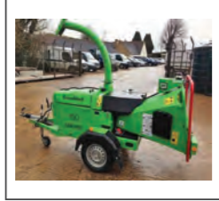
2016 GreenMech Arborist 150, £11,500. EX-DEMO, 150mm chipping capacity, 34hp Kubota engine, disc-blade chipping system, two year warranty.