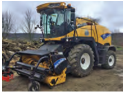
2011 New Holland FR9050 Forage Harvester, hours: engine 2134, chopping 1582. £83,000 RM