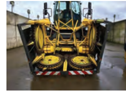
2002, New Holland RI600 Maize Header to fit 4wd self propelled £ 14,000 AT