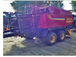
2002 New Holland BB940 Big Baler, 92000 Bales, good condition for age £17,500 AT