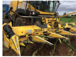
2008 New Holland A440 8 Row Maize Header £25,000 RM