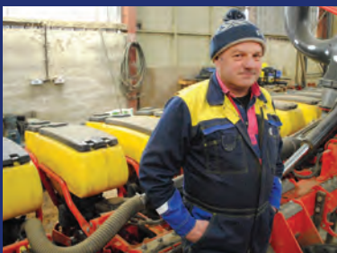
Impressive precision seed drilling