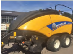
2016, New Holland BB1290 standard Big Baler, large wheels, steering axle, 14,000 bales £68,000 JW