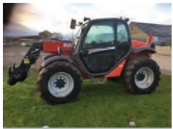
2010, Manitou MLT627, choice of JCB headstock or Manitou, very nice condition £25,250 CD