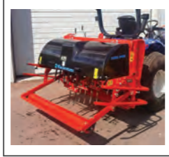
2014 Wiedenmann G160 Terra Spike, £11,500. EX-HIRE, deep aeration and removal of compactions up to 270mm, 1.6m width, manual depth control.