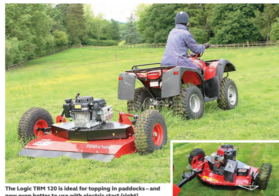
The Logic TRM 120 is ideal for topping in paddocks – and now even better to use with electric start (right).

A new addition to the Logic family of rotary mowers is the Logic TRM120B13FWES – with easy electric start!