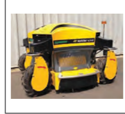
2016 Spider ILD 02 Remote Control Slope Mower, £19,000. EX-DEMO, 4-wheel steer mulching mower, slopes up to 40 deg, 48.4in cut, winch, beacon.