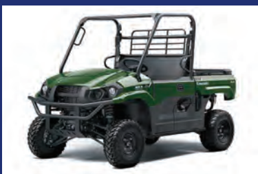
Mid-size offers power, comfort and payload