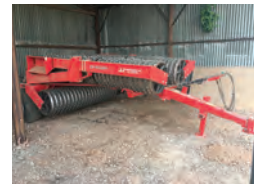
Heva XHD Tip Roller, two seasons old, 8.2m width, 24in Cambridge break rings £10,250 AD

Sales Hotline: 01373 465941 (Mon-Fri 08.00-17.00) Out of hours: 07710 985957