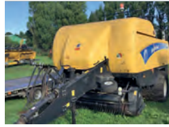
2011 New Holland BB9060 Packer Cutter Baler, 42,000 bale count, very good condition £ 37,500 AT