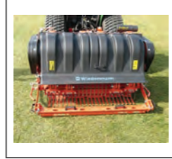
Wiedenmann SL6 Terra Spike, £14,250. Deep aeration and removal of compactions up to 21cm depth, exchangeable tine holders, rear roller, VibraStop.