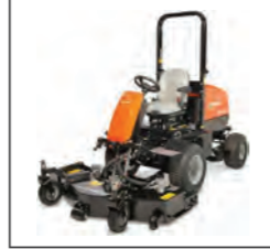
2016 Jacobsen Turfcut Rotary Mower, £12,000. EX-HIRE, 2 or 4wd, 24.8hp diesel, hydraulic deck and traction, 60in rear discharge deck.