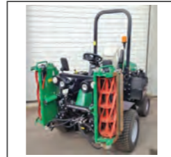
2017 Ransomes Parkway 3, £25,000. EX-DEMO/HIRE, 2.5m cut, on-demand 4wd, 6-knife Magna cutting unit, ROPS, Lights, 33.5hp Kubota diesel.