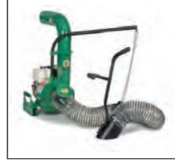
Billy Goat DL2500S Debris Loader, £3,400. 25 HP V-Twin engine, 18in, 6-blade, armour plated impeller with 18 cutting points, dual shredding, 5050cfm.