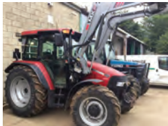
2012, Case IH JXU 95, 4wd, 24 x 24 speed shuttle transmission, air con, air seat, £35,000 RM