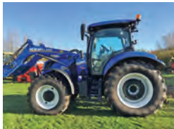
2016 New Holland T6.155, 50kph, NH Loader, front linkage & PTO, climate control £62,500 RM