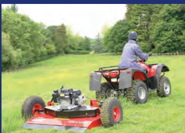
Electric start – it's Logic!