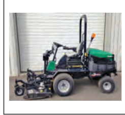
Ransomes HR300 Rotary Mower, From £10,000. 3-cylinder turbocharged diesel, hydraulic transmission, 60in cut, ROPS, lights & beacon.