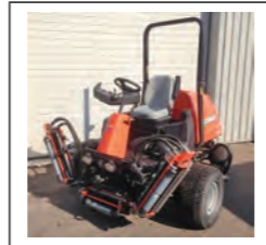
2015 Jacobsen LF550 Fairway Mower, £27,000. 2.54m cut, 4wd, programmable speed control, full text diagnostics, auto wet parking brakes, maintenance-free brakes.