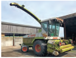
Claas Jaguar 800 Forage Harvester, in working order £10,000 RM