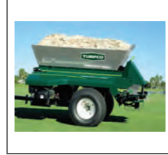
Turfco Widespin 1550 Trailed Top Dresser, £4,000. Switches easily from light to heavy spread, 30% more spinner angle, electronic control, consistent precision.