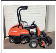
2013 Jacobsen Eclipse 322 Diesel Hybrid Riding Greens Mower, £9,500. EX-HIRE, 14hp diesel/electric hybrid, 3wd, dew whip holder, 11-knife cutting unit.