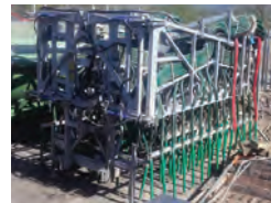
2014 Vogelsang 24m Dribble Bar, twin macerators, siemens flow meter £28,000 BG