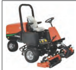
2015 Jacobsen TR3 Triple Mower, £11,500. EX-DEMO, 7-knife cutting cylinders, rear roller brushes, grooved front rollers with scrapers, backlap kit, ROPS.