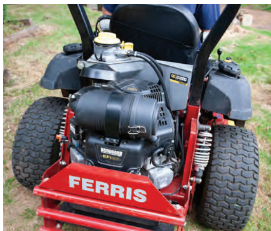
Top: Ferris IS®2100Z and IS®600Z zero turn mowers manoeuvre between the monuments at Coventry's 1847 London Road Cemetery. Above: The Ferris IS®2100X features a fuel injected engine with Oil Guard lubrication which extends oil change intervals to 500 hours.

News and information from the T H WHITE Group