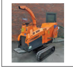
2014 Jensen A540 Variable tracked chopper, £15,500. 8in capacity, 37hp Kubota engine, 360deg rotating chute, hydraulic infeed control, adjustable trap.