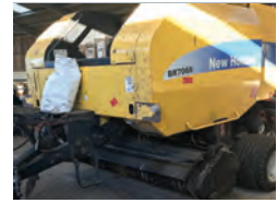
New Holland BR7060 Round Baler, good condition £11,000 RM