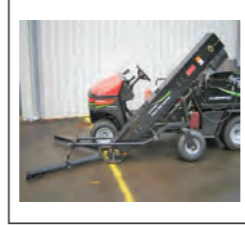
Jacobsen Core Harvester, POA, four available. EX-HIRE, pick-up, load and dump aeration cores in one step, for use with Jacobsen Truckster XD, warranted.