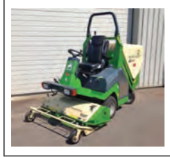
2017 Amazone Profihopper 4wd SmartCut, POA-various available. 1.2m cut, 2.1m high-tip collector, ROPS, road lighting kit, out-front mowing and scarifying unit.