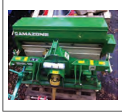
2017 Amazone Overseeder, £9,800. EX-HIRE, 1.5m wide, two adjustable rows of reciprocating tines, adjustable seed outlet, 12 month warranty.