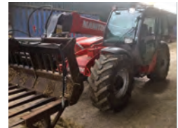
Available end June: 2013 Manitou MLT735 Powershift, just serviced, new tyres £31,500 CD