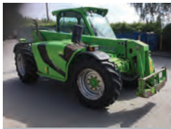
2015 Merlo 32.6, 3800cc, full service history, 4,600 hours, very good condition £28,250 CD