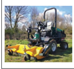
Ransomes HR300 Flail Mower, From £15,000. EX-HIRE, 3-cyl turbocharged diesel, hydraulic transmission, 1.6m cut, Mulching FM flail deck, ROPS, lights.