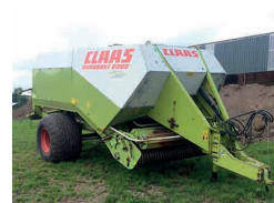
2002 Claas 2200 Big Square Baler, 120 x 70 bale, rotor feed, single axle, good working order £12,000 JW