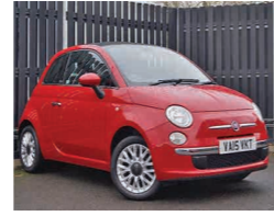
2015 Fiat 500C Pop Star, VA15 VKT, Red, 16,800 miles, £7,950. One Owner, Air Conditioning, Start/Stop, Hill Holder, Radio/CD/MP3, Electric Front Windows, 15in Alloy Wheels, TPMS.