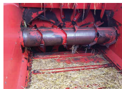
2008, Kuhn Primor 2060H Straw Chopper, good working order £6,500 RM