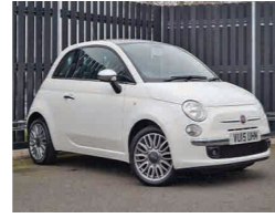
2015 Fiat 500 1.2 Cult Dualogic, VU15 UHM, White, 18,500 miles, £8,450. Auto Climate Control, Rear Parking Sensors, Fixed Glass Roof with Sunblind, Radio/CD/MP3, Leather Interior, Start/Stop.