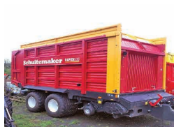
2017 EX-DEMO Schuitemaker Rapide 520S, air/hyd brakes, LED lights, mudguards £59,000 BW