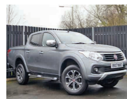
2017 Fiat Fullback 2.4 JTD LX Double Cab Pickup, RX17 NVO, Grey, 5,586 miles, £17,950+VAT. 4wd, Black Leather, Full History, Towbar, Satnav, Cruise, DAB, Climate Control, Privacy Glass.