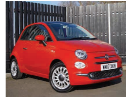
2017 Fiat 500 1.2 Lounge, WM17 XKN, Red, 10,140 miles, £9,750. Rear Parking Sensors, Cruise, Fixed Glass Sunroof, Air Conditioning, Front Seats with Memory, Hill Holder, 15in Alloys.