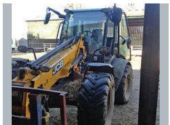
2011 JCB 310 Pivot Steer, 5,100 hours, pin & cone carriage, pick up hitch, immaculate £34,000 RL