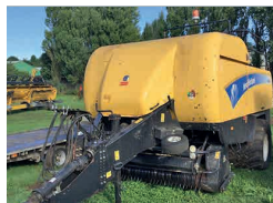
2011 New Holland BB9060 Packer Cutter Baler, 42000 bales, VGC £37,500 AT