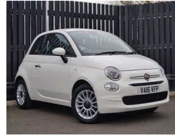
2016 Fiat 500 1.2 Pop Star Dualogic, VA16 VFP, White, 2,600 miles, £9,250. Full Dealership History, Start/Stop, Front Seats with Memory, 15in Alloys, Air Conditioning, Electric Windows.