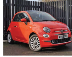
2016 Fiat 500 1.2 Lounge, WV66 CUX, Coral, 7,500 miles, £8,950. Front Seats With Memory Function, Start/Stop, Hill Holder, Cruise Control, Fixed Glass Sunroof, Start/Stop, TPMS.