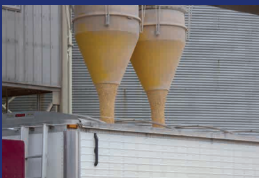
Remarkable dust suppression hopper