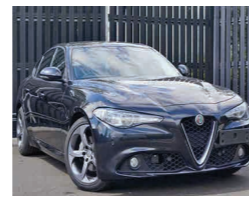
2017 Alfa Romeo Giulia 2.2 TD Super Auto, VA66 UCE, Vulcano Black, 9,000 miles, £25,950. Paddle Shift, Audio Upgrade, Convenience Pack, Driver Assistance Pack, Auto Wipers.