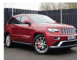
2015 Jeep Grand Cherokee 3.0 CRD Summit, VN65 JNX, Deep Cherry Red, 56,600 miles, £24,950. Natura Plus Leather, Heated Ventilated Front Seats, Rear DVD, Rear View Camera.