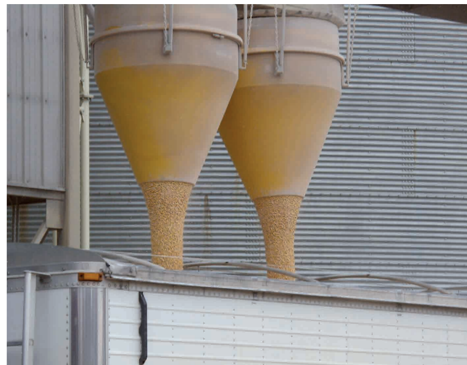
Twin hoppers in use for loading grain. The containment of dust in the stream is most evident.