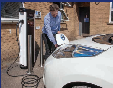
Recharge when you visit us in Devizes