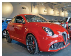
2018 Alfa Romeo MiTo 1.4 TYB MultiAir Veloce, VA67 EBV, Alfa Red, 10 miles only, £17,950. Sabelt Carbon Fibre Shell Seat, BOSE Sound System, Dual Climate Control, Alcantara, DAB.