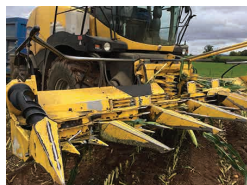
2008 New Holland A440 8 Row Maize Header £25,000 RM