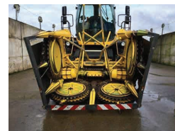
2002, New Holland RI600 Maize Header to fit 4wd self propelled £14,000 AT