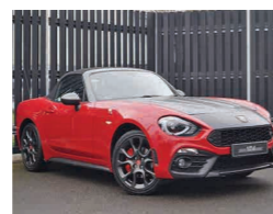
2016 Abarth 124 Spider 1.4 MultiAir, VN66 PNV, Red/Black, 23,126 miles, £21,450. Leather Abarth Seats, BOSE Audio, Visibility Pack, Heated Seats, Air Conditioning, Cruise, 17in Alloys.