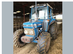
Ford 4610 c/w loader, good working order £10,000 RM