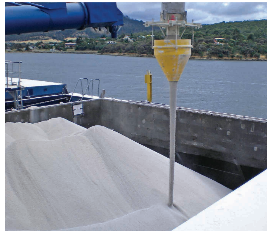
Loading at ports is an application where dust control is paramount. The DSH in action in Tasmania.

The dust suppression hopper really is a game-changer that could make a real difference to so many aspects of your business. You can explore the details on our dedicated web page by visiting www.thwhiteprojects.co.uk/dust-suppression-hopper , or call the T H WHITE Projects team on 01380 723040.