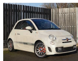
2013 Abarth 595C 1.4 T-Jet Turismo, RX13 NBZ, White Tri-Coat, 21,389 miles, £10,950. Convertible, Abarth Leather, Auto Climate Control, Tinted Rear Windows, Parking Sensors, Alloys.