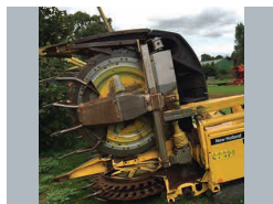
2004 New Holland RI600Y 8 Row Maize Header, to fit New Holland FR, very good condition £15,000 AT