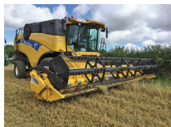
2015 New Holland CX8070, 25ft varifeed header and trolley, yield and moisture, rape knife £155,000 JW