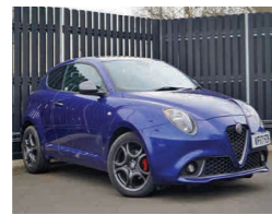
2017 Alfa Romeo MiTo 1.3 JTDM-2 Speciale, VF17 FZM, Cobalto Blue, 2,650 miles, £14,495. 5-Hole Dark Alloys, Leather, Heated Front Seats, Privacy Glass, Electric Sunroof.