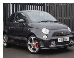
2015 Abarth 595 1.4 T-Jet Competizione, VK15 HGJ, Black, 13,680 miles, £12,950. Full Dealership History, Diamond Finish Alloys, Auto Climate Control, Tinted Glass, Parking Sensors.