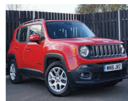
2016 Jeep Renegade 1.4 MultiAir II Longitude, WN16 JRZ, Colorado Red, 17,176 miles, £11,995. Air Conditioning, Cruise, Satnav, DAB Radio, 5in Touchscreen, Hill Start Assist, Start/Stop, Power Windows.