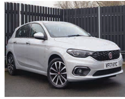
2017 Fiat Tipo 1.6 MultiJet Lounge, VF17 KYC, Silver, 6,950 miles, £11,950. Auto Climate Control, Cruise, DAB Radio, Rear View Camera, 17in Alloys, Electric Windows, TPMS.