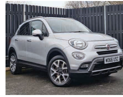
2017 Fiat 500X 1.6 MultiJet Cross, WO66 USC, Silver, 14,330 miles, £11,950. Half Eco-Leather, Satnav, 5in Touchscreen, Auto Climate Control, Cruise, DAB Radio, Rear Parking Sensor, Electric Windows.