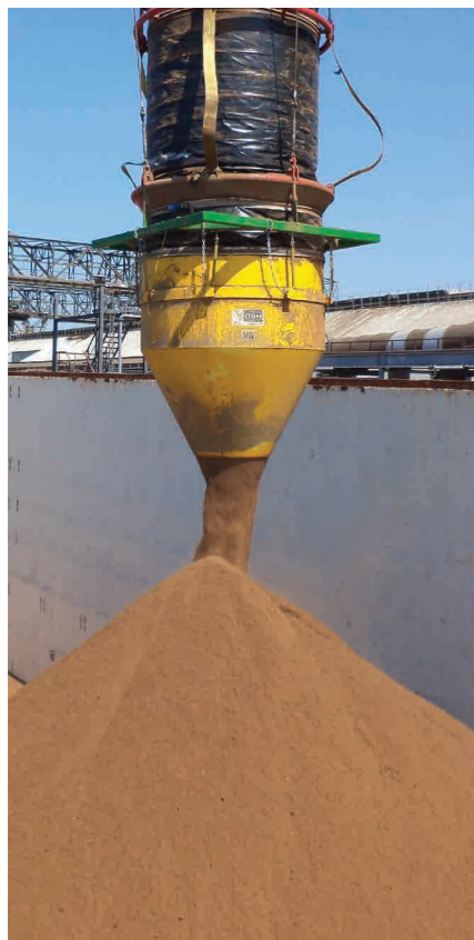
Abrasive aggregates can be handled effectively with a steel-built dust suppression hopper.