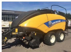
2016 New Holland BB1290 standard Big Baler, steering axle, extended warranty, 14000 bales £72,000 BW