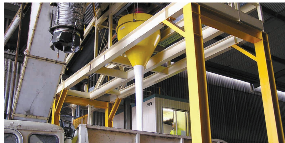
The dust suppression hopper was originally developed to reduce hazards when handling fertilisers. Here, urea fertiliser is being loaded - which could cause vomiting or nausea if ingested.

A major challenge in the commercial handling of powdery, granular or other free-flowing materials is dust control. Depending on the material being handled, dust may not just be unpleasant and unsightly - it can cause health issues, environmental hazards and even the risk of explosion.