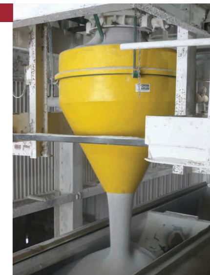
Not only is the dust contained while loading railway wagons, but ALL the product is loaded resulting in higher yields.

Applications for the dust suppression hopper are enormous. Across the grain processing industry its benefits can be