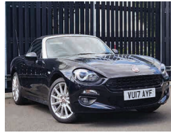
2017 Fiat 124 Spider 1.4 MultiAir Lusso, VU17 AYF, Black, 2,000 miles, £17,950. Auto Climate Control, Rear Camera, Parking Sensors, Leather, Heated Seats, Electric Windows, EX-DEMO!