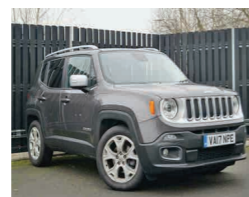
2017 Jeep Renegade 1.6 MultiJet II Limited, VA17 NPE, Multicolour, 7,741 miles, £20,950. MySky Roof, Auto Lights, Rain Sensor, Function Pack, Visibility Pack, Leather, Dark Tinted Glass, Climate Control, Radio.