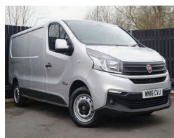
2016 Fiat Talento 1.6 JTD MultiJet L2H1 Panel Van, WN16 CVJ, Silver, 12,000 miles, £12,450+VAT. Air Conditioning, Cruise with Speed Limiter, Parking Sensors, Black Cloth, LED Running Lights.