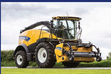
'Grassmen' to join us at GRASSLAND UK