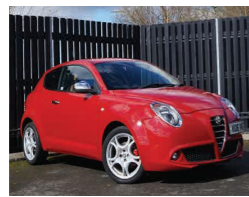
2016 Alfa Romeo MiTo 1.3 JTDM-2 Distinctive, VU16 VND, Alfa Red, 24,358 miles, £8,650. Tan Leather Interior, Dark Tinted Glass, Electric Folding Door Mirrors, Climate Control, PDC.