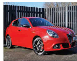
2017 Alfa Romeo Giulietta 1.4 TB MultiAir Sprint Speciale, VA65 HDO, Alfa Red, 23,865 miles, £13,995. Auto Climate Control, Dark Tinted Glass, 5-Hole Dark Gloss Alloys, Cruise.