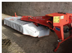
2012, Kuhn FC283 Mower, good condition £5,600 RM