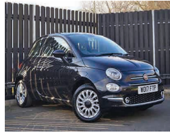
2017 Fiat 500 1.2 Lounge, WO17 FTP, Metallic Black, 6,700 miles, £9,750. Air Conditioning, Fixed Glass Sunroof, Electric Windows, Front Seats with Memory, Hill Holder, Rear Parking Sensors.