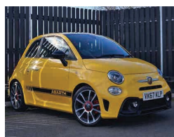
2017 Abarth 595 1.4 T-Jet Turismo, VK67 KLP, Yellow, 6,500 miles, £15,250. Electric Sunroof, Abarth Leather, Auto Climate Control, Tinted Rear Windows, Electric Glass, Turismo Wheels.