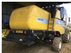
2008 New Holland CSX7080, 20ft varifeed header, 1050 engine/867 threshing hrs £155,000 JW