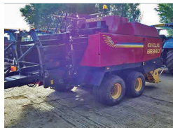
2002 New Holland BB940 Big Baler, 92000 Bales, good condition for age £17,500 AT