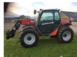
2010, Manitou MLT627, choice of JCB headstock or Manitou, very nice condition £25,250 AD