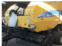
New Holland BR7060 Round Baler, good condition £11,000 RM