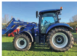
2016 New Holland T6.155, 50kph, NH Loader, front linkage & PTO, climate control £62,500 RM