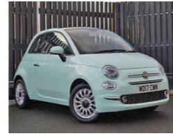
2017 Fiat 500 1.2 Lounge, WO17 CWN, Blue, 5,041 miles, £9,750. Low Mileage, One Owner, Front Seats with Memory, 15in Alloys, Glass Sunroof with Sunblind, Aircon, Rear Parking Sensor.