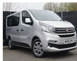
2016 Fiat Talento 1.6 JTD MultiJet EcoJet 12 L2H1 SX Combi, WV66 UPH Silver, 4,300 miles, £18,950+VAT. EX-DEMO, Black Cloth, Cruise, Satnav, Air Conditioning, Parking Sensor, 17in Alloys.