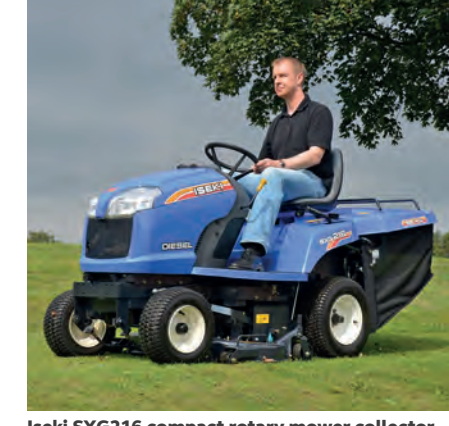
Iseki SXG216 compact rotary mower collector. Wessex International produce trailed mowers that can be used with tractors or ATVs.

If you prefer to use a trailed mower with an existing tractor or ATV we can supply an extensive choice from UK manufacturer Wessex International, or flail mower/toppers from the Logic range. Of course, there may be times when