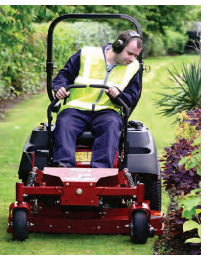
The Ferris IS<sup>®</sup>600Z features independent suspension and zero turn capability.

many features usually only found on larger or more expensive tractors. Also from Iseki come the SXG series of compact ride-on mowers with high levels of manoeuvrability, reliability and integrated grass collection.