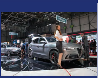
Stardust from Geneva