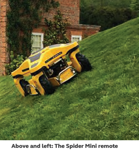
controlled slope mower has remarkable climbing abilities and is also a superb solution for general remote controlled mowing around estates.

design offer the versatility required for challenging terrain or tight and awkward locations. In terms of compact tractors suitable for estate work it would be hard to beat the new Iseki TLE 3400 premium economy model. With a 38hp engine, 3-range hydrostatic drive, spool valve, PTO, drawbar and ROPS it offers