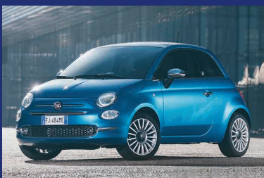
Fiat Mirror for a fully connected experience