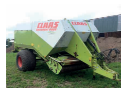
2002 Claas 2200 Big Square Baler, 120 x 70 bale, rotor feed, single axle, good working order £12,000 JW