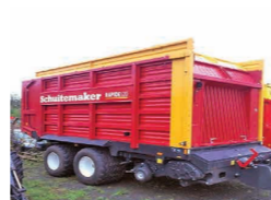
2017 Ex-Demo Schuitemaker Rapide 520S, air/hyd brakes, LED lights, mudguards £59,000 BW