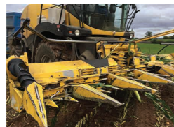
2008 New Holland A440 8 Row Maize Header £25,000 RM