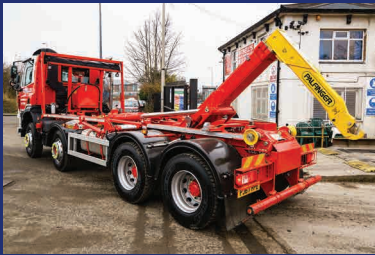
Palfinger hook loaders for Bithells