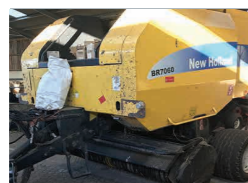
New Holland BR7060 Round Baler, good condition £11,000 RM