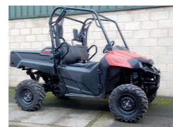
EX-DEMO - 2017 Honda UTV 700M2, 2/4wd and difflock, 2 year warranty, fitted towball, £10,250 TR