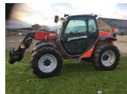
2010, Manitou MLT627, choice of JCB headstock or Mantiou, very nice condition £25,250 AD