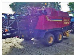
2002 New Holland BB940 Big Baler, 92000 Bales, good condition for age £17,500 AT