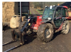
2011 Manitou MLT 634T, 120 LSU PS, pin & cone, excellent condition £31,000 JW