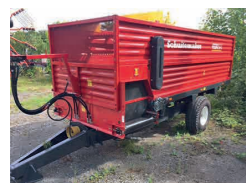
2017 Schuitemaker Feedo 50.8 Feeder Wagon, variable floor speed, beaters & cross conveyor £14,000 BW