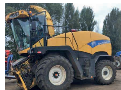
2010 New Holland FR9060, 4wd, grass & maize £78,500 AT