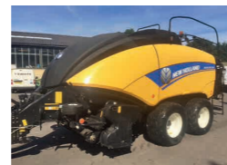
2016 New Holland BB1290 standard Big Baler, steering axle, extended warranty, 14000 bales £72,000 BW