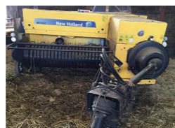
New Holland BC5060 Baler, like new, only done small amount of work £10,200 RM