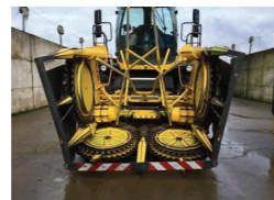
2004 New Holland, RI600Y 8 Row Maize Header, to fit New Holland FR, very good condition £15,000 AT