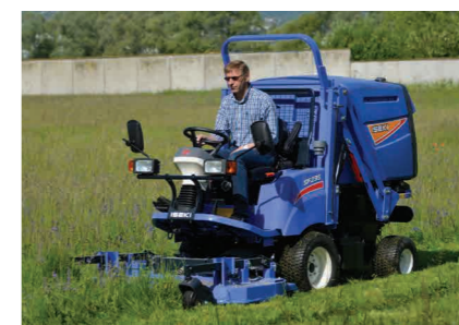
Iseki SF235 out-front rotary mower collector

Please contact any T H WHITE Groundcare branch for full details.