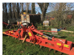
2005 Kuhn HR6003 folding Power Harrow, ready to work £11,500 RM