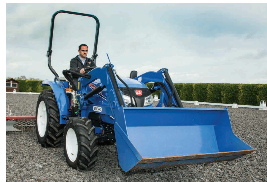
Iseki TLE 3400 premium economy tractor fitted with optional front loader and bucket.

Two new high-performance out-front rotary mower-collectors have also been launched - the Iseki SF224 and SF235, offered with 22hp or 32.5hp Iseki diesel engines and either 54in (1370mm) or 60in(1525mm) wide decks respectively. The new mowers are designed to facilitate grass cutting and collection in difficult areas and are equipped with easy-to-use two-pedal hydrostatic transmission and automatic or selectable 4WD. There is also a lockable differential for use when conditions demand it. To ensure efficient engine cooling the radiator is fitted with an automatic reversing fan, thus preventing blockage of the grille.