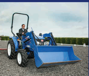
New Iseki compact tractor and mowers