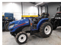
2016, Iseki TG6490, 36hp, 1,100 hrs, features new IQ dual-clutch transmission, resprayed £9,995 PC