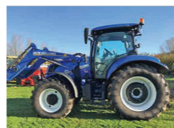
2016 New Holland T6.155, 50kph, NH Loader, front linkage & PTO, climate control £62,500 RM