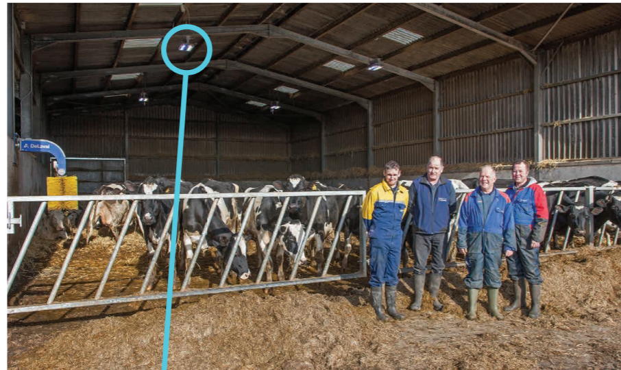
David and Will Morgan (on the right) with Neil Cartmell and George Eno from T H WHITE (on the left) at the shed where the Morgans' cows are housed over winter. Four DeLaval CL6000 LED lighting units have resulted in an increased milk yield of around 3 litres per cow.

To make the lighting effective you can't just use any light. Cows see a different part of the visible spectrum from humans so it's important not only to achieve the correct lux levels (brightness of illumination) but also the right colour