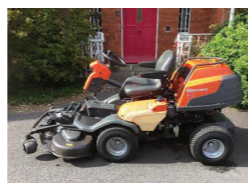
2014 Husqvarna HM P524 Outfront Mower, hydrostatic 4wd, 112cm combi deck £5,500 SK

Sales Hotline: 01373 465941 (Mon-Fri 08.00-17.00) Out of hours: 07710 985957