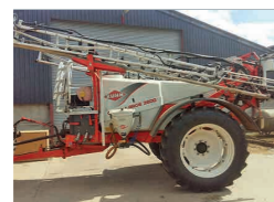
2012 Kuhn Trailed Sprayer, 3200 RHPA, 24m booms alloy, 2800 ltr, auto steer drawbar £21,500 SC