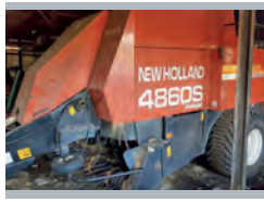
1995 New Holland 4860S Big Rectangular Bales £6,000 RM