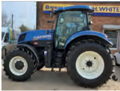
2014 New Holland T7.200 Range Cmd, 4100 hrs, terraglide front suspension, excellent £39,500 AD