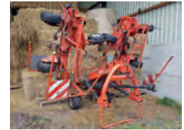
2013 Kuhn GF7902 Tedder, very little use £7,000 RM