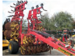
2011 VADERSTAD Rexius Twin 4.5m Press, c/w levelling boards, raptor tines, VGC £21,000 RL