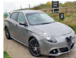
2016 Alfa Romeo Giulietta 1.7 TBI Quarfoglio Verde, VX16 RRU, Matt Grey, 3,000 miles, £20,494. 18in Turbine Design Alloy Wheels, Leather/Alcantara, Dark Tinted Windows, Cruise.