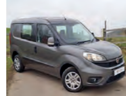
2016 Fiat Doblo 1.3 JTD MultiJet II 16v L1H1 SX Panel Van, VE16 VBM, Metallic Grey, 13 miles only, £9,450+VAT. Red Cloth Interior, 4x2, Radio/CD/MP3, Electric Windows.