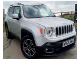
2015 Jeep Renegade 1.6 MultiJet Limited, WP65 BNO, Metallic Glacier, 11,713 miles, £14,497. Climate Control, Heated Seats, DAB Audio, Power Windows, 18in Alloys, Leather Upholstery, Alarm.