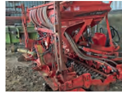
2010 Kuhn Power Harrow and Drill £12,750 JW