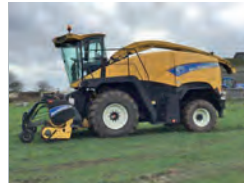
2008 NH FR9050, 4wd, 2170 cutting hrs, 2851 engine hrs, crop processor, auto greasing £59,000 RM