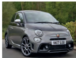
2017 Abarth 595 1.4 T-Jet Turismo, VK17 UJU, Two-Tone Grey, 20 miles only, £17,743. Abarth Leather, Beats HiFi, Satnav, 7in Touchscreen, Auto Climate Control, Privacy Glass.