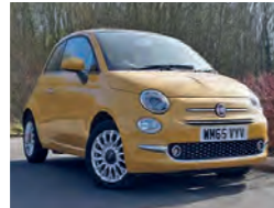
2015 Fiat 500 1.2 Lounge, WM65 VYV, Yellow, 10,800 miles, £8,650. Air Conditioning, Start/Stop, Glass Sunroof with Sunblind, Electric Front Windows, Memory Seats, Hill Holder, PDC.