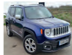
2015 Jeep Renegade 2.0 MultiJet II Limited, VU66 EHG, Blue, 8,800 miles, £19,999. Leather, Parking Pack, Adjustable Cargo Floor, 8-Way Power Front Seats, Satnav, Aircon, Heated Seats, Cruise.