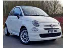
2016 Fiat 500 1.2 Pop Star, WV66 XXB, White, 20 miles only, £9,250. Denim Edition, Touch Screen, Air Conditioning, Memory Seats, Electric Front Windows, 15in Alloys, Start/Stop.