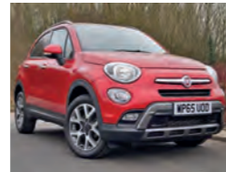
2016 Fiat 500X 1.6 MultiJet, WP65 UOD, Red, 10,700 miles, £11,250. Dual Zone Climate Control, Touchscreen Parking Sensors, Cruise, Start/Stop, Tinted Glass, Leather/Fabric.