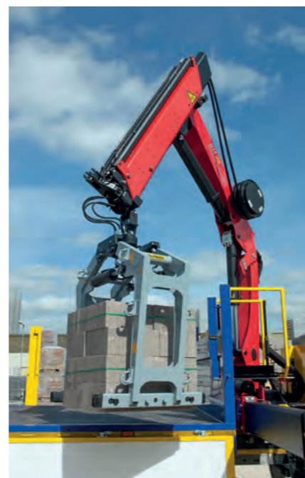
'Sophisticated geometry' enables the Palfinger BM26 builders merchants crane to operate safely with heavy loads in confined spaces.

Protected hose guidance and hose drum are fitted as standard and a hydraulic supply is carried through the boom for auxiliary equipment.