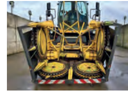
2002 New Holland R1600 Maize Header, good condition £14,000 RM