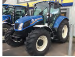
Ex-Hire New Holland T5, approx 300 hrs, available late July, c/w 0% finance & warranty £POA BW