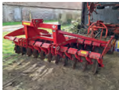
2015 Teagle Multidisc 300, excellent condition £6,500 RM