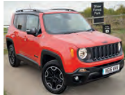
2016 Jeep Renegade 2.0 MultiJet II Trailhawk, VE16 VHV, Colorado Red, 4,000 miles, £20,9599. Leather, Low Ratio Gearbox, Satnav, Aircon, Cruise, DAB Audio, 17in Alloys, Power Windows.