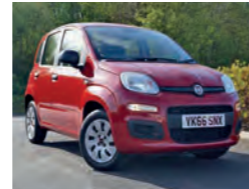
2016 Fiat Panda 1.2 Pop, VK66 SNX, Red, 2,000 miles, £6,950. Ex-Demo, Low Mileage, Radio/CD/MP3, Electric Front Windows, Anti-Whiplash Head Restraints, Hill Holder, Start/Stop.