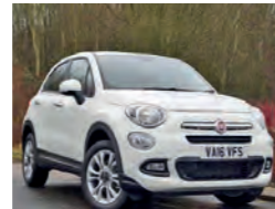
2016 Fiat 500X 1.6 E Pop Star, VA16 VFS, White, 1,500 miles, £14,250. Dual Zone Climate Control, Cruise, 17in Alloys, Touchscreen Bluetooth Audio Streaming, Hill Holder, TPMS.