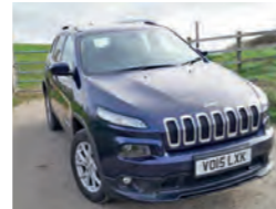
2015 Jeep Cherokee 2.0 CRD Longitude Plus, VO15 LXX, True Blue, 20,685 miles, £16,953. Satnav, Parking Sensors, Park Assist, Auto Air Conditioning, 17in Aluminium Wheels, Cruise, Thatcham Alarm.