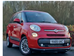
2016 Fiat 500L 1.6 MultiJet Lounge, VA65 UAC, Red, 10 miles only, £14,396. Pre-Reg 7-Seat Model, Cruise, 17in Alloys, Dual Zone Climate Control, Rain Sensor, Auto Headlights, Cruise.