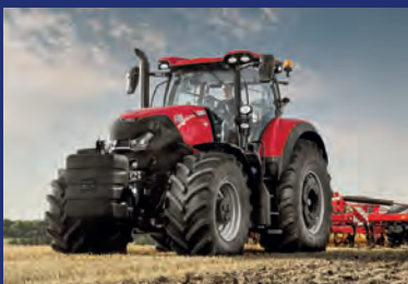
Join our Red Power Day!