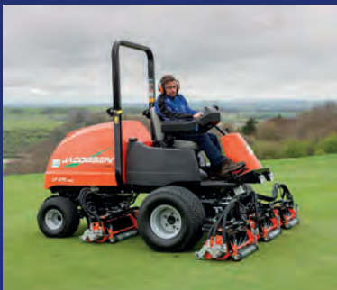
Major re-equipping sets Goring & Streatley on course for success