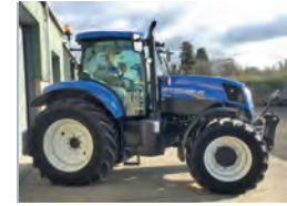
2014 New Holland T7.200 Power Command, 2245 hrs, 50 kph, air brakes, full spec tractor £52,000 MH