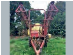
Hardi 18m Sprayer, c/w MOT, very good condition £6,950 AT