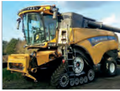
2015 New Holland CX8.80 Combine, 30ft varifeed hdr, full guidance & mapping, approx 320 hrs £200,000 MH