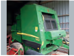
John Deere 582 Baler, variable chamber, 10,500 bales, immaculate condition £6,500 RL