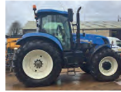
2013 New Holland T7.270, guidance ready, Michelin VF tyres, full service history £59,500 AT