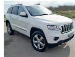
2013 Jeep Grand Cherokee 3.0 CRD V6 Overland, WV13 CPE, White, 20,000 miles, £22,950. Leather, Heated Seats, Adaptive Cruise Control, 20in Alloys, Blind Spot Monitoring, Parking Aid.