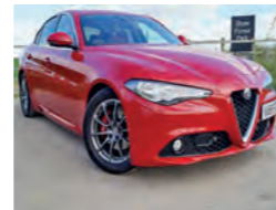
2017 Alfa Romeo Giulia 2.2 TD Tecnica Auto, VK66 DZN, Alfa Red, 6,000 miles, £26,950. Great Value Demonstrator, 17in Alloys, Driver Assistance Pack, Climate Control, DAB, Privacy Glass, PDC.