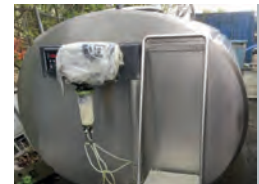
1995 DeLaval 3,500 LTR DXC Bulk Milk Tank c/w compressors £3,650 AM

Sales Hotline: 01373 465941 (Mon-Fri 08.00-17.00) Out of hours: 07710 985957