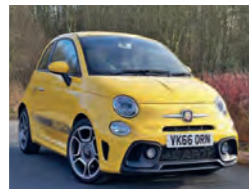
2016 Abarth 595 1.4 T-Jet, VK66 ORN, Yellow, 4,200 miles, £13,950. Air Conditioning, Satnav, Electric Windows, Front Fogs, TFT Instruments, Sport Seats, Six Speakers, Uconnect, TPMS.