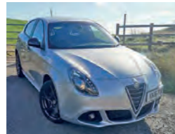
2016 Alfa Romeo Giulietta 2.0 TBI Quarfoglio Verde, VX16 PPU, Silver, 9,200 miles, £18,949. Silver, Bose Sound System, 17in 5-Hole Dark Alloys, Cruise, Parking Sensors, Rain Sensor, Start/Stop.