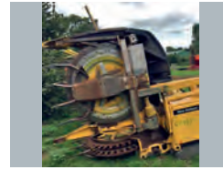
2004 New Holland 8 Row Maize Header, to fit New Holland FR. Very good condition £15,000 AT