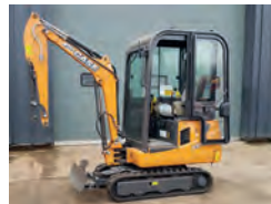
Built 2015, Case IH CX18 Cab Excavator, 4 hrs engine, 1.8t, blade, rubber tracks, £14,700 SCT