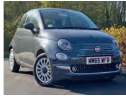
2015 Fiat 500 1.2 Lounge, WM65 WFB, Grey, 10,000 miles, £8,750. Air Conditioning, Start/Stop, Glass Sunroof with Sunblind, Electric Front Windows, Memory Seats, Hill Holder, 15in Alloys.