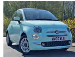
2015 Fiat 500 1.2 Lounge, WM65 WLB, Blue, 9,300 miles only, £8,650. Rear Parking Sensors, Air Conditioning, Start/Stop, Glass Sunroof with Sunblind, Electric Front Windows, Memory Seats.