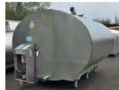
2002 Fabdec 7000 ltr DX Bulk Milk Tank c/w compressors £4,000 AM