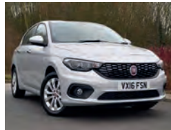
2016 Fiat Tipo 1.6 MultiJet II Easy Plus, VX16 FSN, Silver, 7,300 miles, £13,950. Ex-Demo, Air Conditioning, Start/Stop, Electric Windows, 16in Alloys, Start/Stop, Bluetooth, Satnav.