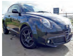
2016 Alfa Romeo MiTo 1.6 JTDM-2 QV Line, VA16 SZJ, Black, 2,500 miles, £13,950. Cruise, Voice Recognition, Third Rear Seat, Climate Control, Quadrifoglio Alloys, Dark Glass.