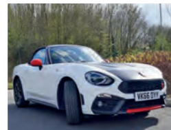
2016 Abarth 124 Spider 1.4 MultiAir, VK66 DYY, White, 2,000 miles, £26,950. Ex-Demo, Bose Audio, Visibility Pack, Heritage Pack, Abarth Leather, Heated Seats, Air Conditioning, TPMS.