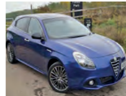
2015 Alfa Romeo Giulietta 2.0 JTDM-2 Collezione, VE16 LJY, Metallic Blue, 3,000 miles, £17,500. Leather/Microfibre, Bose Sound System, Heated Seats, 18in Diamond Finish Alloys.