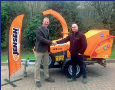
Jensen chippers strengthen Machinery Imports line-up