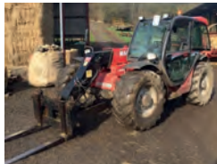
2011 Manitou MLT 634T, 120 LSU PS, pin & cone, excellent condition £32,000 JW