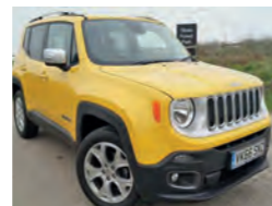
2016 Jeep Renegade 1.4 MultiAir II Limited, VK66 SNZ, Solar Yellow, 4,392 miles, £19,995. DAB Audio, Satnav, Heated Front Seats, Privacy Glass, Leather, Climate Control, 18in Alloys.