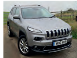
2016 Jeep Cherokee 2.2 MultiJet II Limited Active Drive II, VK16 VOY, Billet Silver, 8,000 miles, £26,950. Panoramic Sunroof, Magic Parking, 18in Polished Alloys, Nappa Leather, Alarm.