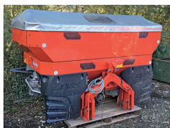
2012 Kuhn Axis 40.1 Fertiliser Spreader, first used in 2013. Immaculate condition £7,000 MH