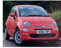
2016 Fiat 500 1.2 Pop Star, VK66 TNF, Glam Coral, 10 miles only, £9,431. Delivery Mileage, Air Conditioning, Start/Stop, 15in Alloys, Electric Front Windows, Front Seats with Memory.