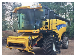
2011 CX8060 Combine, c/w 24' varifeed header, self levelling, 6 straw walker, 1000 drum hours £95,000 JW