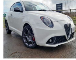
2016 Alfa Romeo Giulietta 1.4 TB MultiAir Veloce, VK65 PFD, White, 5,000 miles, £15,950. Cloth/Alcantara, Auto Climate Control, 18in Alloys, DAB Audio, Cruise, 18in Alloys, Privacy Glass.