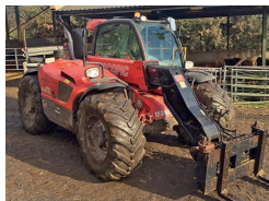
2011 Manitou MLT 634T, 120 LSU PS, c/w pin & cone, excellent condition £POA JW