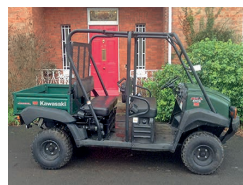
2013 Kawasaki 4010 Mule Trans, 4 x 4 Diesel, VGC, road legal, 680 hrs, towball £6,250 SK