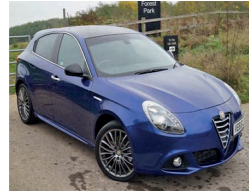
2016 Alfa Romeo Giulietta 2.0 TD2M-2, VE65 LJY, Multicolour/Metallic Blue, 3,000 miles, £17,640. Leather/Microfibre, BOSE HiFi, Climate Control, Cruise Parking Sensors, 18in Alloys, Start/Stop.