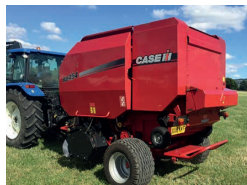
2008 Case RBX454 Rotor Feeder, variable chamber round baler, net & twine 29,000 bales £6,500 RD