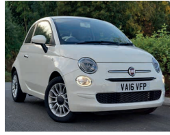
2016 Fiat 500 1.2 Pop Star Dualogic Automatic, VA16 VFP, White, 1,000 miles, £10,720. Ex-Demonstrator, Start/Stop, Air Conditioning, Front Seats with Memory, Hill Holder, 15in Alloys.