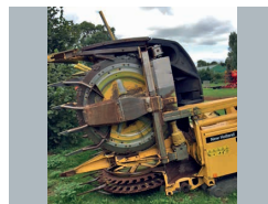
2004 New Holland 8 Row Maize Header, to fit New Holland FR. Very good condition £15,000 AT