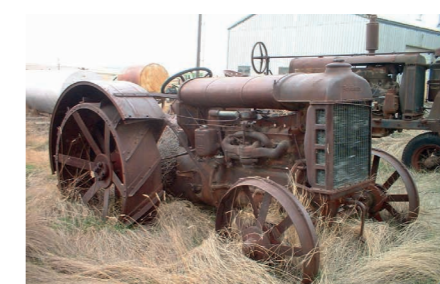
Left: Old tractors never die – quite a few Fordson Model Fs survive, slowly rusting. Below: Line-up of the latest New Holland tractors a far cry from the early types.

T H WHITE has remained a dealer ever since, first for Fordson, then Ford and now New Holland. New Holland was acquired by Ford in 1986, then Fiat in 1991, and is now part of CNH Industrial.