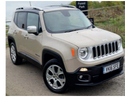
2016 Jeep Renegade 2.0 MultiJet II Limited, VK16 SFE, Moave Sand, 2,000 miles, £18,445. Black Roof, Satnav, Air Conditioning, Cruise, DAB Audio, Privacy Glass, Leather, Power Windows, TPMS.