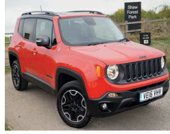
2016 Jeep Renegade 2.0 MultiJet II Trailhawk, VE16 VHV, Colorado Red, 4,000 miles, £21,950. Satnav, Air Conditioning, Cruise, DAB Audio, Low Ratio Gearbox, Leather, Power Windows, Alarm.