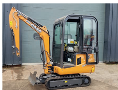
Built 2015, Case IH CX18 Cab Excavator, 4 hrs engine, 1.8t, blade, rubber tracks, £14,700A SCT