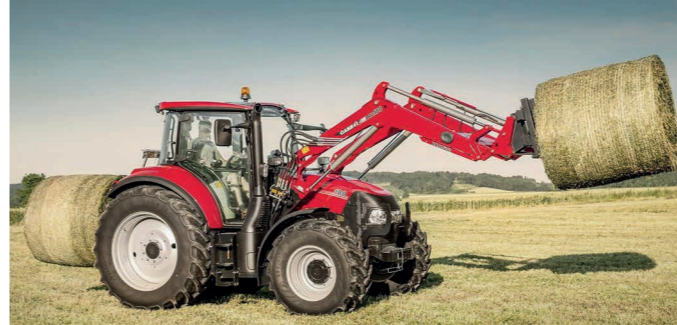
The new Case IH Luxxum

The next event for the team will be the Cereals Show in June, being held this year in Lincolnshire where we look forward to another successful event for the T H WHITE Projects Division.