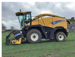
2008 FR9050, 4wd, 2170 cutting hrs, 2851 engine hrs, crop processor, auto greasing £59,000 RM