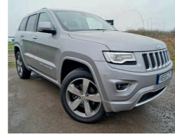
2016 Jeep Grand Cherokee 3.0 CRD Overland, VE65 ZYT, Billet Silver, 8,500 miles, £33,500. Leather, Satnav, Sunroof, Cruise, Heated Seats, Lumbar Support, Parking Aid, Electric Door Mirrors.