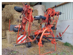
2013 Kuhn GF7902 Tedder, very little use £7,000 RM