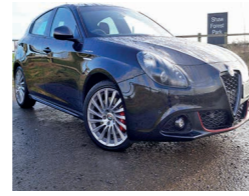
2016 Alfa Romeo Giulietta 1.7 Veloce, VE66 EHO, Metallic Alfa Black, 8,500 miles, £21,662. Sports Leather, DAB Audio, 18in Turbine Wheels, Front & Rear Parking Sensors, Privacy Glass.