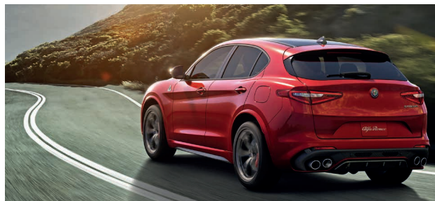
The new Alfa Romeo Stelvio SUV (above) is named after the dramatic Stelvio Pass (below), one of the greatest Alpine roads which climbs over 6,000ft from the valley floor with no less than 75 hairpin bends.

A hint of the performance and tenacious roadholding that can be expected from this stunning new Alfa is given in the name – Stelvio, the highest mountain pass in Italy (and the second highest in Europe), boasting a dizzyingly fast rise in altitude to 2,758 metres (9,048ft) in just over 12 miles, with 75 hairpin bends along the way!