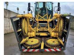
2002 New Holland R1600 Maize Header, good condition £14,000 RM