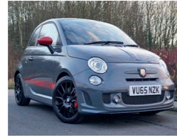
2016 Abarth 595 1.4 T-Jet Competizione, VU65 NZK, Grey, 7,800 miles, £15,250. Titanium Finish Alloys, Tinted Glass, Air Conditioning, Abarth Corsa Interior, Sports Seats, Front Fogs.