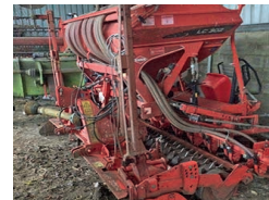
2010 Kuhn Power Harrow and Drill £12,750 JW