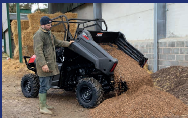
First drive of new Honda Pioneer UTV