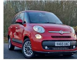
2016 Fiat 500L 1.6 MultiJet Lounge, VA65 UAC, Red, 10 miles only, £14,396. Pre-Reg 7-Seat Model, Electric Sunroof, Dual Zone Climate Control, Rain Sensor, Auto Headlights, Cruise.