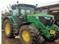
Choice of two - 2013 John Deere 6210R Auto Power £45,000 RL