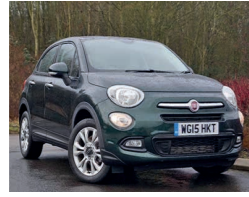
2015 Fiat 500X 1.4 MultiAir Pop Star, WG15 HKT, Green, 6,500 miles, £10,957. Auto Dual Zone Climate Control, Cruise, Uconnect Radio Live, 17in Alloys, Electric Windows, Start/Stop.