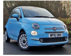
2016 Fiat 500 1.2 Lounge, WP16 SMX, Volare Blue, 1,200 miles, £8,778. Air Conditioning, Fixed Glass Roof with Sunblind, Rear Parking Sensors, Start/Stop, 15in Alloys, Front Seats with Memory.