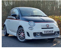
2015 Abarth 595 1.4 T-Jet Turismo, VA15 WUR, Bicolour, 6,000 miles, £12,450. Red Full Leather, 17in Diamond Finish Alloys, Auto Climate Control, Tinted Rear Glass, Climate Control.