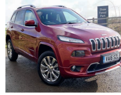
2016 Jeep Cherokee 2.2 MultiJet II Active Drive II Overland, VA16 SZL, Deep Cherry Red, 5,500 miles, £28,950. Leather, Overland Pack, Air Con, Dual Pane Panoramic Sunroof, Cruise, Park Assist, Alarm.