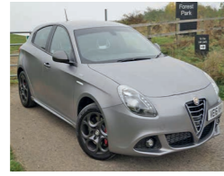
2016 Alfa Romeo Giulietta 1.4 TB MultiAir Sprint Speciale, VE16 VHY, Matt Magneso, 4,500 miles, £17,950. Dark Finish Alloys, Tinted Glass, One-Touch Windows, Rain/Dusk Sensor, Hill Holder.