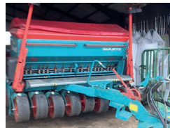
2010 Sulky 3m Direct Drill, immaculate condition £17,000 RL