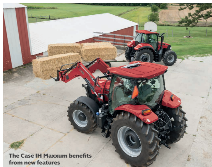
The Case IH Maxxum benefits from new features

Our Case IH specialists are ready to arrange a personal demonstration on your farm – just call your nearest Agricultural branch.