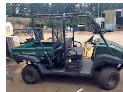
2012 Kawasaki 4010 Mule KAF950, diesel, 800 hrs £6,250 SC

Sales Hotline: 01373 465941 (Mon-Fri 08.00-17.00) Out of hours: 07710 985957