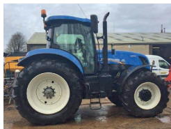
2013 New Holland T7.270, guidance ready, Michelin VF tyres, full service history £59,500 AT