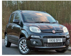
2016 Fiat Panda 0.9 TwinAir Lounge, VK16 SFV, Black, 3,500 miles, £8,382. Ex-Demo, Air Conditioning, Start/Stop, Radio/CD/MP3, Electric Front Windows, 15in Alloys, Hill Holder, TPMS.