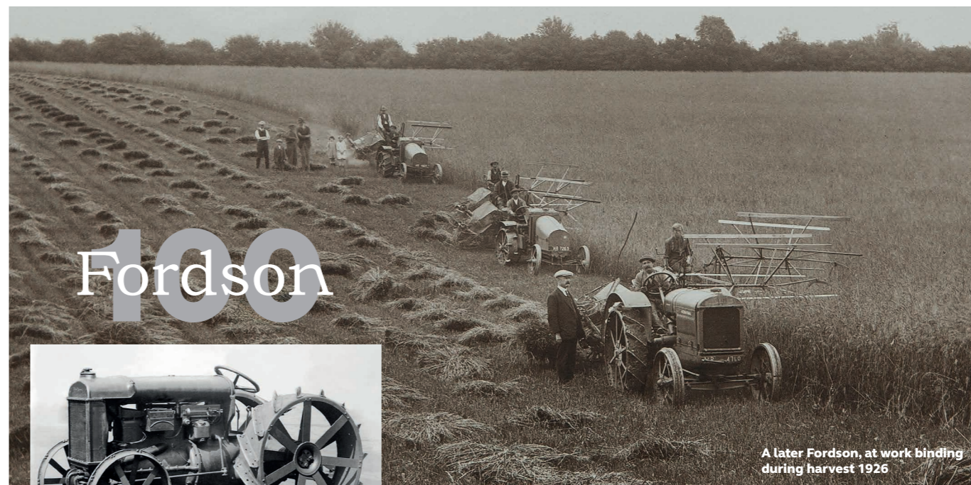
A later Fordson, at work binding during harvest 1926

T H WHITE is equally proud of its long-term relationship with Ransomes Jacobsen, for whom it is one of the UK's key dealers. Details of the latest Ransomes Jacobsen machines, as well as T H WHITE's legendary after sales, parts and service, can be found at www.thwhitegroundcare.co.uk