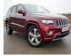
2016 Jeep Grand Cherokee 3.0 CRD Overland, VU66 EHR, Metallic Red Velvet, 4,000 miles, £36,950. Nappa Leather, Dual Panoramic Sunroof, Memory Seats, Heated Ventilated Seats, Cameras.