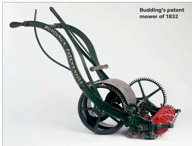
Budding's patent mower of 1832

Although Ransomes Jacobsen no longer produces domestic lawnmowers, it is today one of the leading commercial mower manufacturers supplying equipment to golf courses, local authorities, landscape contractors, sports clubs and major sports stadia worldwide.