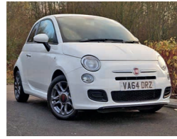
2016 Fiat 500 1.2 S, VA64 DRZ, White, 18,500 miles, £6,892. Air Conditioning, Start/Stop, Blue&Me Hands Free, Voice Recognition, 7in TFT Screen, Radio/CD/MP3, Tinted Glass.