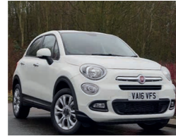
2016 Fiat 500X 1.6 E Pop Star, VA16 VFS, White, 100 miles only, £14,450. Auto Dual Zone Climate Control, Cruise, Uconnect Radio Live, 5in Touchscreen, 17in Alloys, Electric Windows, Start/Stop.