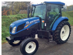
2015, New Holland TD5.95 Powershuttle, 2WD, 2,500 hrs £14,500 BW