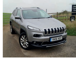
2016 Jeep Cherokee 2.2 MultiJet II Limited Active Drive II, VK16 VOY, Billet Silver, 8,000 miles, £28,621. Special Paint, Panoramic Sunroof, Technology Pack, Air Conditioning, Cruise, Park Assist.