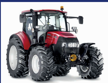
New Case IH Luxxum and revised Maxxum