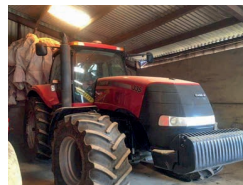
2009 Case IH Magnum, powershift, front weights, 5 electronic remotes, 600 pro screen, £45,000 SP