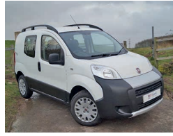
2016 Fiat Fiorino 1.3 JTD MultiJet II Adventure Combi, VE16 VBL, White, 136 miles, £8,450. Stunning Value, Low Mileage, Start/Stop, Electric Windows, Radio/CD, Grey Cloth.