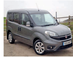
2016 Fiat Doblo 1.6 JTD MultiJet II 16V Combi, VE16 UWT, Metallic Grey, 7,501 miles, £8,950. Black Cloth, 5-Seat Model, Sliding Rear Doors, Alloy Wheels, Tinted Glass, 50mpg.