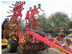
2011 VADERSTAD Rexius Twin 4.5m Press, c/w levelling boards, raptor tines, VGC £23,000 RL