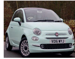
2016 Fiat 500 1.2 Lounge, VO16 WYJ, Green, 1,531 miles, £9,950. Ex-Demonstrator, Start/Stop, Air Conditioning, Rear Parking Sensors, Glass Roof with Sunblind, Electric Front Windows.