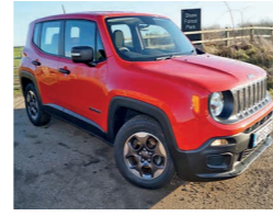
2015 Jeep Renegade 1.6 MultiJet Sport, WP65 ZBE, Colorado Red, 13,507 miles, £12,950. Air Conditioning, DAB Audio, 16in Alloys, Express Electric Windows, Start/Stop, Premium Alarm.