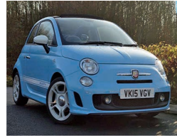
2015 Abarth 595C 1.4 T-Jet Turismo, VK15 VGV, Blue, 5,500 miles, £12,950. Air Conditioning, Alloy Wheels, Sunroof, Sports Seats, Electric Door Mirrors, Traction Control, Radio/CD.