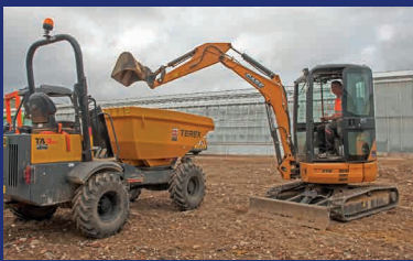
A Case of the right plant