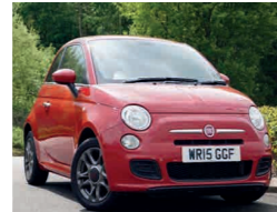
2015 Fiat 500 1.2 S, WR15 GGF, Passodoble Red, 10,753 miles, £7,250. Start/Stop, Air Conditioning, Alloy Wheels, Electric Front Windows, Hill Holder, Radio/CD/MP3, 60mpg.