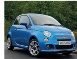
2015 Fiat 500 1.2 S, LK16 NLG, Electronica Blue, 6,500 miles, £8,450. Automatic Climate Control, Start/Stop, 16in Alloy Wheels, Electric Front Windows, Rear Parking Sensor, Front Seats with Memory, Hill Holder.