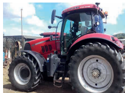
2013 Case IH Puma CVX200, front linkage, 50kph with air. Michelin 650-42 tyres £36,500 NN