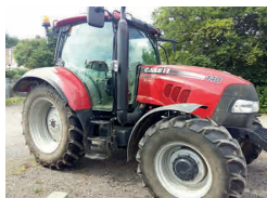
2011 Case IH Maxxum 140 4wd, 3675 hrs, air seat A, air con, 40kph, hyd push back hitch £32,000 SC