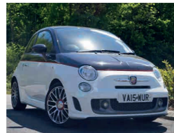
2015 Abarth 500 1.4 Turismo, VA15 WUR, Bicolour, 6,000 miles, £15,950. One Owner, Abarth Red Leather, Auto Climate Control, Diamond-Finish Alloys, Electric Front Windows, Tinted Rear Glass.