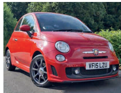
2015 Abarth 500 1.4 T-Jet, VF15 LZU, Red, 7,396 miles, £11,950. Climate control, Abarth 8-Spoke Painted Alloys, Blue & Me Hands-Free, Electric Front Windows, Hill Holder, Radio/CD/MP3 + USB.