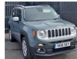
2016 Jeep Renegade 1.4 MultiAir II Limited, VK16 SEY, Anvil, 30 miles, £18,450. Pre-Reg - Save £4,495! Function Pack 2, Satnav, Air Conditioning, Privacy Glass, DAB Audio, Cruise, Power Windows.