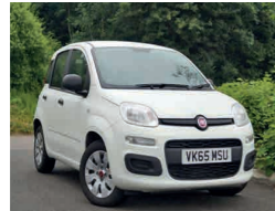
2015 Fiat Panda 1.2 Pop, CF15 NBX, White, 5,000 miles, £5,450. Stop/Start, Electric Front Windows, Hill Holder, Radio/CD/MP3, Tyre Pressure Monitoring System, 55mpg, One Owner.