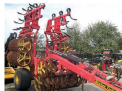
2011 VADERSTAD Rexistw Twin 4.5m Press, c/w levelling boards, raptor tines, VGC £28,250 RL