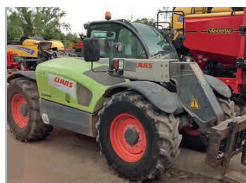
2011 Claas Scorpion 6030 CP, 4530 hours, 80% tyres £25,500 RL