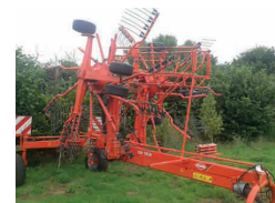
2012 Kuhn GA7501 Twin Rotor Rake, trailed model 6.85-7.45m c/w 3D axles £8,500 AT