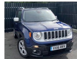
2016 Jeep Renegade 1.4 MultiAir II Limited, VX16 RRV, Jetset Blue, 7,750 miles, £19,450. Ex-Demo, Dual Zone Climate Control, Satnav, Leather, Power Windows, Heated Seats, Privacy Glass, Alarm.