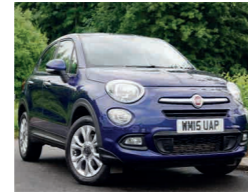
2015 Fiat 500X 1.4 MultiAir Pop Star, WM15 UAP, Blue, 11,215 miles, £12,450. Dual Zone Climate Control, Cruise Control, 17in Alloys, Cruise, Parking Sensors, Electric Windows, One Owner.