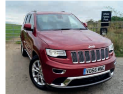
2015 Jeep Grand Cherokee 3.0 CRD Summit, VO65 WNC, Deep Cherry Red, 7,783 miles, £35,450. Panoramic Natura Plus Leather, Ventilated Heated Seats, Sunscreen Glass, Park Assist, Hill Start Assist, DAB.