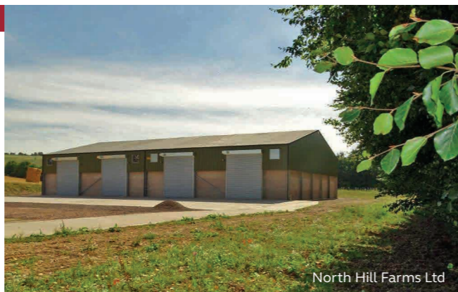
North Hill Farms Ltd

elevated fan house to feed the lower level air duct. The photographs show the site location at Cobham farm plus the drying floor being loaded through one of the four front-facing entrance doorways during the harvest.