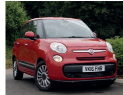
2016 Fiat 500L 1.3 MultiJet Pop Star Dualogic, VK16 FNR, Red, 500 miles, £13,950. Ex-Demo, 5in Touchscreen, Air Conditioning, Cruise, 16in Alloys, Start/Stop, Radio/CD/MP3, Hill Holder.