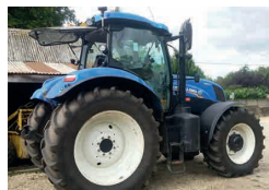
2013 New Holland T7.200 auto command, front link & PTO, 50KPH, Excellent condition £45,000 AT