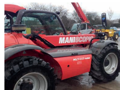
2013 Manitou MLT 627, Manitou hyd headstock, aircon, 24in tyres 50%, 1650 hrs £31,250 PC