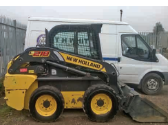
2014 New Holland L218 Skid Steer Loader, Bucket. Good condition, 3120hrs £14,000 AD