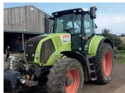
2012 Claas Axion 810, 50kph, front linkage & PTO, 3 spools, 1 years warranty, 2,300hrs £32,000 RL