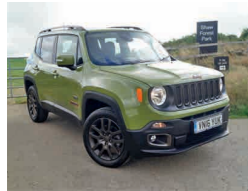
2016 Jeep Renegade 1.4 MultiAir II 75th Anniversary Edition, VN16 YUK, Jungle Green, 5,000 miles, £23,950. Air Conditioning, Cruise, MySky Roof, Satnav, Electric Door Mirrors, Parking Aid, Lane Assist.