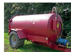
2014 Marshall 1800 gallon tanker, 550x22.5 tyres, fully opening back door, mudguards £5,650 BG

Sales Hotline: 01373 465941 (Mon-Fri 08.00-17.00) Out of hours: 07710 985957