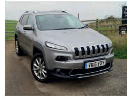
2016 Jeep Cherokee 2.2 MultiJet II Limited (Active Drive II), VK16 VOY, Billet Silver, 7,000 miles, £32,950. Nappa Leather, Panoramic Sunroof, Tech Pack, Cold Weather Pack, Rain Sensor.