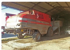
2009 Massey Ferguson Centora combine harvester, 22ft header £54,000 AT