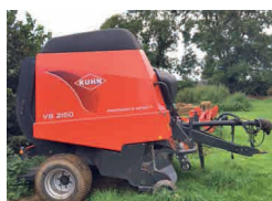
2012 Kuhn VB2160 baler, crop cutter, drop down draw, wide pick up, excellent condition £15,000 AT