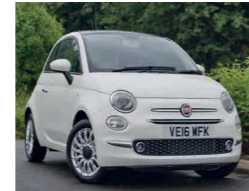
2016 Fiat 500 1.2 Lounge, VE16 WFK, White, 1,400 miles, £9,950. Air Conditioning, Fixed Glass sunroof with sunblind, Start/Stop, Rear Parking Sensor, Front Seats with Memory, Hill Holder.