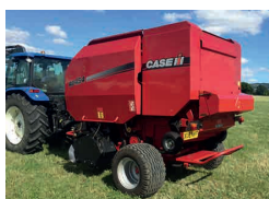
2008 Case IH RBX454 Rotor Feeder, variable chamber round baler, net & twine, braked axle. £7,000 RD