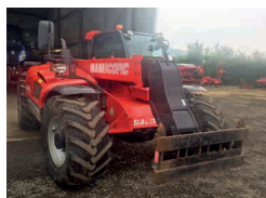
2009, Manitou 735T, Aircon, Pick up hitch & tipping pipe, smooth ride, comfort seat, 4,400hrs £25,500 RD