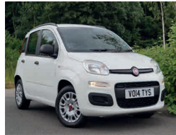
2015 Fiat Panda 1.2 Easy, VO14 TYS, Solid White, 11,887 miles, £5,950. Air Conditioning, Pollen Filter, Radio/CD MP3 Player, Stop/Start, Electric Front Windows, One Owner.