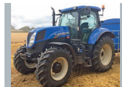
2013 New Holland T7.210, power command, 50kph, air brakes, sidewinder. Excellent Condition £45,000 AT