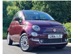
2016 Fiat 500 1.2 Lounge LK16 NLG, Avantgarde Bordeaux, 1,364 miles, £10,450. New Colour, Glass Sunroof with Sunblind, Air Conditioning, Rear Parking Sensors, Electric Windows.