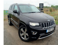
2013 Jeep Grand Cherokee 3.0 CRD Overland, RE63 AAN, Black, 33,000 miles, £24,950. Leather, Sunscreen Glass, Voice Activated Controls, Satnav, Climate Control, Ventilated Front Seats, Cameras.