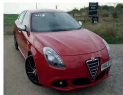
2015 Alfa Romeo Giulietta 2.0 JTDM-2 Sportiva, VN63 XHP, Red, 41,000 miles, £11,950. Dual Zone Climate Control, Cruise Control, 18in Dark Titanium Alloy Wheels, Electric Windows, Sports Leather.