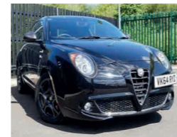
2014 Alfa Romeo MiTo 1.4 TB MultiAir Distinctive, VK64 RYD, Solid Black, 6,500 miles, £12,950. 135 PS, Semi Auto, One-Touch Electric Windows, Cruise, Front Fogs, Heated Door Mirrors, FPS.