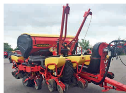
Ex-Demo Vaderstad Tempo 8 Precision Maize Drill, seed meters, seed sensors and control-station £44,000 PC