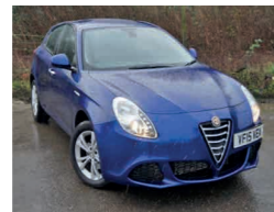
2015 Alfa Romeo Giulietta 1.6 JTDM-2 Progression, VF15 VEA, Blue, 4,000 miles, £15,650. Ex-Demo, 16in 5 Double Spoke Alloys, Electric Windows, Uconnect, Start/Stop, Hill Holder.