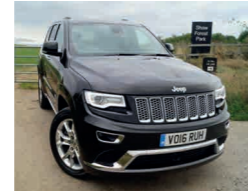
2016 Jeep Grand Cherokee 3.0 CRD Summit, VO16 RUH, Black, 7,008 miles, £39,950. Panoramic Natura Plus Leather, Ventilated Heated Seats, Rear View Camera, Park Assist, Rear Seat DVD/BluRay.