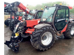
2013 Manitou MLA629 c/w new tyres £29,000 BW