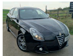
2015 Alfa Romeo Giulietta 1.4 TB MultiAir Exclusive, VU65 NZH, Black, 8,000 miles, £15,450. Dual Zone Climate Control, Cruise, Start/Stop, Leather & Microfibre, 17in Burnished Wheels, DAB.