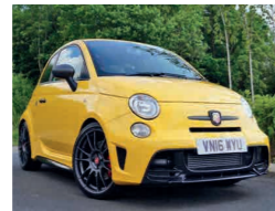
2016 Abarth 500 1.4 T-Jet 695 Biposto Record, VN16 WYU, Yellow, 200 miles, £29,950. 190bhp, Rear Seat Delete, 18in O.Z. Alloy Wheels, Leather/Alcantara, Limited Slip Diff.