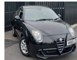
2015 Alfa Romeo MiTo 1.4 MultiAir Progression, VK65 LCO, Black, 2,000 miles, £9,950. Climate Control, 5in Touchscreen, One-Touch Electric Windows, Hill Holder, TPMS, Uconnect, Ex-Demo.