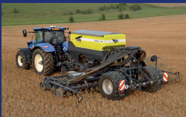
Sowing made easy