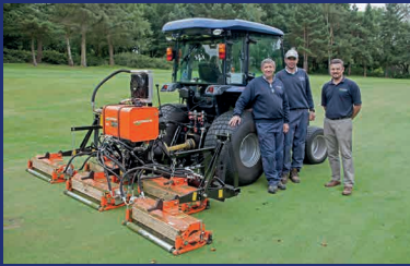
Stepping back to the future at Fulford Heath