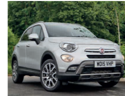
2015 Fiat 500X 1.4 MultiAir Cross Plus, WO15 VHP, Grey, 9,074 miles, £13,950. Dual Zone Climate Control, Leather/Cloth, 18in Alloys, Cruise, Parking Sensors, Keyless Go, Tinted Glass.