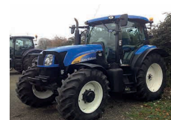
2011 New Holland T6030, 50kph, c/w new tyres, loader brackets, 3,400 hours £31,500 BW