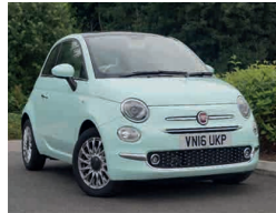
2015 Fiat 500 0.9 TwinAir Lounge, VN16 UKP, Pastel Green/Blue, 1,000 miles, £11,950. Ex-Demo, Air Conditioning, Fixed Glass Roof with Sunblind, Rear Parking Sensors, Start/Stop, Hill Holder.