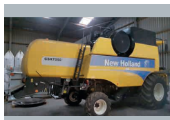
2011 New Holland CSX 7050 Combine, 20ft header, 585 hrs, exceptional, recently serviced £85,000 AT