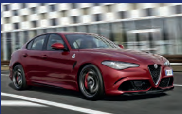
Clarkson loves Giulia