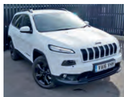
2016 Jeep Cherokee 2.2 MultiJet II Night Eagle, VA16 VHH, Bright White, 100 miles, £28,950. Nappa Leather, Delivery Miles, Cruise, Climate Control, DAB Audio, Heated Front Seats, Alarm.