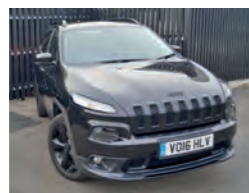
2016 Jeep Cherokee 2.2 MultiJet II Night Eagle, VO16 HLV, Black, 5,000 miles, £32,850. Ex-Demo, Black Nappa Leather, Dual Zone Climate Control, Tinted Glass, Heated Front Seats, Cruise, DAB.