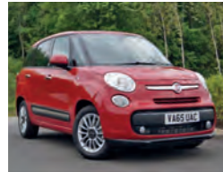
2016 Fiat 500L 1.6 MultiJet Lounge, VA65 UAC, Red, 10 miles, £14,950. Pre-Reg, Electric Sunroof, Electric Windows, Auto Lights with Rain Sensor, Electric Door Mirrors, Front Fog Lights.