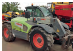
2011 Claas Scorpion 6030 CP, 4530 hours, 80% tyres £25,500 RL