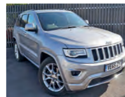
2016 Jeep Grand Cherokee 3.0 CRD Overland, VE65 ZYT, Billet Silver, 8,500 miles, £35,950. Leather, Heated Seats, Parking Aid, Cruise, Satnav, Sunroof, Air Con, Alarm, Polished Alloys.