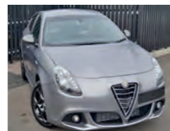
2016 Alfa Romeo Giulietta 1.4 TB MultiAir Sprint Speciale, VE16 VHY, Matt Magnesio, 50 miles, £17,950. Delivery Mileage, Special Paint, 18in Dark Alloys, Cruise, Climate Control PDC.