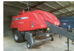
2009 Massey Ferguson 2150 Square Baler, low bale count, immaculate condition £28,500 AT