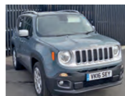
2016 Jeep Renegade 1.4 MultiAir II Limited, VK16 SEY, Anvil, 30 miles, £18,450. Pre-Reg - Save £4,495! Function Pack 2, Satnav, Air Conditioning, Privacy Glass, DAB Audio, Cruise, Power Windows.