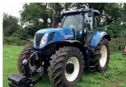
2013 New Holland T7.250, front linkage, weights, 1040 hrs, 50kph, excellent condition £50,000 RM