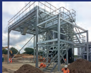
Working with the utilities industry