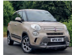
2014 Fiat 500L 1.3 MultiJet Trekking, VP14 WRO, Ne Age Cream, 25,844 miles, £8,450. Pre-Reg, Electric Sunroof, Electric Windows, Auto Lights with Rain Sensor, Electric Door Mirrors.