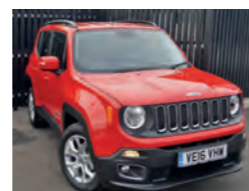
2016 Jeep Renegade 1.4 MultiAir II Longitude, VE16 VHW, Pastel Red, 500 miles, £17,950. Satnav, Cruise, Air Conditioning, DAB Audio, 5in Touchscreen, Hill Start Assist, Rear Parking Sensors.