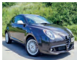
2015 Alfa Romeo MiTo 1.3 JTDM-2 Junior, VE15 RFL, Anthracite Grey, 2,300 miles, £10,950. Dual Zone Climate Control, Dark Tinted Windows, White Alloy Wheels, Sports Pedals, 5in Screen.