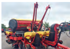
Ex-Demo Vaderstad Tempo 8 Precision Maize Drill, seed meters, seed sensors and control-station £44,000 PC