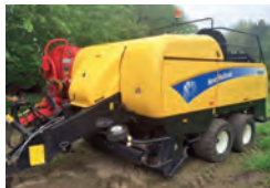
2012 New Holland BB9080 c/w fork feeder, tandem axle, std & partial bale eject, 18,500 bales £45,000 BW