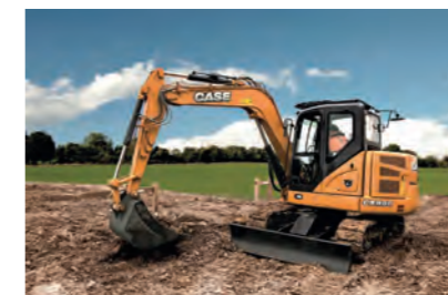
CX80 – £910 monthly