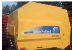
2012 New Holland BB6090 Crop Cutter, fixed O2 tyres, hydraulic reverse, 7500 bales, excellent £9,600 RL