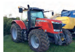
2014 Massey Ferguson 7620, front linkage and PTO, 50 kph, 2,100 hrs £58,500 AT