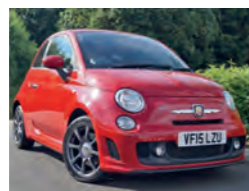
2015 Abarth 500 1.4 T-Jet, VF15 LZU, Red, 7,396 miles, £11,950. Climate control, Abarth 8-Spoke Painted Alloys, Blue & Me Hands-Free, Electric Front Windows, Hill Holder, Radio/CD/MP3 + USB.