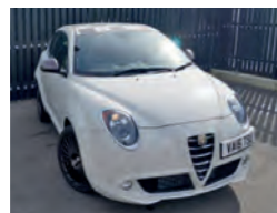
2016 Alfa Romeo MiTo 1.4 TB TwinAir Collezione, VA16 TSU, White, 100 miles, £13,950. Stunning Chequered Roof, Cruise, Satnav, Voice Recognition, Tinted Windows, 17in Bronze Alloy Wheels.