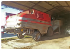
2009 Massey Ferguson Centora combine harvester, 22ft header £54,000 AT