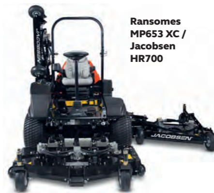
Ransomes MP653 XC / Jacobsen HR700

All the new machines are powered by reliable Tier 4 Final compliant Kubota turbocharged diesel engines. For all the information, or to arrange a demo, please contact your Groundcare branch.