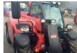
2012 MANITOU MLT625 75H, new Manitou headstock, hydrostatic, tyres 35%, 2,900 hrs £24,000 JW