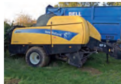
2011 New Holland BB9060 Packer Cutter Baler £35,000 AT