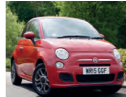
2015 Fiat 500 1.2 S, WR15 GGF, Passodoble Red, 10,593 miles, £7,250. Start/Stop, Air Conditioning, Alloy Wheels, Electric Front Windows, Hill Holder, Radio/CD/MP3, 60mpg.