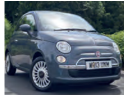
2013 Fiat 500 1.2 Lounge, WR13 UNM, Grey, 10,000 miles, £6,950. Air Conditioning, Start/Stop, Electric Front Windows, Fixed Glass Roof, 15in Alloy Wheels, Radio/CD/MP3, 55mpg.