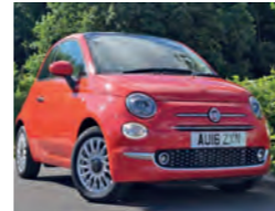
2016 Fiat 500 1.2 Lounge, AU16 ZKN, Glam Coral, 547 miles, £10,450. Air Conditioning, Fixed Glass sunroof with sunblind, Start/Stop, Rear Parking Sensor, Front Seats with Memory.