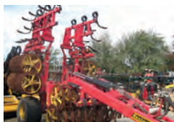
2011 VADERSTAD Rexius Twin 4.5m Press, c/w levelling boards, raptor tines, VGC £28,250 RL