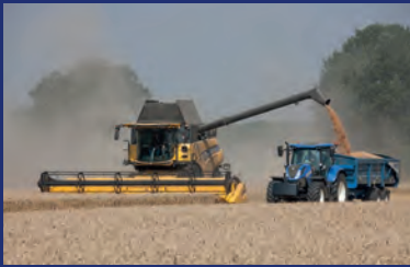
Harvest power: on tour with New Holland