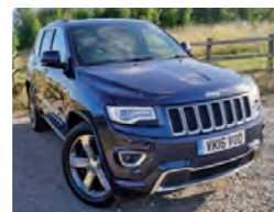
2016 Jeep Grand Cherokee 3.0 CRD Overland, VK16 VOD, Grey, 8,000 miles, £32,850. Ex-Demo, Nappa Leather, Ventilated Front Seats, Dual Zone Climate Control, Panoramic Sunroof, Rear Camera.