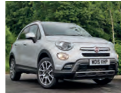
2015 Fiat 500X 1.4 MultiAir Cross Plus, WO15 VHP, Grey, 9,074 miles, £13,950. Dual Zone Climate Control, Leather/Cloth, 18in Alloys, Cruise, Parking Sensors, Keyless Go, Tinted Glass.