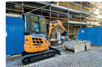
CX26 – £321 monthly