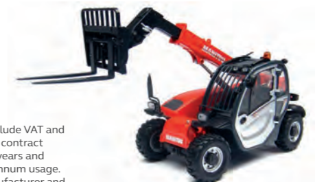
MT625 – £603 monthly