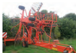
2012 Kuhn GA7501 Twin Rotor Rake, trailed model 6.85-7.45m c/w 3D axles £8,500 AT