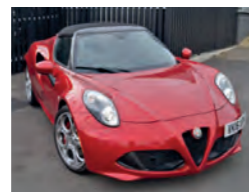
2016 Alfa Romeo 4C 1.8 TBI Spider, VK16 UFH, Competizione Red, 1,000 miles, £57,450. Black Leather, Sports Seats, Racing Double Tail Pipe, Air Conditioning, Red Brake Callipers, Sports Seats.