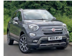
2015 Fiat 500X 2.0 MultiJet Cross Plus, WO15 WYJ, Grey, 6,500 miles, £15,950. Auto Climate Control, Dark Tinted Glass, Cruise, Rear Parking Sensor, Satnav, 5in Touchscreen, Electric Windows.