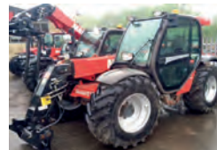
2013 Manitou MLA629 c/w new tyres £29,000 BW