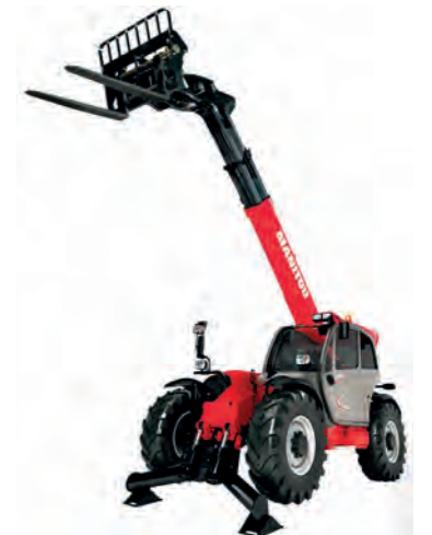
MT1135 – £792 monthly