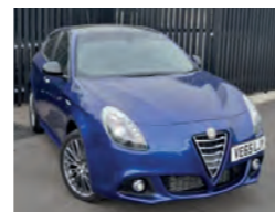
2015 Alfa Romeo Giulietta 2.0 JTDM-2 Collezione, VE65 LJY, Metallic Blue, 3,000 miles, £19,950. Bose Sound System, Cruise, Climate Control, Heated Front Seats, Rain Sensor, PDC.