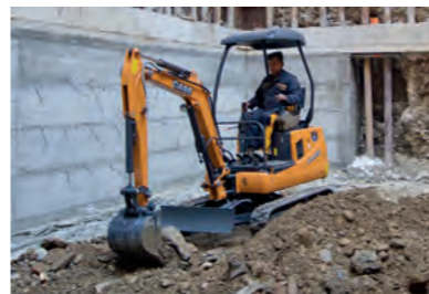
CX18 – £238 monthly