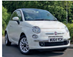
2015 Fiat 500 1.2 Lounge, WU64 YCH, White, 13,756 miles, £7,950. Start/Stop, Air conditioning, Fixed Sunroof, Voice Recognition, 15in Alloys, Electric Windows, Blue & Me Infotainment, Bluetooth.