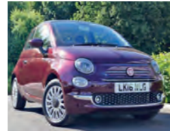
2016 Fiat 500 1.2 Lounge, LK16 NLG, Avantgarde Bordeaux, 1,364 miles, £10,450. Air Conditioning, Fixed Glass Roof, with sunblind, Start/Stop, 15in Alloys, Electric Front Windows.