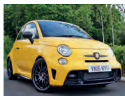
2016 Abarth 500 1.4 T-Jet 695 Biposto Record, VN16 WYU, Yellow, 200 miles, £29,950. 190bhp, Rear Seat Delete, 18in O.Z. Alloy Wheels, Leather/Alcantara, Limited Slip Diff.