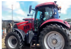
2013 Case IH Puma CVX200, front linkage, 50kph with air, Michelin 650-42 tyres £36,500 NN