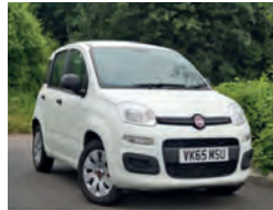
2015 Fiat Panda 1.2 Pop, CF15 NBX, White, 5,000 miles, £5,750. Stop/Start, Electric Front Windows, Hill Holder, Radio/CD/MP3, Tyre Pressure Monitoring System, 55mpg, One Owner.