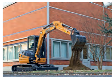
CX50 – £519 monthly