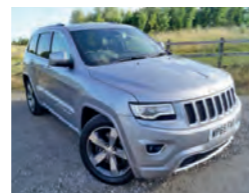
2016 Jeep Grand Cherokee 3.0 CRD Overland, WP65 FWD, Blue, 9,200 miles, £34,450. Panoramic Sunroof, SmartTouch Nav, Heated Seats, DAB, Park Sense Front/Rear Assist, Cruise, Hill Start Assist.