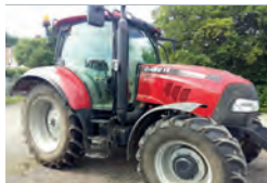
2011 Case IH Maxxum 140 4wd, 3675 hrs, air seat A, air con, 40kph, hyd push back hitch £32,000 SC