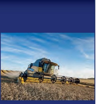
Gear up for harvest