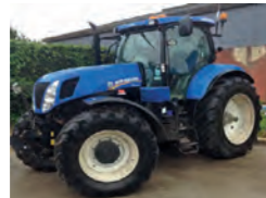
2012 NH T7.260 Power Command, front linkage, full TRK guidance, 710/60R42 wheels at 30%. £44,000 RL