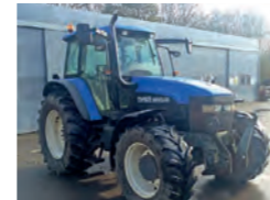
2001, NH TM165, 6675hrs, front suspension, front lkg, cab suspension, powershift transmission £17,000 JW