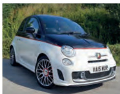
2014 Abarth 500 1.4 Turismo, VA15 WUR, Bicolour, 6,000 miles, £15,950. Red Full Leather Interior, Auto Climate Control, Parking Sensor, Diamond-Finish Alloys, Electric Windows, Hill Holder.