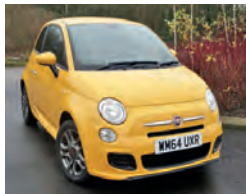
2014 Fiat 500 S, WM64 UXR, Yellow, 15,327 miles, £7,450 (was £7,950). Auto Climate Control, Sports Kit, Parking Sensor, Front Fog Lights, Start/Stop, Radio/CD/MP3, Heat Insulated Glass, EBD.