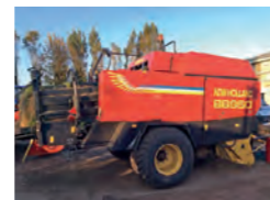
New Holland BB950 Packer Cutter Baler £23,500 AT