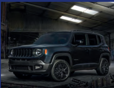
Is it the Batmobile? No, it's a Renegade