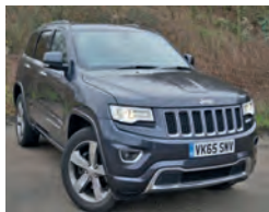
2015 Jeep Grand Cherokee 3.0 CRD Overland, VK65 SMV, Grey, 7,000 miles, £35,950. Leather, Heated Seats, Rain Sensor, Front/Rear Cameras, Climate Control, DAB Audio, Satnav, Hill Holder.