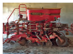
2009 VADERSTAD RDA400S Drill, 3400 hrs £25,000 RD