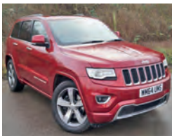
2014 Jeep Grand Cherokee 3.0 CRD Overland, WM64 UMS, Red, 8,000 miles, £31,500. Park Assist, Nappa Leather Ventilated Seats, Panoramic Sunroof, Climate Control, Rear View Camera.