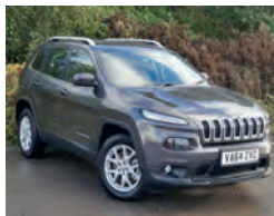
2015 Jeep Cherokee M-Jet Longitude Plus, VA64 ZVZ, Granite Metallic, 11,000 miles, £17,950. Auto Dual Zone Climate Control, Cruise, 17in Alloys, Park Assist with Stop, Roof Rails, ESP.