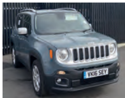
2016 Jeep Renegade 1.4 MultiAir II Limited, VK16 SEY, Anvil Grey, 30 miles, £19,950. Save £4,495! Satnav, Touchscreen, Air Conditioning, 18in Alloys, Power Windows, Privacy Glass, Leather.