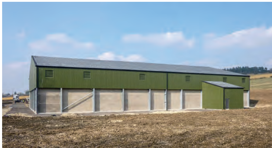
On-track for handover at North Hill Farm. The olive green cladding harmonises with the landscape.