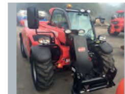
2012 MANITOU MLT625 75H, new Manitou headstock, hydrostatic, tyres 35%, 2,900 hrs £25,000 JW