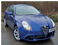
2015 Alfa Romeo Giulietta 1.6 JTDM-2 Progression, VF15 VEA, Blue, 4,000 miles, £15,850. Climate Control, 16in 5 Double-Spoke Alloy Wheels, Uconnect Infotainment, Electric Windows.