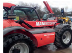
2013 Manitou MLT 627, Manitou hyd headstock, aircon, 24in tyres 50%, 1650 hrs £31,250 PC