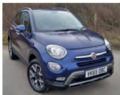
2015 Fiat 500X 1.4 MultiAir II Cross DDCT, VK65 OBC, Blue, 3,850 miles, £16,995. Auto Climate Control, Cruise, Parking Sensors, EcoLeather/Fabric, Electric Windows, Uconnect Radio, TPMS.