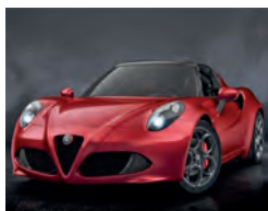
2015 Alfa Romeo 4C Spider, Metallic Rosso Competizione, £65,550. Brand New - Unregistered, Dark Finish 5-hole Alloy Wheels, Red Painted Brake Callipers, Leather Dash with Red Stitching.