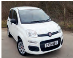
2015 Fiat Panda 1.2 POP, CF15 NBX, White, 5,000 miles, £6,750. Start/Stop, Electric Front Windows, Radio/CD/MP3, Hill Holder, Tyre Pressure Monitoring System, One Owner.