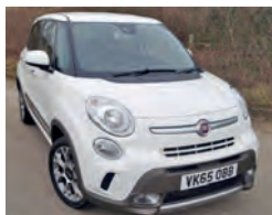
2015 Fiat 500L 1.3 MultiJet Trekking, VK65 OBB, White, 5,000 miles, £15,495. Cruise, Air Conditioning, 5in Touchscreen, 17in Trekking Alloy Wheels, Bluetooth, Electric Windows, Hill Holder.