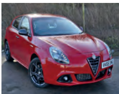
2015 Alfa Romeo Giulietta 2.0 JTDM-2 Sprint Speciale, VK65 SMU, Alfa Red, 6,200 miles, £18,950. Cloth/Alcantara, Dualzone Climate Control, 17in Sprint Speciale Dark Finish Alloys.