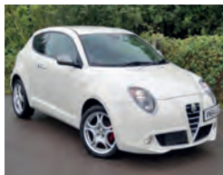
2014 Alfa Romeo MiTo 1.6 JTDM-2 Distinctive, VN64 UJE, White, 6,000 miles, £11,950. Ex-Demo, One-Touch Electric Windows, Cruise, Parking Sensors, Heated Electric Door Mirrors, Blue & Me.