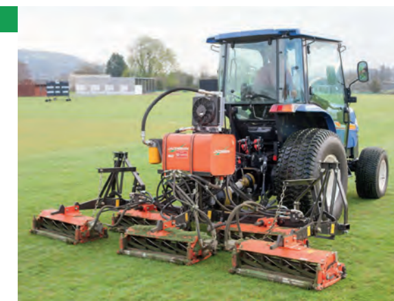
Above: Jacobsen MH5 mounted gang mower. Left: The Iseki TG5470 is useful for many tasks.