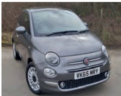
2015 Fiat 500 1.2 Lounge, VK65 MRY, Grey, 2,593 miles, £10,450. Ex-Demonstrator, 15in Alloy Wheels, Start/Stop, Electric Front Windows, Hill Holder, Radio with USB and Aux-in.