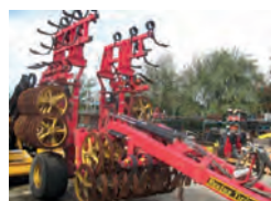
2011 VADERSTAD Rexus Twin 4.5m Press, c/w levelling boards, raptor tines, VGC £30,000 RL