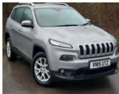
2015 Jeep Cherokee 2.0 MultiJet II Longitude Plus, VN15 UTZ, Silver, 6,250 miles, £18,950. Auto Air Conditioning, 17in Alloy Wheels, Rain Sensor, Thatcham Alarm, Hill Start Assist, Cruise.