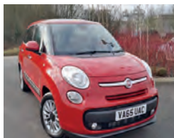
2016 Fiat 500L 1.3 MultiJet Lounge, VA65 UAC, Red, 10 miles, £16,950. Electric Sunroof, 5in Touchscreen, Dualzone Climate Control, Rain Sensor, Auto Lights, Cruise, Start/Stop, Front Fogs.