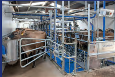
AirWash Plus helps organic dairy farm