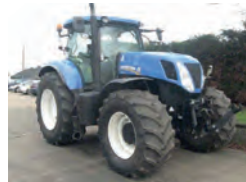
2012 New Holland T7.250 Power Cmd, c/w front linkage, PTO, sidewinder, 50kph £46,000 RL