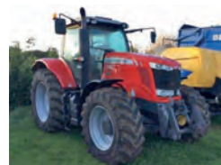
2014 Massey Ferguson 7620, c/w front linkage and PTO, 50 kph, 2,100 hrs £58,500 AT