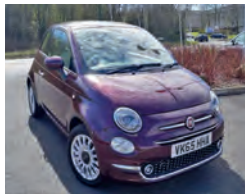
2015 Fiat 500 0.9 Lounge, VK65 HHA, Metallic Avantgarde Bordeaux, 856 miles, £12,950. Auto Start/Stop, 5in Touchscreen, DAB Audio, 15in Alloy Wheels, Electric Front Windows, Hill Holder.