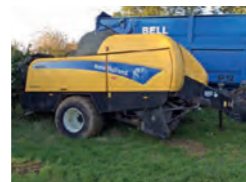
NEW HOLLAND BB9060 Packer Cutter Baler £35,000 AT