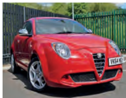
2015 Alfa Romeo MiTo 1.6 JTDM-2 Distinctive, VK64 WEH, Alfa Red, 5,000 miles, £10,950. Cruise, Blue & Me with Voice Recognition, Electric Windows, Parking Sensor, Fog Lights.