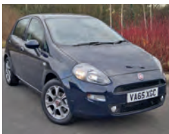
2016 Fiat Punto 1.2 8v Easy+, VA65 UAC, Blue, 10 miles, £8,450. Pre-Reg Fantastic Saving, Auto Climate Control, Sportline Alloys, TomTom Navigation, Electric Front Windows, Radio/CD/MP3.