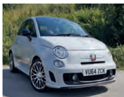
2014 Abarth 500 1.4 T-Jet, VU64 ZCK, Grey, 4,500 miles, £11,950. 17in 10-Spoke Diamond Finish Alloys, Electric Glass Sunroof, Auto Climate Control, Blue & Me, Side Stripes, Black Gloss Mirrors.