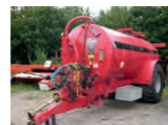
2014 Hi-Spec 2500 gallon Tanker, Trelleborg tyres, internal mixer and top fill £11,995 BG

Sales Hotline: 01373 465941 (Mon-Fri 08.00-17.00) Out of hours: 07710 985957