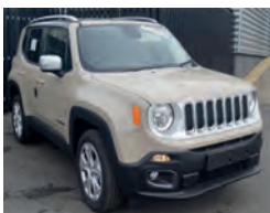
2016 Jeep Renegade 2.0 MultiJet II Limited, VK216 SFE, Moave Sand, 25 miles, £22,450. Save £4,500! Cruise, Satnav, Air Conditioning, 18in Alloys, Roof Rails, Black Roof, Privacy Glass.