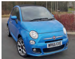
2015 Fiat 500C 1.2 S, WR65 EXE, Metallic Electronica Blue, 10 miles, £10,950. Convertible, Auto Climate Control, Start/Stop, 16in Alloy Wheels, Electric Windows, Hill Holder, Radio/CD/MP3.