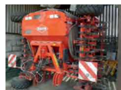
2013, Kuhn Megant 500QS 5m Drill, 13.9cm spacing, levelling boards, load sensing blower drive £15,000 PC