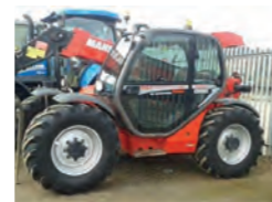
2011 Manitou MLT634T 120 LSU PS, Manitou headstock, 3400kg lift, lift height 6m, 4523 hrs £27,000 RD