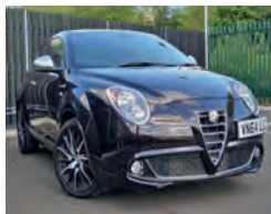
2014 Alfa Romeo MiTo 0.9 TB TwinAir Sportiva, VN64 UJC, Etna Black, 4,000 miles, £11,450. 18in Alloys, Cruise Sports Pedals, Dark Tinted Glass, Front Fogs, Chrome Tailpipe, Red Callipers.