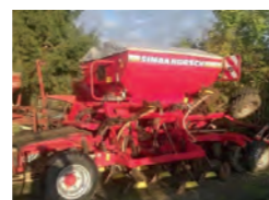
2004 Simba Horsch 4 CO Drill, good condition £9,000 AD