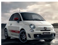
2015 Abarth 500 1.4 T-Jet Yamaha Factory Racing, VN65 MZW, Gara White, 3,653 miles, £14,950. Ex-Demo, 17in Formula Matt Black Finish Alloys, Monza Exhaust, Tinted Windows, Side Stripes.