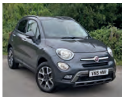
2015 Fiat 500X 1.6 MultiJet II Cross, VN15 HNH, Metallic Grey, 5,600 miles, £14,950 (was £16,950). Auto Climate Control, Cruise, Electric Door Mirrors, 17in Alloy Wheels, Uconnect Radio.