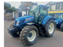
Selection of T4, T5, T6 Ex-hire Tractors. Approx 200 hrs, 0% finance and warranty. £POA BW