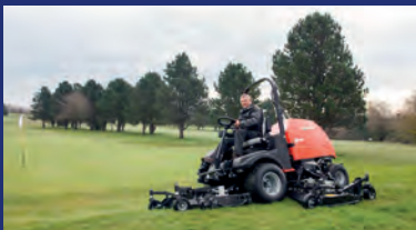
Historic golf club gets state-of-the-art mower