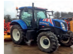
2012 New Holland T7.200 Range Command, 40kph, 4560 hrs £32,000 RL