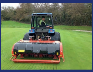
Aerating the course at Redditch