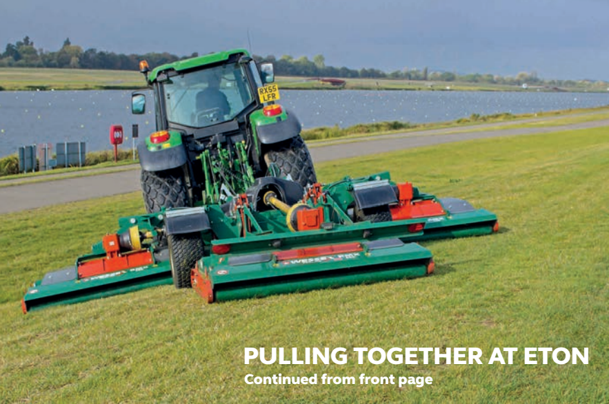
A Wessex RMX Proline 500 tri-deck roller mower supplied by T H WHITE is used by Brad Gardener for the large open grass areas at the Eton College Rowing Centre.

"We had five mowers on demonstration, but the new Jacobsen MP493 which Phil Beeny of T H WHITE brought down stood head and shoulders above the others. The mowing decks give a 3-metre wide high quality cut with options of 3.3 or 3.5 metres, yet the transport width is only 1.65-metres which suits Eton's roads, gates and bridges. Running at a speed of 7.5mph it can cut up to 8.8 acres per hour. It will also operate on slopes up to 24 degrees which is ideal where our banks slope down to the water."