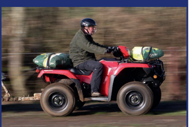
Honda Foreman raises the game