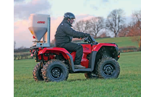
Honda TRX420 FA5

servicing contracts, including extinguishers.