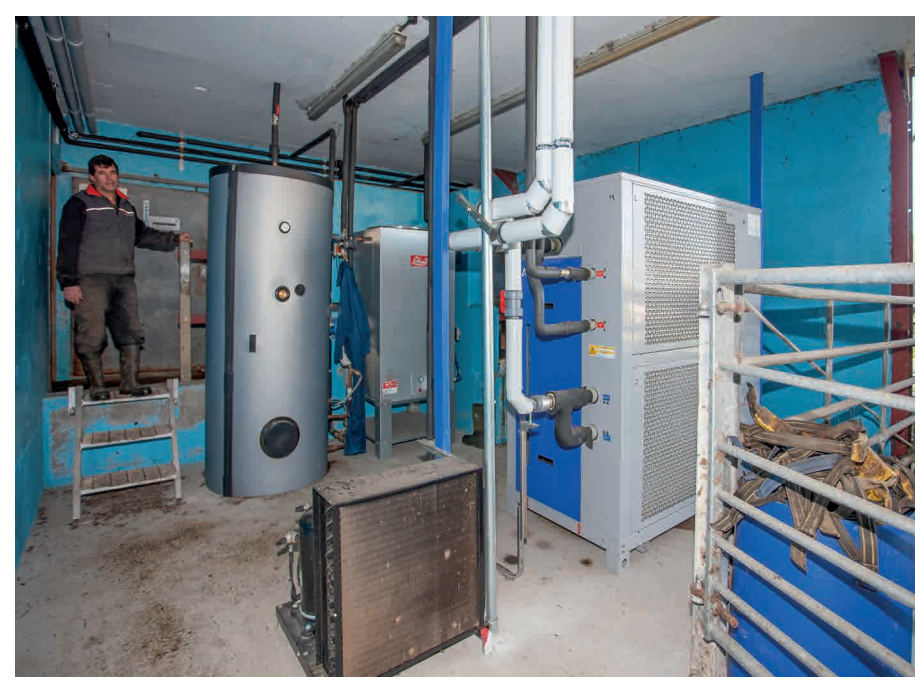
Top: The new 20,000-litre cooling tank at Bridge Farm. Above: The CWC and heat recovery system.

The solution, put together with assistance from T H WHITE Dairy engineers, comprised a DeLaval 20,000