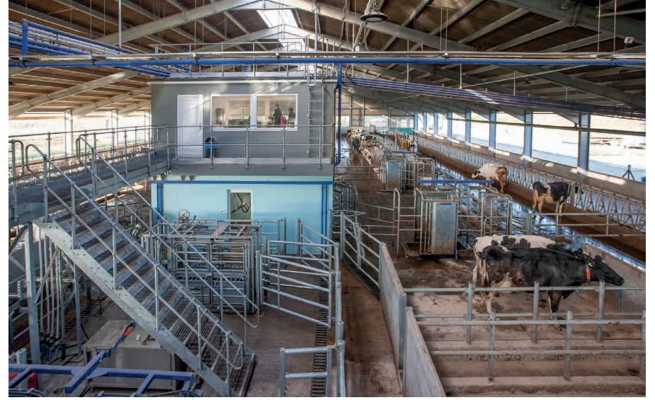
e four DeLaval VMS milking units are housed in booths beneath the dairy office.

just under 200 and there are plans to expand further to around 240. Based on a nominal figure of 60 cows for each VMS station, the new shed is set out in four sections, each with its own milking station