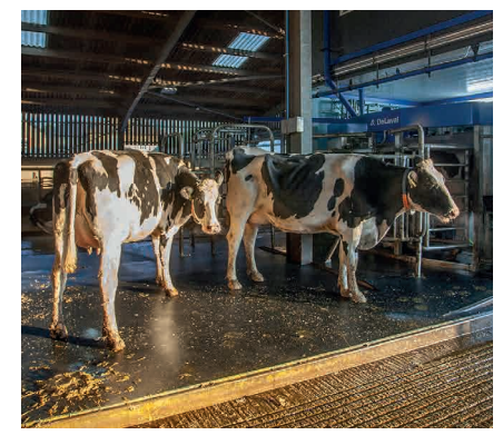
The cows have adapted well to the new regime forming an orderly queue for the DeLaval V300!

More than just taking care of the physical activity of milking, the V300 captures vast amounts of data at every milking, from every cow - even from each teat. This data is all processed, analysed