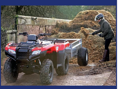
Focus on Honda 2020 ATVs and UTVs

AGRICULTURE PROJECTS GROUNDCARE DAIRY LORRY CRANES COUNTRY STORE CONSTRUCTION ENERGY, FIRE & SECURITY MACHINERY IMPORTS