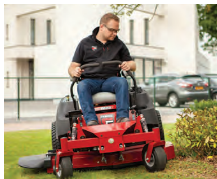
Left: The new Ferris 400S 48in triple deck ride-on mower is an efficient and economic solution.