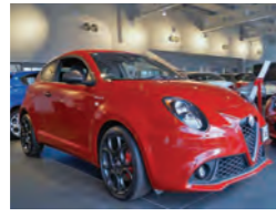
2018 Alfa Romeo MiTo 1.4 TB MultiAir Veloce, VA67 EBV, Alfa Red, 7miles only £18,995. Rare Spec, Front Carbon Fibre Shell Seats, BOSE HiFi, Climate Control, Cruise, Voice Recognition, Alarm.