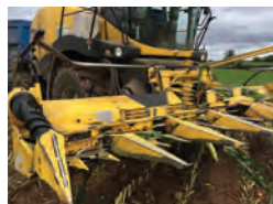
2008 New Holland A440 8 Row Maize Header £25,000 RM