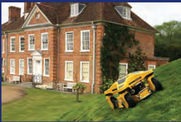
Caring for the estate