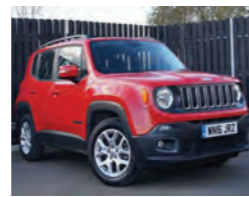
2016 Jeep Renegade 1.4 MultiAir II Longitude, WN16 JRZ, Colorado Red, 17,176 miles, £12,250. Air Conditioning, Cruise, Satnav, DAB Radio, 5in Touchscreen, Hill Start Assist, Start/Stop, Power Windows.