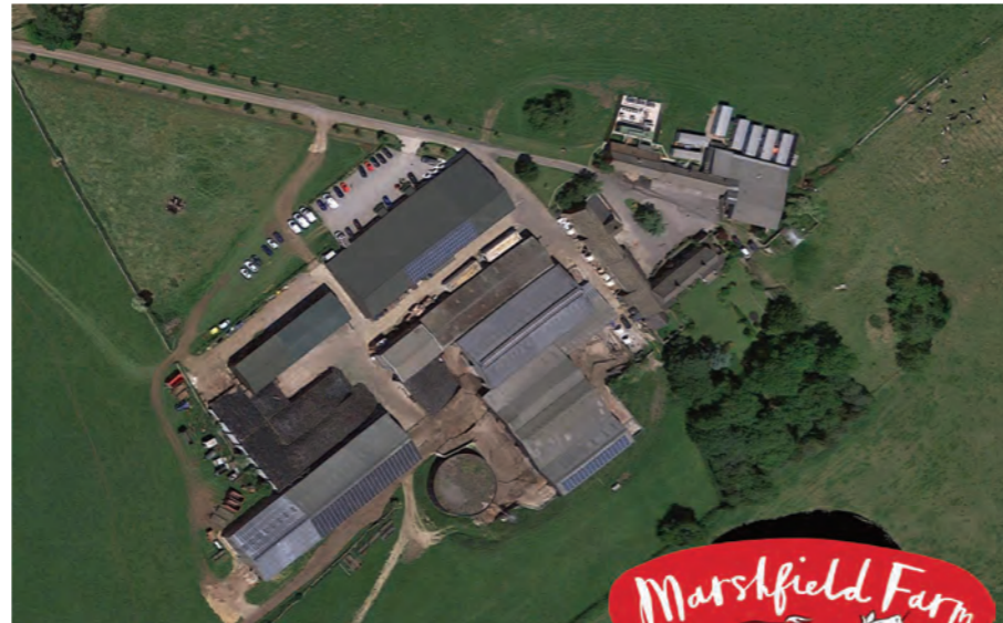
Solar PV installations on the roofs of the main buildings at Marshfield Farm make a significant contribution to the energy requirements of ice cream production.

Marshfield Farm, near Pennsylvania north of Bath, has been producing some of the West Country's most scrumptious ice cream for 30 years. The farm has always been fully organic and is home to over 200 Friesian cows which produce a total of about 4,000 litres of milk a day – or 1.5 million litres per year – around two thirds of which is used to make the award-winning ice cream.