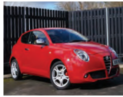
2016 Alfa Romeo MiTo 1.3 JTDM-2 Distinctive, VU16 VND, Alfa Red, 24,358 miles, £8,995. Tan Leather Interior, Dark Tinted Glass, Electric Folding Door Mirrors, Climate Control, PDC.