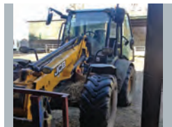
2011 JCB 310 Pivot Steer, 5,100 hours, pin & cone carriage, pick up hitch, immaculate £34,000 RL