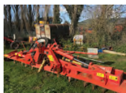
2005 Kuhn HR6003 folding Power Harrow, ready to work £11,500 RM