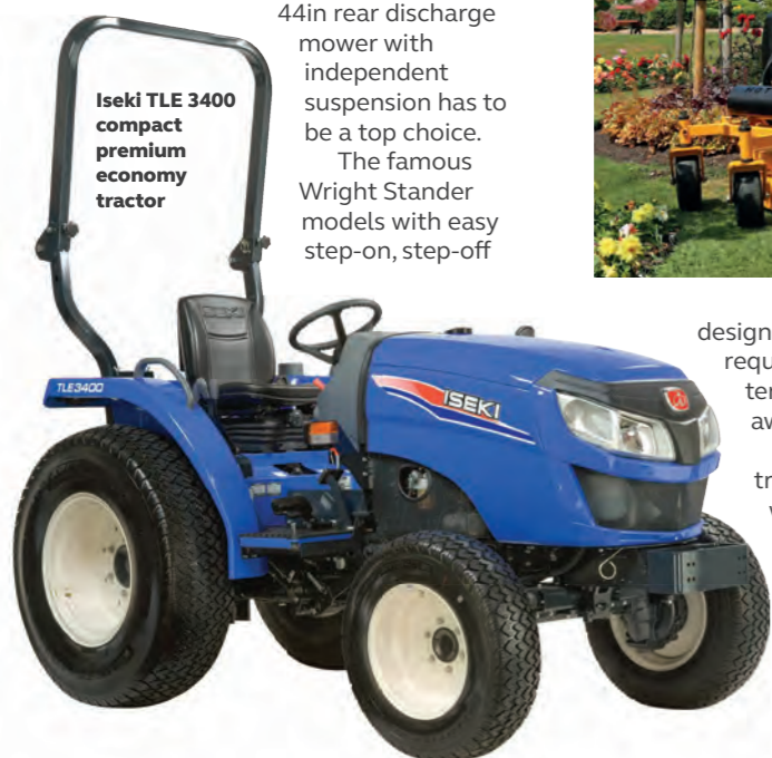
Iseki TLE 3400 compact premium economy tractor

In terms of compact tractors suitable for estate work it would be hard to beat the new Iseki TLE 3400 premium economy model. With a 38hp engine, 3-range hydrostatic drive, spool valve, PTO, drawbar and ROPS it offers