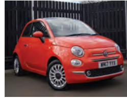
2017 Fiat 500 1.2 Lounge, WM17 YXX, Coral, 8,300 miles, £9,750. Start/Stop, Cruise, Air Conditioning, Front Seats with Memory, Hill Holder, Air Conditioning, Glass Sunroof.