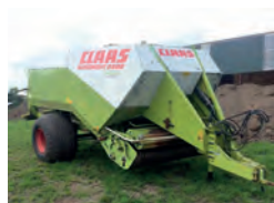
2002 Claas 2200 Big Square Baler, 120 x 70 bale, rotor feed, single axle, good working order £12,000 JW