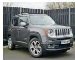
2017 Jeep Renegade 1.6 MultiJet II Limited, VA17 NPE, Multicolour, 7,741 miles, £20,950 MySky Roof, Auto Lights, Rain Sensor, Function Pack, Visibility Pack, Leather, Dark Tinted Glass, Climate Control, Radio.