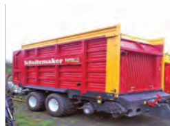
2017 EX-DEMO Schuitemaker Rapide 520S, air/hyd brakes, LED lights, mudguards £59,000 BW