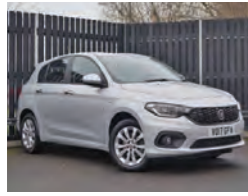
2017 Fiat Tipo 1.6 MultiJet Easy Plus, Auto, V017 GFA, Silver, 12,344 miles, £11,950 Air Con, Cruise, DAB Radio, 5in Touchscreen, Electric Windows, 16in Alloys, Zero Road Tax.