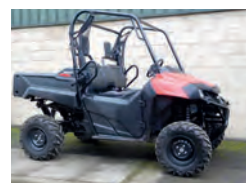
EX-DEMO - 2017 Honda UTV 700M2, 2/4wd and difflock, 2 year warranty, fitted towball, £10,250 TR

Sales Hotline: 01373 465941 (Mon-Fri 08.00-17.00) Out of hours: 07710 985957