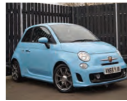
2015 Abarth 595 1.4 T-Jet, VN65 YJB, Legends Blue, 12,500 miles, £10,250. 8-Spoke Anthracite Alloy Wheels, Air Conditioning, Electric Front Windows, Blue&Me, Radio/CD/MP3, Tinted Glass.