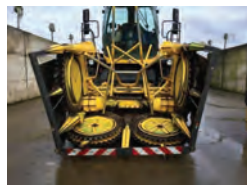
2004 New Holland, R1600Y 8 Row Maize Header, to fit New Holland FR, very good condition £15,000 AT