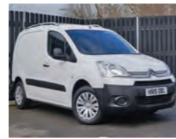
2015 Citroen Berlingo Enterprise, HN15 OBL, White, 21,500 miles, £7,450. No VAT, Three Seats, Grey Cloth, Smartnav Touchscreen, Air Conditioning, Hill Start Assist, Radio/CD/MP3, Parking Sensors.