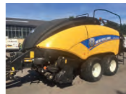
2016 New Holland BB1290 standard Big Baler, steering axle, extended warranty, 14000 bales £72,000 BW