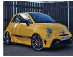
2017 Abarth 595 1.4 T-Jet Turismo, VK67 KLP, Yellow, 6,500 miles, £15,250. Electric Sunroof, Abarth Leather, Auto Climate Control, Tinted Rear Windows, Electric Glass, Turismo Wheels.