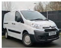
2015 Citroen Dispatch 2.0 HDI LZH1 Enterprise Van, SC15 AVG, White, 25,000 miles, £9,250+VAT Rare LWB, Black Cloth, Electric Windows, Air Conditioning, Rear Parking Assistance, Central Locking.