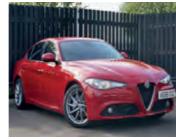
2016 Alfa Romeo Giulia 2.2 TD Super Auto, VE66 CVZ, Alfa Red, 7,000 miles, £24,950. Ex-Demo, DAB, Cruise, Driver Assistance Pack, Yellow Brake Callipers, Tinted Rear Windows, Rain Sensor, Power Seats.