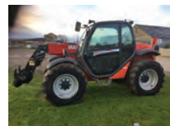
2010, Manitou MLT627, choice of JCB headstock or Mantiou, very nice condition £25,250 AD