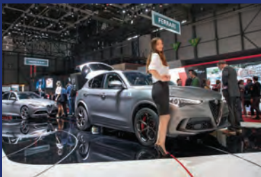
Stardust from Geneva