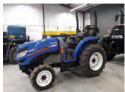
2016, Iseki TG6490, 36hp, 1,100 hrs, features new IQ dual-clutch transmission, resprayed £9,995 PC