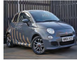
2014 Fiat 500 1.2 S, WM64 VCD, Grey, 14,330 miles, £6,950. Auto Climate Control, Full Dealership History, Voice Recognition, Radio/CD/MP3, 7in TFT Screen, Dark Tinted Windows, 15in Alloys.