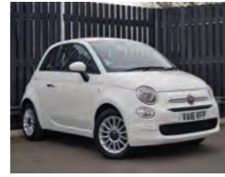
2016 Fiat 500 1.2 Pop Star Dualogic, VA16 VFP, White, 2,600 miles, £9,950. Full Dealership History, Start/Stop, Front Seats with Memory, 15in Alloys, Air Conditioning, Electric Windows.