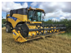
2010 New Holland CX8070, 24ft varifeed header, 1200 threshing hrs £105,000 RD