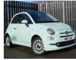
2017 Fiat 500 1.2 Lounge, WM17 XUO, Smooth Mint, 5,900 miles, £9,750. Fixed Glass Sunroof with Sunblind, Air Conditioning, Start/Stop, Electric Windows, Front Seats with Memory, TPMS.