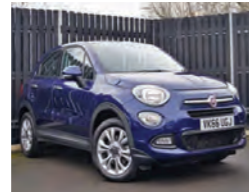
2016 Fiat 500X 1.6 MultiJet Pop Star, VK66 UGJ, Blue, 6,550 miles, £11,950. Satnav, 5in Touchscreen, Auto Climate Control, Cruise, DAB Radio, Rear Parking Sensor, Start/Stop, Electric Windows.