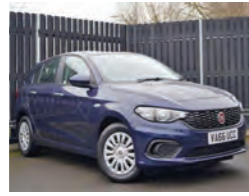
2017 Fiat Tipo 1.3 MultiJet Easy, VA66 UCC, Blue, 9,500 miles, £8,950 Cruise Control, Air Conditioning, DAB Radio, Hill Holder, Front Electric Windows, One Owner, Zero Road Tax.