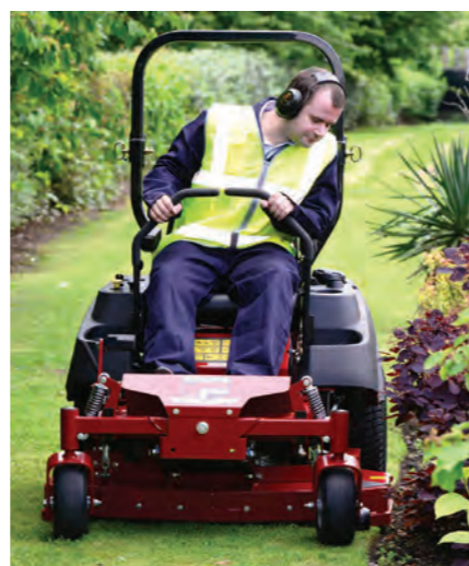
The Ferris IS*600Z features independent suspension and zero turn capability.