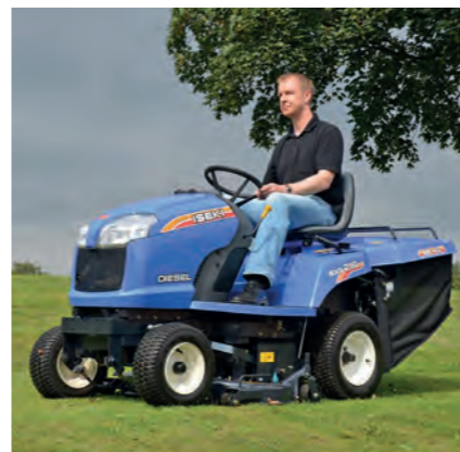
Iseki SXG216 compact rotary mower collector. Wessex International produce trailed mowers that can be used with tractors or ATVs.