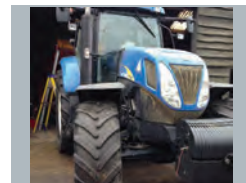
2009, New Holland T7040, 50kph, 6,000 hours, 650/65 R42 tyres, owner driver, good condition £32,000 RL