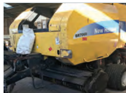
New Holland BR7060 Round Baler, good condition £11,000 RM