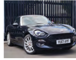
2017 Fiat 124 Spider 1.4 MultiAir Lusso, VU17 AYF, Black, 2,000 miles, £17,950. Auto Climate Control, Rear Camera, Parking Sensors, Leather, Heated Seats, Electric Windows, EX-DEMO!