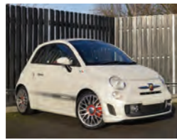
2013 Abarth 595C 1.4 T-Jet Turismo, RX13 NBZ, White Tri-Coat, 21,389 miles, £10,950. Convertible, Abarth Leather, Auto Climate Control, Tinted Rear Windows, Parking Sensors, Alloys.