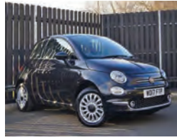
2017 Fiat 500 1.2 Lounge, W017 FTP, Metallic Black, 6,700 miles, £9,750. Air Conditioning, Fixed Glass Sunroof, Electric Windows, Front Seats with Memory, Hill Holder, Rear Parking Sensors.