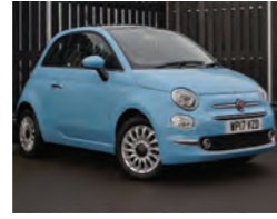
2017 Fiat 500 1.2 Lounge, WP17 VZD, Blue, 12,565 miles, £9,750. Front Seats With Memory Function, Air Conditioning, Hill Holder, Cruise Control, Fixed Glass Sunroof, Parking Sensors.