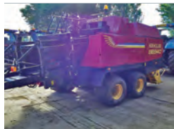
2002 New Holland BB940 Big Baler, 92000 Bales, good condition for age £17,500 AT