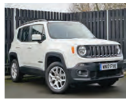
2017 Jeep Renegade 2.0 MultiJet II Longitude, WN17 FVK, Alpine White, 8,036 miles, £15,995 Air Conditioning, Cruise, Satnav, DAB Radio, Hill Start Assist, Start/Stop, Power Windows, Alarm, TPMS.