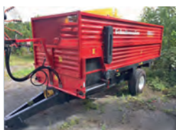
2017 Schuitemaker Feedo 50.8 Feeder Wagon, variable floor speed, beaters & cross conveyor £14,000 BW