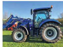
2016 New Holland T6.155, 50kph, NH Loader, front linkage & PTO, climate control £62,500 RM