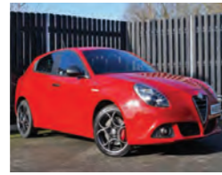
2017 Alfa Romeo Giulietta 1.4 TB MultiAir Sprint Speciale, VA65 HDO, Alfa Red, 23,865 miles, £14,450. Auto Climate Control, Dark Tinted Glass, 5-Hole Dark Gloss Alloys, Cruise.