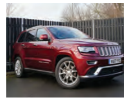
2017 Jeep Grand Cherokee 3.0 CRD Summit, VU17 YYG, Red Velvet, 9,800 miles, £38,950. Natura Plus Leather, Heated Ventilated seats, Climate Control, Parksense, Twin Screen Rear DVD.