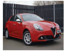
2016 Alfa Romeo Giulietta 2.0 JTDM-2 Tecnica Auto, MD16 HXV, Alfa Red, 12,683 miles, £12,950. Nav with 3D Maps, DAB, Dual Zone Climate Control, Cruise, Electric Windows, Rain Sensor.