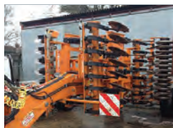
2012, Simba SL400, air brakes, immaculate condition £21,000 RL