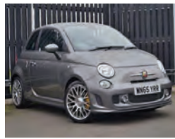
2015 Abarth 595 1.4 T-Jet Turismo, WN65 YRR, Grey, 6,000 miles, £12,450. 10-Spoke Diamond Finish Alloys, Auto Climate Control, Abarth Leather, Electric Windows, Parking Sensor.