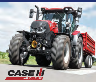
Red power on tour