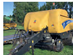
2011 New Holland BB9060 Packer Cutter Baler, 42000 bales, VGC £37,500 AT