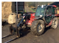
2011 Manitou MLT 634T, 120 LSU PS, pin & cone, excellent condition £31,000 JW