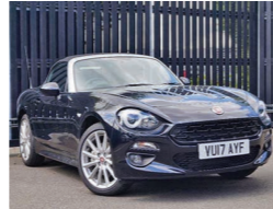
2017 Fiat 124 Spider 1.4 MultiAir Lusso, VU17 AYF, Black, 1,000 miles only, £18,950. Leather, Auto Climate Control, Rear View Camera, Heated Seats, DAB Audio, Cruise Control, Keyless Go.