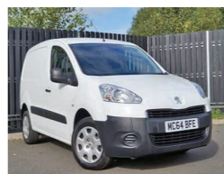
2015 Peugeot Partner 1.6 HDI Professional L1 850, MC64 BFE, White, 26,800 miles, £6,950+VAT. Grey Cloth, Electric Windows, Thatcham Category 1 Alarm, RD4 Radio/CD/MP3, One Owner.