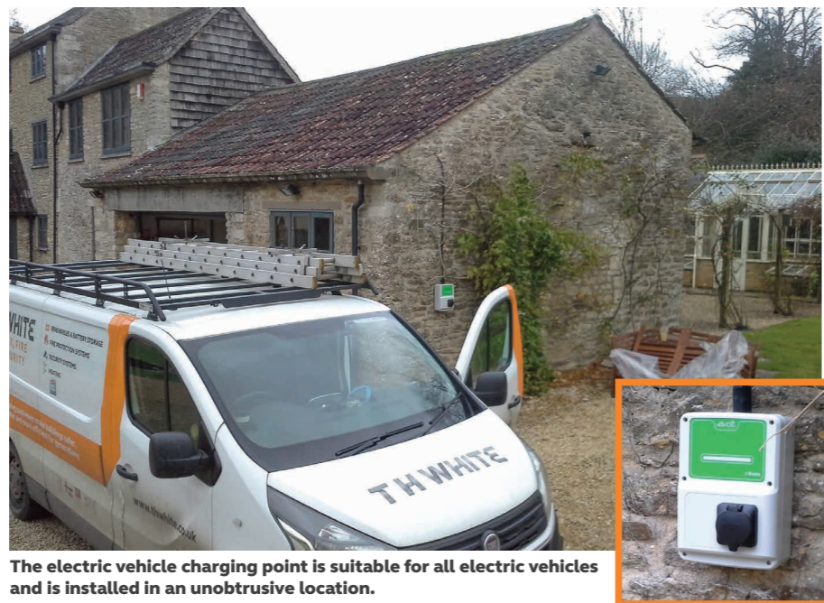
The electric vehicle charging point is suitable for all electric vehicles and is installed in an unobtrusive location.

We can supply and fit electric vehicle chargers from 7kw, up to high capacity superchargers supporting all makes of vehicle for public charging locations.