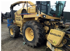
2000 New Holland FX38, 3317 cutting hrs, 4650 engine hrs, crop processor £22,000 RM