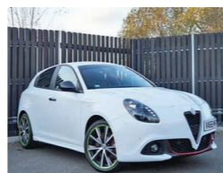
2017 Alfa Romeo Giulietta 1.7 TBI Veloce, VA66 MVR, White, 5,807 miles, £20,995. Bose Sound System, DAB Radio, Auto Climate Control, Leather/Alcantara, Titanium Finish Wheels, Cruise.