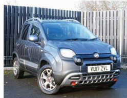
2017 Fiat Panda 1.3 MultiJet Cross, VU17 ZVL, Grey, 6,324 miles, £12,950. Auto Climate Control, Hill Holder, Blue & Me, Front Power Windows, 15in Alloys, Radio/CD/MP3.