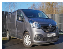
2015 Renault Traffic 1.6 DCI Energy LL29 Business+ Low Roof Van, HN65 ZTT, Slate Grey, 15,000 miles, £12,950+VAT. Hill Start Assist, Aircon, Rear Parking Sensors, DAB, Smartphone Dock.