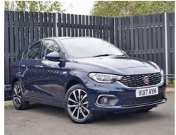
2017 Fiat Tipo 1.6 MultiJet Lounge, VU17 AYM, Metallic Blue, 7,020 miles, £14,950. Auto Climate Control, Rear View Camera, Cruise, Rain Sensor, 17in Alloys, Bluetooth, Leather Seats.