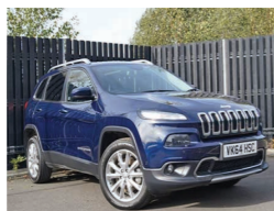
2014 Jeep Cherokee 2.0 CRD Limited, VK64 HSC, Blue, 29,979 miles, £15,595. Panoramic Sunroof, Heated Seats, Morocco Nappa Leather, Humidity Sensor, Sunscreen Glass, Rear Camera.