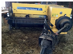
New Holland BC5060 Baler, like new only done small amount of work £10,200 RM