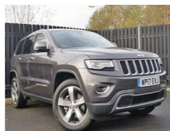
2017 Jeep Grand Cherokee 3.0 CRD Limited Plus, WP17 EVJ, Grey, Delivery Miles, £33,495. Deep Tint Sunscreen Glass, Heated Seats, Parksense Park Assist, Premium Leather, DAB.