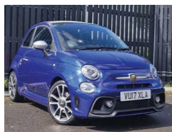
2017 Abarth 595C1.4 T-Jet Turismo, VU17 XLA, Blue, 4,400 miles, £16,950. Convertible, Climate Control, Abarth Leather Upholstery, Electric Front Windows, Dark Tinted Rear Windows.