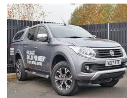
2017 Fiat Fullback 2.4 TJD LX 4x4 Double Cab, VO17 TTF, Titanium, 5,000 miles, £19,850+VAT. EU6, Ex-Demo, Black Leather, Climate Control, Privacy Glass, Satnav, Power Windows, Climate Control.