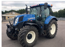
2013 New Holland T7.200 Auto Command, sidewinder, front linkage, 2300 hrs £55,000 BW