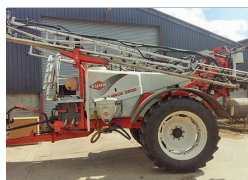
2012 Kuhn Trailed Sprayer, 3200 RHPA, 24m booms alloy, 2800 ltr, auto steer drawbar £21,500 SC