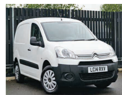
2014 Citroen Berlingo 1.6 HDI L1 850 Enterprise Panel Van, LC14 RXV, White, 28,000 miles, £6,950+VAT. Grey Cloth, Electric Windows, Electric Mirrors, Air Conditioning, Full Service History.