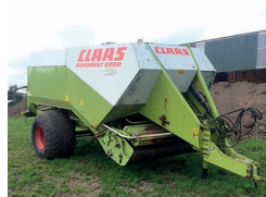
2002 Claas 2200 Big Square Baler, 120 x 70 bale, rotor feed, single axle, good working order £12,000 JW