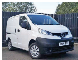
2011 Nissan NV200 1.5 DCI 89 Acenta, BN14 ETU, White, 15,400 miles, £6,750+VAT. Black Cloth, Reverse Parking Camera, Electric Windows, Side loading Doors, Low Mileage From New, One Owner.