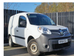
2014 Renault Kangoo 1.5 DCI ECO2 ML19 Phase II Panel Van, NV64 SZJ, White, 28,300 miles, £5,450+VAT. Full steel Bulkhead, Black Cloth, Electric Windows, Bluetooth, Hills Start Assist, Radio.

All fully checked by our team and available with finance deals and extended warranty options. The stock is constantly changing so there's certain to be one that's right for you.