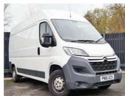
2016 Citroen Relay 2.2 HDI 35 Enterprise L3H2 Panel Van, PN16 UCY, White, 16,800 miles, £12,950+VAT. Black Cloth, Cruise, Air Conditioning, Parking Sensors, Electric Windows, Tracker.