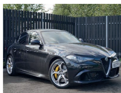
2017 Alfa Romeo Giulia 2.9 Biturbo V6 Quadrifoglio, VE17 FYY, Black, 2,650 miles, £55,950. 510 bhp, Leather/Alcantara, Harman Kardon, 5-Hole Alloys, Yellow Callipers, Climate Control.