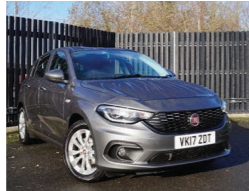
2017 Fiat Tipo 1.4 T-Jet Easy Plus, VK17 ZDT, Grey, 6,737 miles, £12,950. Air Conditioning, DAB Radio, Cruise, Electric Windows, 5in Touchscreen, Parking Sensors, Hill Holder.