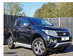
2017 Fiat Fullback 2.4 LD LX Auto 4x4 Double Cab, VN67 AXG, Black Metallic, 5 miles only, £19,850+VAT. Fully Loaded, Black Leather, Climate Control, Power Windows, Rain Sensor, Privacy Glass.