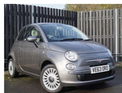
2014 Fiat 500 1.2 Lounge Dualogic, VE63 ORO, Grey, 7,650 miles, £7,450. Glass Sunroof, Air Conditioning, Start/Stop, 15in Alloys, Telephone Equipment, Electric Front Windows, CD.