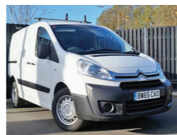
2016 Citroen Dispatch 1.6 HDI 1000 L1H1 Enterprise Panel Van, BW65 CAO, White, 12,100 miles, £9,450+VAT. Black Cloth, Air Conditioning, Rear Racking, Roof Bars, Security Locks, Rear Park Assist.