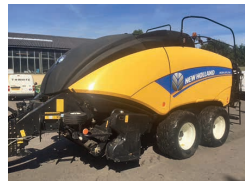
2016 New Holland BB1290 standard Big Baler, steering axle, extended warranty, 14000 bales £72,000 BW