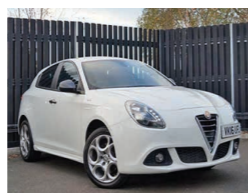
2016 Alfa Romeo Giulietta 1.4 TB MultiAir Sprint, VK16 UFJ, White, 8,888 miles, £19,950. Climate Control, DAB Audio, Start/Stop, 5-Hole Alloys, Dark Tinted Windows, Hill Holder.