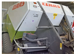
2011, Class Big Baler 2200, very good order & careful driver owner, very well maintained £28,500 CD