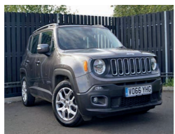
2016 Jeep Renegade 1.6 MultiJet II Longitude, VO66 YHG, Granite Crystal, 11,786 miles, £13,995. Ex-Demo, Air Conditioning, DAB, Cruise, DAB, Satnav, 17in Alloys, Power Windows, Start/Stop.