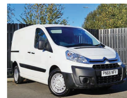
2016 Citroen Dispatch 1.6 HDI 90 Enterprise SWB 1000, PN66 NFW, White, 3,200 miles, £11,450+VAT. Low Miles, Grey Cloth, Aircon, 23 Month Warranty, One Owner, Satnav, Electric Windows.