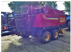
2002 New Holland BB940 Big Baler, 92000 Bales, good condition for age £17,500 AT