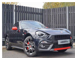
2017 Abarth 124 Spider 1.4 MultiAir, VK67 HGY, Black, 20 miles only, £27,950. San Marino Metallic, Bose Audio, Heated Seats, Cruise, 17in Alloys, Premium Alarm, Keyless Go.