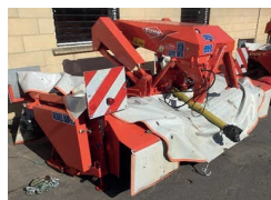
2015 Kuhn FC313DF, front mounted 8 disc cutterbar, 3.1m cut, steel condition, fast fit blades £7,800 BW