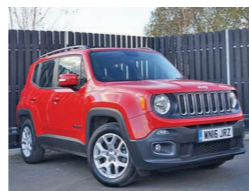
2016 Jeep Renegade 1.4 MultiAir II Longitude, WN16 JRZ, Colorado Red, 17,176 miles, £12,250. Start/ Stop, Satnav, DAB Radio, Air Conditioning, Power Windows, Cruise, Hill Start Assist, TPMS.