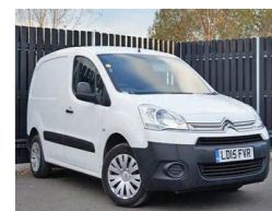
2015 Citroen Berlingo 1.6 HDI L1 625 Enterprise Panel Van, LD15 FVR, White, 25,700 miles, £6,950+VAT. Grey Cloth, Satnav, Aircon, Rear Parking Sensors, Radio/CD/MP3, Tinted Windows.