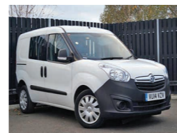
2014 Vauxhall Combo 1.3 CDTI Ecoflex 16v 2300 L1H1 Glazed Crew Van, VU14 VZV, White, 15,600 miles, £7,950+VAT. Black Cloth, Electric Windows, Start/ Stop, Central Locking, FSH.