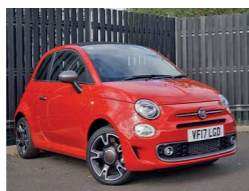
2017 Fiat 500C 1.2 S, VF17 LGD, Red, 20 miles only, £13,650. Pre-Reg - Save £3,140! 16in Alloys, 7in TFT Screen, Air Conditioning, Cruise, Start/Stop, Rear Parking Sensors, Dark Tinted Glass, TPMS.