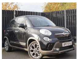
2017 Fiat 500L 1.3 MultiJet Trekking, WP17 EYA, Black, 50 miles only, £12,950. Start/Stop, Cruise, Air Conditioning, Radio/CD/MP3, 5in Touchscreen, Black Diamond 17in Alloys, PDC.