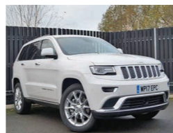
2017 Jeep Grand Cherokee 3.0 CRD Summit, WP17 EPC, White, Delivery Miles, £37,995. Panoramic Sunroof, Parksense, Rear View Camera, Natura Plus Leather, Heated Ventilated Seats.