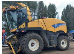
2010 New Holland FR9060, 4wd, grass & maize £78,500 AT