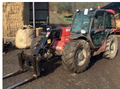
2011 Manitou MLT 634T, 120 LSU PS, pin & cone, excellent condition £31,000 JW