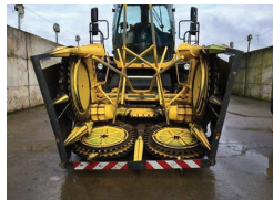
2004 New Holland, RI600Y 8 Row Maize Header, to fit New Holland FR, very good condition £14,000 AT