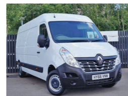
2016 Renault Master 2.3 DCI LM35 Business Medium Roof Van, HY66 VNW, White, 14,500 miles, £11,950+VAT. Black Cloth, Electric Windows, Radio/CD/MP3, Hill Start Assist, Alarm Pre-Wiring, Bluetooth.