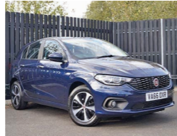
2017 Fiat Tipo 1.6 MultiJet II Elite, VA66 OXR, Blue, 6,700 miles, £11,950. Air Conditioning, Start/Stop, Rear Parking Sensors, Electric Windows, 16in Elite Alloys, Satnav, 5in Touchscreen.