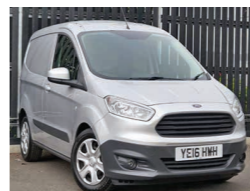
2016 Ford Transit Courier 1.5 TDCI Trend Panel Van, YE16 HWH, Silver, 18,000 miles, £8,950+VAT. Grey Cloth, Tinted Glass, Rain Sensor, Power Front Windows, Hill Holder, FSH.