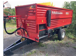
2017 Schuitemaker Feedo 50.8 Feeder Wagon, variable floor speed, beaters & cross conveyor £14,000 BW