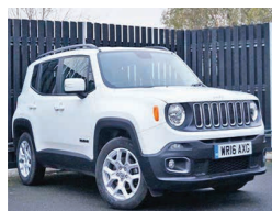
2016 Jeep Renegade 1.4 MultiAir II Longitude, WR16 AXG, Alpine White, 16,991 miles, £12,250. Pastel Paint, Stop/Start, Satnav, DAB, Air Conditioning, Cruise, Power Windows, Hill Start Assist.