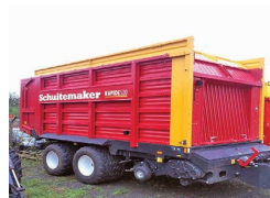
2017 Ex-Demo Schuitemaker Rapide 520S, air/hyd brakes, LED lights, mudguards £59,000 BW