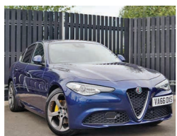
2017 Alfa Romeo Giulia 2.2 TD Super Automatic, VA66 OXS, Monte Carlo Blue, 9,879 miles, £27,995. Lusso Pack, Silverwood, Sports Leather, Heated Seats, Shift Paddles, Climate Pack, Cruise.