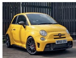
2016 Abarth 695 1.4 T-Jet Biposto Record, VR66 GSU, Yellow, 136 miles only, £23,950. Leather and Alcantara Upholstery, Tinted Windows, Sabelt Carbon Shell Seats, 18in lightened O.Z. Alloys.