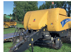
2011 New Holland BB9060 Packer Cutter Baler, 42000 bales, VGC £37,500 AT