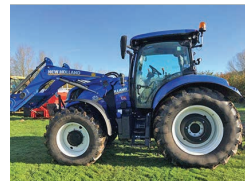
2016 New Holland T6.155, 50kph, NH Loader, front linkage & PTO, climate control £62,500 RM