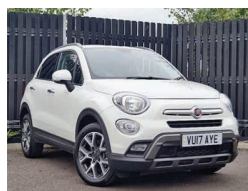
2017 Fiat 500X 1.6 MultiJet Cross, VU17 AYE, White, 4,211 miles, £17,750. Electric Windows, Electric Door Mirrors, Satellite Navigation, Cruise, Alloy Wheels, Traction Control, Parking Aid.