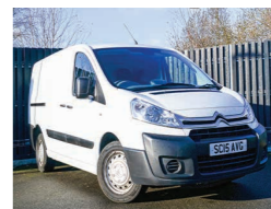
2015 Citroen Dispatch 2.0 HDI 1200 L2H1 Enterprise Panel Van, SC15 AVG, White, 25,000 miles, £9,750+VAT. Black Cloth, Electric Windows, Electric Folding Mirrors, Remote Cent Locking, Park Assist.