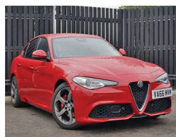
2017 Alfa Romeo Giulia 2.2 TD Speciale Automatic, VA66 MVM, Alfa Red, 8,000 miles, £27,950. Climate Pack, Convenience Pack, Driver Assistance Pack, Dark Tinted Windows, Power Seats.