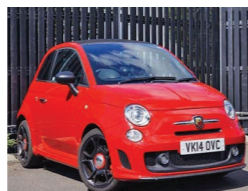
2014 Abarth 500C 1.4 T-Jet, VK14 OVC, Red, 9,800 miles, £10,450. Auto Climate Control, Rear Parking Sensors, Radio/CD/MP3, Blue & Me, Voice Activation, 16in Alloys, Dark Tinted Rear Windows.