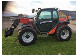
2010, Manitou MLT627, choice of JCB headstock or Mantiou, very nice condition £25,250 AD