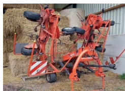
2013, Kuhn GF7902 Mounted Tedder, 7.8m 8 hyd folding rotors £7,000 BW