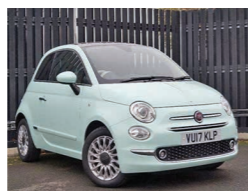
2017 Fiat 500 1.2 Lounge Dualogic, VU17 KLP, Green, 1,000 miles only, £14,950. Leather Interior, Electric Sunroof, Air Conditioning, Start/Stop, 15in Alloys, Telephone Equipment, Electric Front Windows, CD.