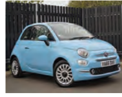
2017 Fiat 500 0.9 TwinAir Lounge, VA66 OXV, Blue, 4,965 miles, £10,450. Air Conditioning, Cruise Control, Rear Parking Sensors, Front Memory Seats, Glass Sunroof with Sunblind, Start/Stop.