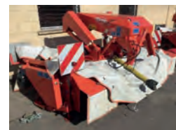
2015 Kuhn FC313DF, front mounted 8 disc cutterbar, 3.1m cut, steel condition, fast fit blades £7,800 BW