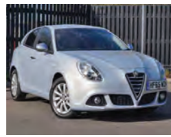
2015 Alfa Romeo Giulietta 1.6 JTDM-2 Business Edition, HF65 WZK, White, 20,052 miles, £10,595. Dark Tinted Windows, Climate Control, Cruise, 17in Turbine Alloys, Parking Sensors.