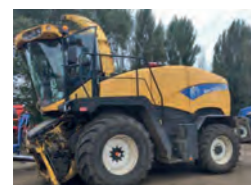
2010 New Holland FR9060, 4wd, grass & maize £78,500 AT