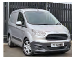
2016 Ford Transit Courier 1.5 TDCI Trend Van, YE16 HWH, Metallic Silver, 18,000 miles, £8,950+VAT. Grey Cloth, Exc bodywork, Rain Sensor, Tinted Glass, Hill Holder, Power Windows.