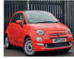
2017 Fiat 500 1.2 Lounge, VF17 LFX, Coral, 30 miles only, £10,900. Air Conditioning, Front Seats with Memory, Fixed Glass Sunroof with Blind, Electric Windows, Hill Holder, Start/Stop, Parking Sensors.