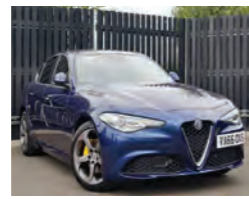
2017 Alfa Romeo Giulia 2.2 TD Super Auto, VA66 OXS, Montecarlo Blue, 9,879 miles, £27,995. Over £40k new! Lusso Pack Silverwood Car, Sports Leather, Shift Paddles, Loaded!