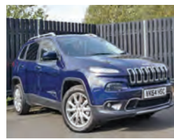
2014 Jeep Cherokee 2.0 CRD Limited, VK64 HSC, Blue, 29,979 miles, £15,989. Panoramic Sunroof, Sunscreen Glass, Auto Air Conditioning, Morocco Nappa Leather, Ventilated Seats, Alarm.