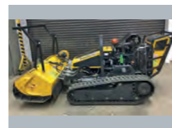
EX-HIRE - McConnell Robocut, 124 hrs c/w fail head 1300, option to buy Mulcher £33,500 RM