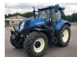
2013 New Holland T7.200 Auto Command, sidewinder, front linkage, 2300 hrs £55,000 BW