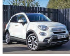
2016 Fiat 500X 1.6 MultiJet Cross, VO66 WLX, White, 10,100 miles, £11,950. Auto Climate Control, Cruise, Rear Parking Sensor, DAB Audio, 17in Alloy Trekking Wheels, Dark Tinted Windows.