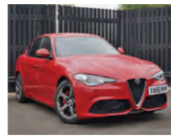
2017 Alfa Romeo Giulia 2.2 TD Speciale Auto, VA66 MVM, Alfa Red, 8,000 miles, £29,501. Convenience Pack, Climate Pack, Driver Assistance Pack, Dark Tinted Windows, Rain Sensor, DAB Audio.