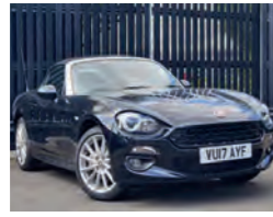
2017 Fiat 124 Spider 1.4 MultiAir Lusso, VU17 AYF, Black, 1,000 miles only, £18,950. Leather, Auto Climate Control, Heated Seats, Satnav, 3D Maps, Rear Camera, DAB Audio, Cruise, Electric Windows.