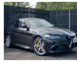
2017 Alfa Romeo Giulia 2.9 Biturbo V6 Quadrifoglio, VE17 FYY, Black, 2,650 miles, £57,450. 510 bhp, Leather/Alcantara, Harman Kardon, 5-Hole Alloys, Yellow Callipers, Climate Control.