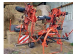
2013, Kuhn GF7902 Mounted Tedder, 7.8m 8 hyd folding rotors £7,000 BW