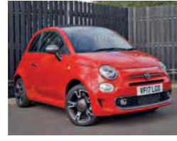
2017 Fiat 500C 1.2 S, VF17 LGD, Red, 20 miles only, £13,650. Save £3,140! 16in Alloys, Memory Seats, 7in TFT Screen, Air Con, Cruise, Start/Stop, Rear Parking Sensors, Dark Tinted Glass, TPMS.