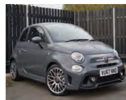
2017 Abarth 595, VU67 NND, Grey, 3,365 miles, £13,950. Air Conditioning, Traction Control, Electric Front Windows, Electric Door Mirrors, Folding Rear Seats, Radio, Power Steering, 47mpg.