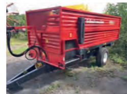
2017 Schuitemaker Feedo 50.8 Feeder Wagon, variable floor speed, beaters & cross conveyor £14,000 BW