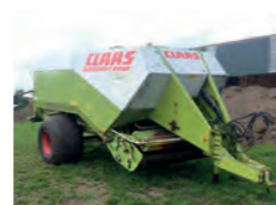
2002 Claas 2200 Big Square Baler, 120 x 70 bale, rotor feed, single axle, good working order £12,000 JW