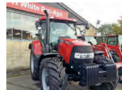
'67 Plate, Case IH Maxxum 130, 50kph, air brake, CVT, Michelin tyres, electronic spools, aircon £34,500 SC