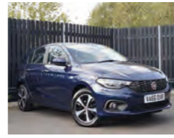
2017 Fiat Tipo 1.6 MultiJet Elite, VA66 OXR, Blue, 6,700 miles, £12,450. Ex-Demo, Satnav, Air Conditioning, Rear Parking Sensors, Electric Windows, Elite Alloy Wheels, Touchscreen, TPMS.