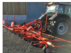
2014 Kuhn GF7802 6 Rotor Tedder, immaculate condition, done very little work £7,250 RM