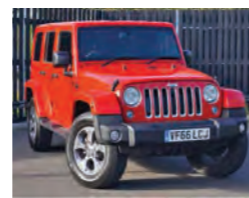
2017 Jeep Wrangler 2.8 CRD Overland Auto, VF66 LCJ, Red, 2,500 miles, £30,995. Full Leather, Heated Seats, Climate Control, Cruise, Voice Command, Satin Alloy Wheels, Power Windows.