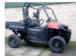
EX-DEMO - 2017 Honda UTV 700M2, 2/4wd and difflock, 2 year warranty, fitted towball, £10,250 TR

Sales Hotline: 01373 465941 (Mon-Fri 08.00-17.00) Out of hours: 07710 985957