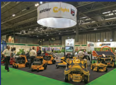
Award-winning stand at SALTEX 2017