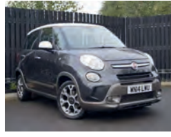
2014 Fiat 500L 1.6 MultiJet Trekking, WN14 LWU, Green, 27,200 miles, £8,450. Dark Tinted Windows, Air Conditioning, Rain Sensor, Cloth/Leather, 17in Alloys, 5in Touchscreen, Cruise, PDC.