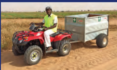
Honda ATVs and trailers for sub-Saharan Africa