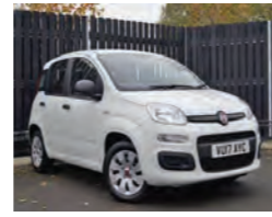
2017 Fiat Panda 1.2 Pop, VU17 AYC, White, 4,760 miles, £6,750. Ex-Demonstrator, Radio/CD/MP3, Front Power Windows, Hill Holder, Tyre Pressure Monitoring System, One Owner, p/x welcome.