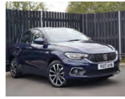
2017 Fiat Tipo 1.6 MultiJet Lounge Auto, VU17 AYM, Blue, 7,020 miles, £14,950. Leather, Satnav, Auto Climate Control, Rear View Camera, 17in Alloys, Rain Sensor, DAB Audio, TPMS.