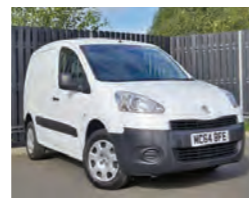
2015 Peugeot Partner 1.6 HDI Professional L1 850, MC64 BFE, White, 26,800 miles, £6,950+VAT. Grey Cloth, Electric Front Windows, RD4 Radio/CD/MP3, FSH, Excellent Tyres, Alarm.