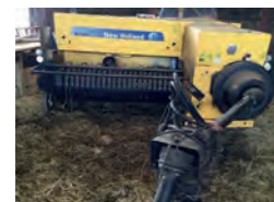
New Holland BC5060 Baler, like new only done small amount of work £10,200 RM