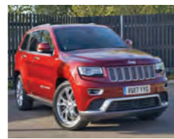
2017 Jeep Grand Cherokee 3.0 CRD Summit, VU17 YYG, Red, 10,000 miles, £37,977. DAB Audio, Rear Seat DVD/BluRay, Panoramic Sunroof, Natura Plus Leather, Heated Memory Seats.