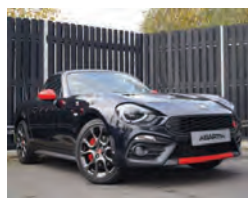
2017 Abarth 124 Spider Roadster 1.4 MultiAir, VK67 HGY, Black, 20 miles only, £27,465. Pre-Reg, Save £6,500! Bose Audio, Cruise Visibility Pack, Heated Leather Seats, Corsa Alloys, Alarm.