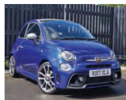
2017 Abarth 595C 1.4 T-Jet Turismo, VU17 XLA, Blue, 4,400 miles, £16,950. Abarth Leather Upholstery, Privacy Glass, Electric Front Windows, Auto Climate Control, Rear Parking Sensors.