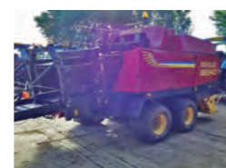
2002 New Holland BB940 Big Baler, 92000 Bales, good condition for age £17,500 AT