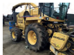
2000 New Holland FX38, 3317 cutting hrs, 4650 engine hrs, crop processor £22,000 RM