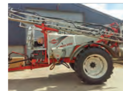
2012 Kuhn Trailed Sprayer, 3200 RHPA, 24 mtr booms alloy, 2800 ltr, auto steer drawbar £18,000 SC