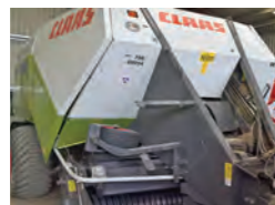
2011, Class Big Baler 2200, very good order & careful driver owner, very well maintained £28,500 CD