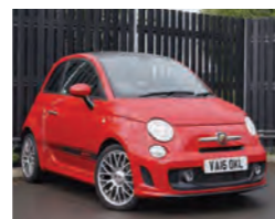
2016 Abarth 595 1.4 T-Jet, VA16 OKL, Red, 12,000 miles, £10,450. Air Conditioning, Front Electric Windows, Abarth Alloys, Tinted Windows, CD/Radio/MP3, Blue&Me, Bluetooth, TPMS.