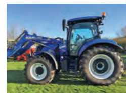
2016 New Holland T6.155, 50kph, NH Loader, front linkage & PTO, climate control £62,500 RM