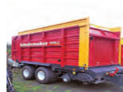
2017 Ex-Demo Schuitemaker Rapide 520S, air/hyd brakes, LED lights, mudguards £59,000 BW