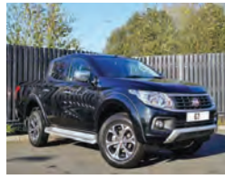
2017 Fiat Fullback 2.4 LD LX Auto 4x4 Double Cab, Mica Black, 5 miles only, £19,850+VAT. Huge Saving, Full Leather, DAB, Climate Control, Heated Seats, Cruise, Privacy Glass, Power Windows.