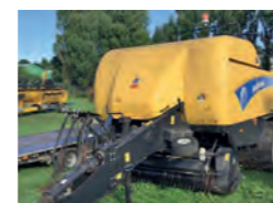
2011 New Holland BB9060 Packer Cutter Baler, 42000 bales, VGC £37,500 AT