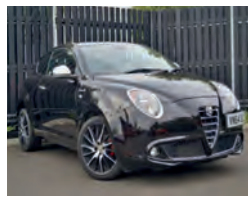
2014 Alfa Romeo MiTo 0.9 TB TwinAir Sportiva, VN64 UJC, Black, 19,575 miles, £8,450. Climate Control, Cruise, Radio/CD/MP3, Bluetooth, 18in Alloys, Tinted Glass, Electric Windows, Alarm.