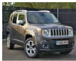
2017 Jeep Renegade 2.0 MultiJet II Limited Auto VA66 MVO, Grey, 5,899 miles, £19,189. Leather, Heated Seats, Hill Start Assist, 18in Alloys, Privacy Glass, Climate Control, Satnav, Power Windows.