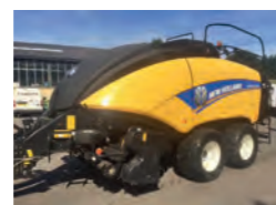
2016 New Holland BB1290 standard Big Baler, steering axle, extended warranty, 14000 bales £72,000 BW