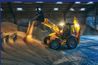
T H WHITE Construction in profile