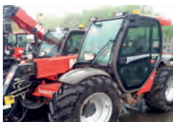
2013 Manitou MLA629 c/w new tyres £29,000 BW