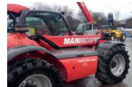
2013 Manitou MLT 627, Manitou hyd headstock, aircon, 24in tyres 50%, 1650 hrs £31,250 PC