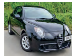
2016 Alfa Romeo MiTo 0.9 TB TwinAir Progression, VK16 SFJ, Black, 2,563 miles, £9,950. Climate Control, 5in Touchscreen, Voice Recognition, 15in Alloys, One-Touch Front Windows, TPMS.