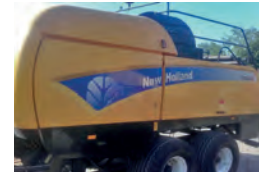
2011 New Holland BB9080, fork feeder, tandem steer hyd brakes, moisture sensor, 55,000 bales £31,500 PC