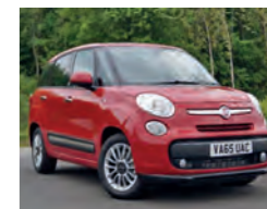
2016 Fiat 500L 1.6 MultiJet Lounge VA65 UAC, Red, 10 miles, £15,950. Pre-Reg, Electric Sunroof, Electric Windows, Auto Lights with Rain Sensor, Electric Door Mirrors, Front Fog Lights.