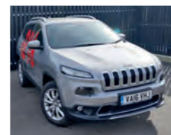
2016 Jeep Cherokee 2.2 MultiJet II Limited, VA16 VHJ, Silver Grey, 100 miles, £29,950. Nappa Leather, Auto Aircon, Cruise, Front/Rear Park Assist, Polished Alloys, Rain Sensor, Power Windows.