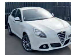
2016 Alfa Romeo Giulietta 2.0 JTDM-2 Distinctive, VA16 VGR, White, 100 miles, £18,950. Sports Leather, Parking Sensors, Dark Tinted Windows, Colour Touch Screen, Turbine Alloys, CD.