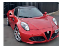
2016 Alfa Romeo 4C 1.8 TBI Spider, VK16 UFH, Competizione Red, 1,000 miles, £54,495. Black Leather, Sports Seats, Racing Double Tail Pipe, Air Conditioning, Red Brake Callipers, Sports Seats.