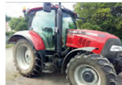
2011 Case IH Maxxum 140 4wd, 3675 hrs, air seat A, air con, 40kph, hyd push back hitch £32,000 SC