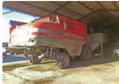
2009 Massey Ferguson Centora combine harvester, 22ft header £54,000 AT