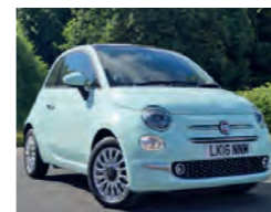
2016 Fiat 500 1.2 Lounge, LK16 NNM, Blue/Green, 1,446 miles, £10,450. Fixed Glas Roof with Sunblind, Air Conditioning, Rear Parking Sensors, Star/Stop, 15in Alloys, Hill Holder, Radio + USB.