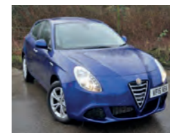
2015 Alfa Romeo Giulietta 1.6 JTDM-2 Progression, VE15 VEA, Metallic Blue, 4,000 miles, £15,650. Climate Control, 16in Double-SDpoke Alloys, Electric Windows, Hill Holder, Start/Stop.