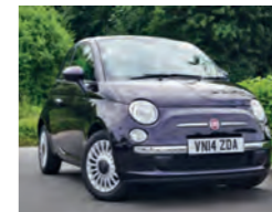
2014 Fiat 500 1.2 Lounge, VN14 ZDA, Purple, 13,500 miles, £7,450. Air Conditioning, Fixed Glas Roof, Start/Stop, 15in Multispoke Wheel, Air Conditioning, Electric Windows, Radio/CD/MP3, DAB Audio, Blue & Me, Bluetooth.