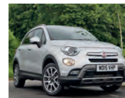
2015 Fiat 500X 1.4 MultiAir Cross Plus, WO15 VHP, Grey, 9,074 miles, £14,450. Dual Zone Climate Control, Leather/Cloth, 18in Alloys, Cruise, Parking Sensors, Keyless Go, Tinted Glass.