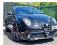
2014 Alfa Romeo MiTo 1.4 TB MultiAir, VK64 RYD, Black, 6,500 miles, £12,950. Cruise, One-Touch Electric Windows, Front Fog Lights, Rear Parking Sensor, Electric Heated Door Mirrors, Blue & Me.