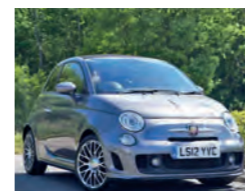
2012 Abarth 500C 1.4 T-Jet, LS12 YVC, Grey, 18,250 miles, £11,250. MTA Auto, Convertible, Climate Control, Parking Aid, 16in Alloys, Electric Windows, Radio/CD/MP3, 16in Alloys, 95/45 R16 84V Tyres.