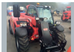
2012 MANITOU MLT625 75H, new Manitou headstock, hydrostatic, tyres 35%, 2,900 hrs £24,000 JW