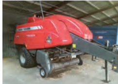
2009 Massey Ferguson 2150 Square Baler, low bale count, immaculate condition £28,500 AT