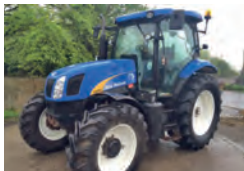
2012 New Holland T6050, 50kph, new tyres, 3,350 hrs £32,500 BW