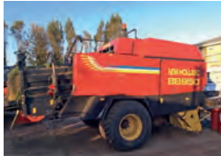
2008 New Holland BB950 Packer Cutter Baler £23,500 AT