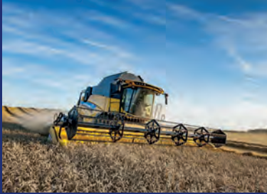
Gear up for harvest