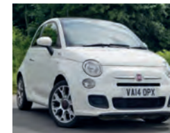
2014 Fiat 500 1.2 S, VA14 OPX, Bossa Nova White, 10,000 miles, £7,450. Dark Tinted Rear Windows, 7in TFT Screen, 15in Alloys, Aircon, Voice Recognition, Start/Stop, Radio/CD/MP3.