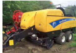
2012 New Holland BB9080 c/w fork feeder, tandem axle, std & partial bale eject, 18,500 bales £45,000 BW