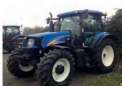
2011 New Holland T6030, 50kph, c/w new tyres, loader brackets, 3,400 hours £32,500 BW