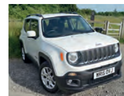
2015 Jeep Renegade 1.6 MultiJet Longitude, WR15 OVJ, Alpine White, 5,555 miles, £14,895. Special Paint, Satnav, 17in Alloys, Air Conditioning, DAB Audio, Cruise, Hill Start Assist, Alarm.