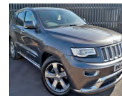
2014 Jeep Grand Cherokee 3.0 CRD Summit, WM64 ULL, Granite Crystal, 7,200 miles, £33,950. Ex-Demo, Special Paint, Adaptive Cruise, Heated Ventilated Seats, 20in Alloys, Natura Plus Leather.