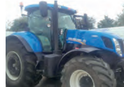
2013 New Holland T7.270 Auto Command, front linkage & PRO, auto steer with RM750, £46,900 PC