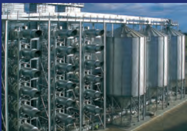
Projects go from strength to strength in Scotland