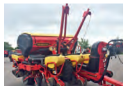
Ex-Demo Vaderstad Tempo 8 Precision Maize Drill, seed meters, seed sensors and control-station £44,000 PC