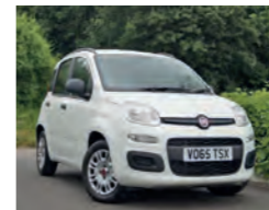
2015 Fiat Panda 1.2 Easy, VO65 TSX, White, 7,000 miles, £6,950. Air Conditioning, Start/Stop, Electric Front Windows, Hill Holder, Radio/CD/MP3, Tyre Pressure Monitoring System.