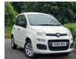
2015 Fiat Panda 1.2 Pop, VK65 MSU, White, 1,952 miles, £6,450. Stop/Start, Electric Front Windows, Hill Holder, Radio/CD/MP3, Tyre Pressure Monitoring System, 55mpg, One Owner.