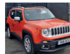
2016 Jeep Renegade 1.4 MultiAir II Limited, VK16 SCX, Omaha Orange, 30 miles, £19,950. Pre-Reg - Save £4,945, Sunroof, Satnav, Air Conditioning, DAB Audio, Touchscreen, Cruise, Alarm.