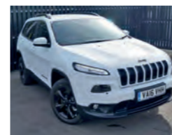
2016 Jeep Cherokee 2.2 MultiJet II Night Eagle, VA16 VHH, Bright Whitek 100 miles, £28,950. Nappa Leather, Delivery Miles, Cruise, Climate Control, DAB Audio, Heated Front Seats, Alarm.