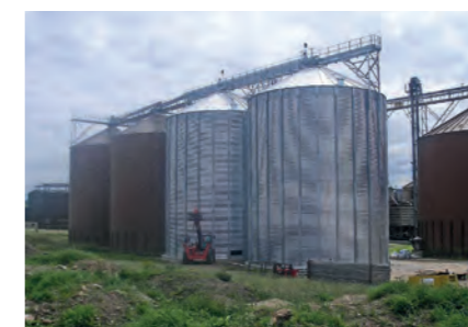
Crisp Malting Group, Portgordon

Elsewhere in the region two other key T H WHITE customers are preparing for the forthcoming harvest with plants designed and constructed by the Projects Division in recent years.