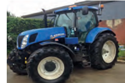
2012 NH T7.260 Power Command, front linkage, full TRK guidance, 710/60r42 wheels at 30%. £44,000 RL