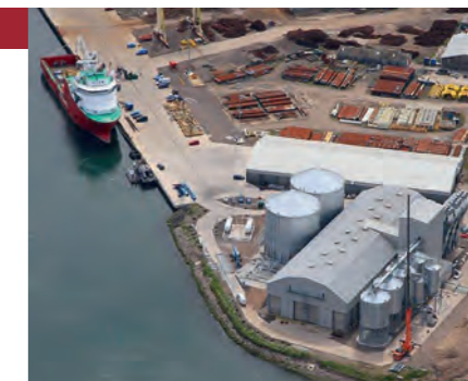
Angus Cereals, Montrose

With a new flat-storage building and a further set of flat-bottomed silos currently being installed, Aberdeen Grain is very well equipped to cope with future harvests.