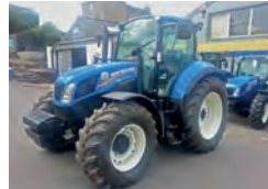
New Holland T5 ex-hire Tractors. Approx 200 hrs, 0% finance and warranty. £POA BW