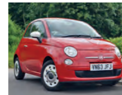
2015 Fiat 500 1.2 Colour Therapy, VN63 JFJ, Red, 14,000 miles, £6,450. Special Paint, Grey Cloth, Cream Highlight Steering Wheel, Air Conditioning, Electric Windows, Radio/CD/MP3, 59mpg.