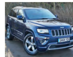
2014 Jeep Grand Cherokee 3.0 CRD Overland, SA64 YDV, True Blue, 6,000 miles, £30,950. Nappa Leather Ventilated Seats, Panoramic Sunroof, Heated Seats, Rear View Camera, Satnav.