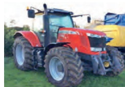
2014 Massey Ferguson 7620, front linkage and PTO, 50 kph, 2,100 hrs £58,500 AT