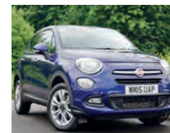
2015 Fiat 500X MultiAir Pop Star, WM15 UAP, Blue, 11,215 miles, £12,950. DualZone Climate Control, 5in Touchscreen, 17in Alloys, Parking Sensor, Hill Holder, Electric Windows, Start/Stop.