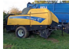
2011 New Holland BB9060 Packer Cutter Baler £35,000 AT