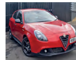
2015 Alfa Romeo Giulietta 1.7 TBI Quadrifoglio Verde, VE65 LLL, 8C Red, 6,033 miles, £22,950. Bose Sound System, Carbon Pack, Heated Seats, 5-Hole Dark Alloys, Leather/Alcantara, TPMS.