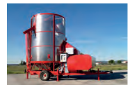
Opico Grain Dryer, 12 tonne Eco, Diesel/Kerosene, PTO, twin gravity discharge £25,600 AT

Sales Hotline: 01373 465941 (Mon-Fri 08.00-17.00) Out of hours: 07710 985957