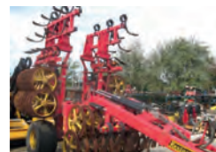
2011 VADERSTAD Rexus Twin 4.5m Press, c/w levelling boards, raptor tines, VGC £28,250 RL