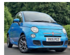
2015 Fiat 500 1.2 S, VK15 PGZ, Blue, 15,685 miles, £8,250. Start/Stop, Auto Climate Control, Hill Holder, Rear Parking Sensors, 16in Alloys, Dark Tinted Rear Windows, Blue & Me Hands Free.