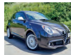
2015 Alfa Romeo MiTo 1.3 JTDM-2 Junior, VE15 RFL, Anthracite grey, 1,000 miles, £12,950. Dual Zone Climate Control, Dark Tinted Windows, 5in Touchscreen, Voice Recognition, Red Brake Calipers.