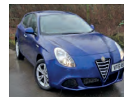
2015 Alfa Romeo Giulietta 1.6 JTDM-2 Progression, VF15 VEA, Blue, 4,000 miles, £15,850. Climate Control, 16in 5 Double-Spoke Alloy Wheels, Uconnect Infotainment, Electric Windows.