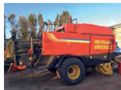
2008 New Holland BB950 Packer Cutter Baler £23,500 AT