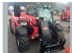
2012 MANITOU MLT625 75H, new Manitou headstock, hydrostatic, tyres 35%, 2,900 hrs £25,000 JW