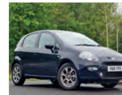
2015 Fiat Punto 1.2 8v Easy+, VN15 YPD, Blue, 1,686 miles, £7,950. Ex-Demo, Auto Climate Control, 16in 7-Spoke Sportline Alloys, Electric Front Windows, Blue & Me, Radio/CD/MP3.