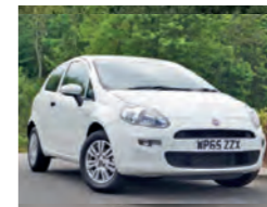
2015 Fiat Punto 1.2 8v Pop, WP65 ZZK, Ambient White, 10 miles, £6,950. Air Conditioning, Comfortline Alloy Wheels, Electric Front Windows, Blue & Me, Radio/CD/MP3, Pre-reg.