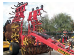
2011 VADERSTAD Rexius Twin 4.5m Press, c/w levelling boards, raptor tines, VGC £30,000 RL