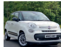
2013 Fiat 500L 1.3 MultiJet Lounge, WN63 KWT, White, 23,567 miles, £8,450. Auto Climate Control, Cruise, Glass Sunroof, Hill Holder, Rain Sensor, 5in Touchscreen, 16in Alloys.