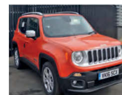
2016 Jeep Renegade 1.4 MultiAir II, VK16 SCX, Omaha Orange, 30 miles, £20,450. Save £4,945! Leather, Electric Panoramic Sunroof, Cruise, Satnav, Aircon, 18in Alloys, DAB Audio, Alarm.