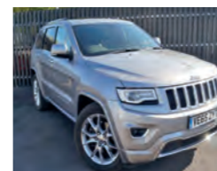
2016 Jeep Grand Cherokee 3.0 CRD Overland, VE65 ZYT, Billet Silver, 8,500 miles, £35,950. Leather, Heated Seats, Parking Aids, Satnav, Sunroof, Electric Door Mirrors, Electric Windows.