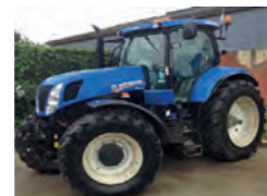
2012 NH T7.260 Power Command, front linkage, full TRK guidance, 710/60R42 wheels at 30%. £44,000 RL