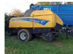
2011 New Holland BB9060 Packer Cutter Baler £35,000 AT