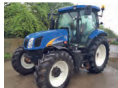
2012 T6050, 50kph, new tyres, 3,350 hrs £32,500 BW