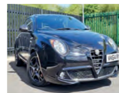
2014 Alfa Romeo MiTo 1.4 TB MultiAir Distinctive Semi Auto, VK64 RYD, Black, 6,500 miles, £12,950. Cruise, Front Fog Lights, Electric Windows, Steering Wheel Audio Controls, Alfa DNA.