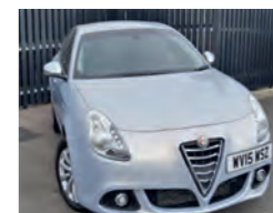
2015 Alfa Romeo Giulietta 2.0 JTDM-2 Business Edition, WV15 WSZ, Lunar Pearl, 14,000 miles, £15,450. Start/Stop, DAB Audio, 16in Turbine Design Alloys, Hill Holder, Voice Recognition, TPMS.