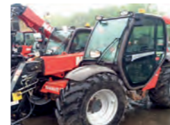
2013 Manitou MLA629 c/w new tyres £29,000 BW