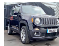
2016 Jeep Renegade MultiJet II Longitude, VK16 SCV, Black, 30 miles, £19,850. Save £6,645 on new price! Special Pastel Paint, Satnav, Aircon, Cruise, DAB Audio, Hill Start Assist, Power Windows.