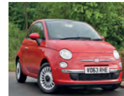
2013 Fiat 500 1.2 Lounge, VO63 RHE, Red, 9,000 miles, £6,950. Start/Stop, Glass Sunroof, Air Conditioning, 15in Alloy Wheels, Bluetooth, Electric Front Windows, Radio/CD/MP3.