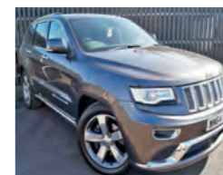
2014, Jeep Grand Cherokee 3.0 CRD Summit, WM64 ULL, Granite Crystal, 7,200 miles, £34,950. Natura Plus Leather Ventilated Seats, Adaptive Cruise, Panoramic Sunroof, Rain Sensor.