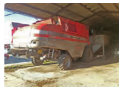
2009 Massey Ferguson Centora combine harvester, 22ft header £54,000 AT