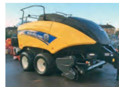
2013 New Holland BB1290 Big Square Baler, bale ejector, rotor cutter, rear steer tandem axle £POA BW