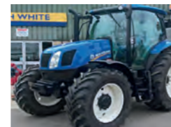
2014 New Holland T6.140, 4wd, 16x16 transmission, c.1,000 hrs, new tyres, excellent. £36,500 MH