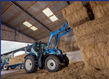
Lifting test to bring you peace of mind