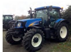
2011 New Holland T6030, 50kph, c/w new tyres, loader brackets, 3,400 hours £32,250 BW