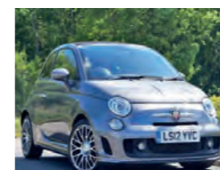
2015 Abarth 500C 1.4 T-Jet, LS12 YVC, Grey, 18,250 miles, £11,950. Convertible, MTA Auto, Climate Control, Parking Aid, 16in Alloy Wheels, Radio/CD/MP3, Electric Front Windows, Blue & Me.