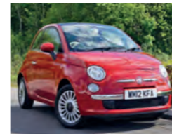
2012 Fiat 500 1.2 Lounge, WM12 KFA, Red, 17,700 miles, £6,450. Start/Stop, Air Conditioning, Sunroof, 15in Alloys, Radio/CD/MP3, Bluetooth, Electric Front Windows.