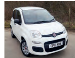
2015 Fiat Panda 1.2 POP, CF15 NBX, White, 5,000 miles, £6,750. Start/Stop, Electric Front Windows, Radio/CD/MP3, Hill Holder, Tyre Pressure Monitoring System, One Owner.