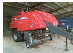
2009 Massey Ferguson 2150 Square Baler, low bale count, immaculate condition £28,500 AT