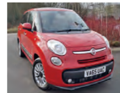
2016 Fiat 500L MultiJet Lounge, VA65 UAC, Red, 10 miles, £16,950. Electric Sunroof, 5in Touchscreen, Dualzone Climate Control, Rain Sensor, Auto Lights, Cruise, Start/Stop, Front Fogs.