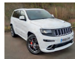
2016 Jeep Grand Cherokee 6.4 Hemi SRT, VE65 ZYR, White, 2,000 miles, £49,950. Heated Sports Seats, Electric Door Mirrors, Sunroof, Satnav, Traction Control, Track Mode, Launch Mode.