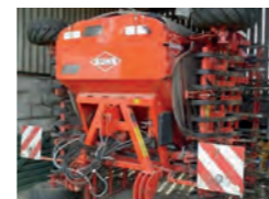
2013 Kuhn Megant 500QS 5m Drill, 13.9cm spacing, levelling boards, 400 acres only £15,000 PC

Sales Hotline: 01373 465941 (Mon-Fri 08.00-17.00) Out of hours: 07710 985957