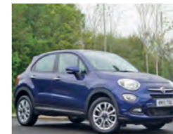
2015 Fiat 500X 1.4 Pop Star, WM15 TBU, Blue, 7,584 miles, £13,450. Auto Dual Zone Climate Control, 17in Alloys, Electric Windows, Cruise, Rear Parking Sensors, Hill Holder, Uconnect.