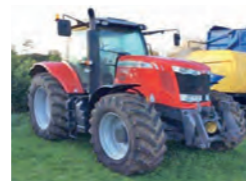
2014 Massey Ferguson 7620, front linkage and PTO, 50 kph, 2,100 hrs £58,500 AT