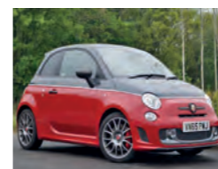
2015 Abarth 500 1.4 T-Jet, 595 Competizione, Bicolour, 900 miles, £17,950. Ex-Demo, Leather/Alcantara Corsa Seats, 17in Titanium Finish Alloys, Auto Climate Control, Tinted Windows.