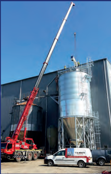
Storage upgrade at ForFarmers feed mill