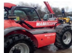
2013 Manitou MLT 627, Manitou hyd headstock, aircon, 24in tyres 50%, 1650 hrs £31,250 PC