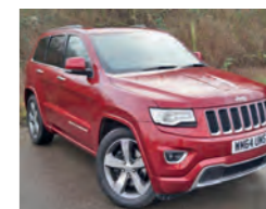
2014 Jeep Grand Cherokee 3.0 CRD Overland, WM64 UMS, Red, 8,000 miles, £31,500. Park Assist, Nappa Leather Ventilated Seats, Panoramic Sunroof, Climate Control, Rear View Camera.