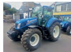
Selection of T4, T5, T6 Ex-hire Tractors. Approx 200 hrs, 0% finance and warranty. £POA BW