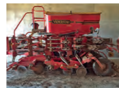
2009 VADERSTAD RDA400S Drill, 3400 hrs £25,000 RD