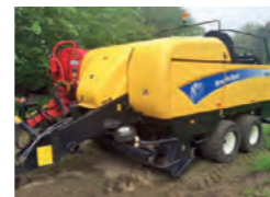
2012 New Holland BB9080 c/w fork feeder, tandem axle, std & partial bale eject, 18,500 bales £45,000 BW