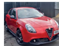
2015 Alfa Romeo Giulietta 1.7 TBI Quadrifoglio Verde, VE65 LJL, Alfa 8C Red, 4,500 miles, £24,950. Hi-Spec Ex-Demo, Leather/Alcantara Heated Seats, Carbon Pack, Bose Sound System.