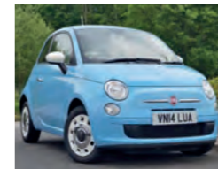
2014 Fiat 500 1.2 Colour Therapy, VN14 LUA, Volare Blue, 14,000 miles, £6,950. One Owner, Air Conditioning, Start/Stop, Electric Front Windows, Radio/CD/MP3, 59 MPG, Band C.