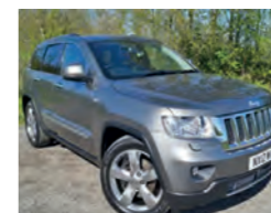
2012 Jeep Grand Cherokee 3.0 CRD V6 Overland, NX12 WVF, Graphite Grey, 29,995 miles, £22,950. Leather, Heated Ventilated Seats, Adaptive Cruise, Aids, Adaptive Cruise, Special Paint,