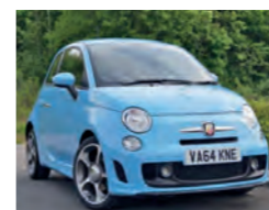
2015 Abarth 500 1.4 T-Jet, VA64 KNE, Volare Blue, 10,516 miles, £10,950. Climate Control, 16in Abarth 8-Spoke Alloys, Electric Front Windows, Hill Holder, Blue & Me Hands Free.