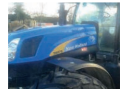
2012 NH T6070 Elite, 17x17 transmission, 40kph Eco, cab & front suspension, 3900 hrs £29,900 PC