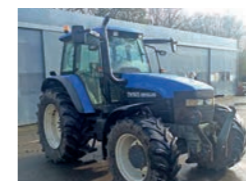
2001, NH TM165, 6675hrs, front suspension, front lkg, cab suspension, powershift transmission £17,000 JW