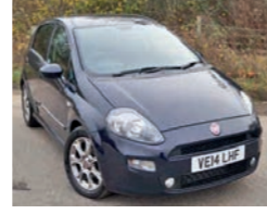
2014 Fiat Punto MultiJet GBT, VE14 LHF, Blue, 11,779 miles, £7,995. 16in Sportline Alloys, Air Conditioning, Privacy Glass, Electric Front Windows, Electric Heated Door Mirrors, Hill Holder.