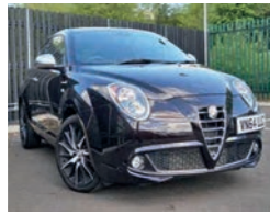
2014 Alfa Romeo MiTo TwinAir Sportiva, VN64 UJC, Etna Black, 4,000 miles, £11,450. Climate Control, 18in Alloys, Parking Sensor, Cruise, Bake Assist, Chrome Tailpipes, Sports Pedals.