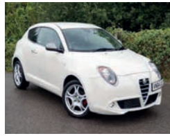
2014 Alfa Romeo MiTo JTDM-2 Distinctive, VN64 UJE, Biancospino White, 6,000 miles, £11,950. Ex-Demo, Cruise, Radio/CD/MP3, Parking Sensor, Sports Pedals, Traction Control, Alfa DNA.