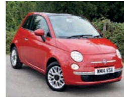
2014 Fiat 500 Lounge, WM14 VSA, Red, 15,102 miles, £7,450. 15in Multispoke Alloys, Auto Climate Control Chrome Pack, Start/Stop, Sunroof, Front Fog Lights, Electric Door Mirrors, ESP.