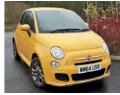
2014 Fiat 500 S, WM64 UXR, Yellow, 15,327 miles, £7,950. Auto Climate Control, Sports Kit, Rear Parking Sensor, Front Fog Lights, Start/Stop, Radio/CD/MP3, Heat Insulated Glass, ESP.