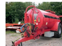
2014 Hi-Spec 2500 gall Tanker, 50kph, air brakes, internal agitator, 4-point linkage £20,250 BG

Sales Hotline: 01373 465941 (Mon-Fri 08.00-17.00) Out of hours: 07710 985957