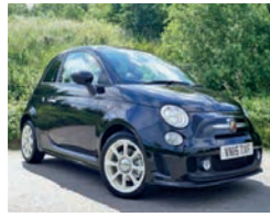
2015 Abarth 500 Custom, VE15 TXF, Metallic Black, 10 miles only, £13,950. Custom White Full Quilted Leather, White Alloy Wheels, Interscope Hi-Fi, Climate Control, Twin Chrome Tailpipes.