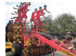
2011 VADERSTAD REXIUS Twin 4.5m Press, c/w levelling boards, raptor tines, VGC £30,000 RL