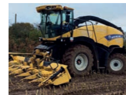
Ex-Demo New Holland FR600, 300FP, grass header, double drive, crop processor, auto lube £POA RM