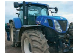
2011 New Holland T7.235 Power Command, 40kph eco, 3650 hours. £40,000 RM