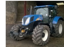
2010 NH T6090 Power Command, 50kph, 4,750 hrs, front linkage & PTO £34,500 AD