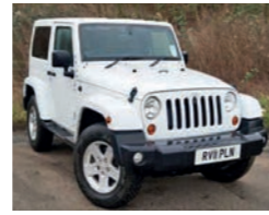
2011 Jeep Wrangler Sahara CRD, RV11 PLN, White, 25,300 miles, £19,450. Auto Air Conditioning, Cruise, Deep Tint Sunscreen Glass, On/Off Road Tyres, One-Touch Windows, Premium Audio.