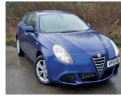
2015 Alfa Romeo Giulietta JTDM-2 Progression, VF15 VEA, Blue, 4,000 miles, £15,850. Climate Control, 16.5in Double Spoke Alloys, 5in Touchscreen, Dynamic Vehicle Control, DAB Audio, PAS.