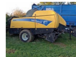
NEW HOLLAND BB9060 Packer Cutter Baler £35,000 AT