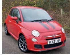
2013 Fiat 500 S, VE63 LHP, Red, 14,796 miles, £7,450. Part Leather, Bonnet Stripes, Sports Seats, Chrome Tailpipe, Front Fog Lights, Dark Tinted Rear Windows, Electric Front Windows, PAS, EBD.