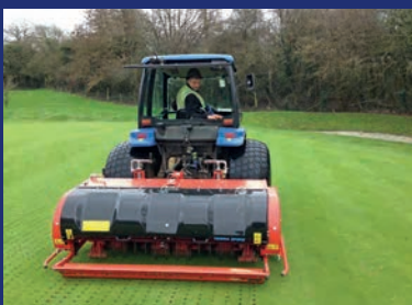
Aerating the course at Redditch