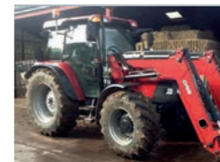
2011 Case IH JXU115, 4wd, 40kph, air con & air seat, Q45 loader, soft tide, hyd quick release £29,500 SC