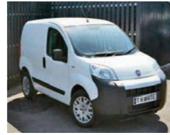
2014, Fiat Fiorino 16v MultiJet, VO64 OLM, White, 5,000 miles, £6,800. Metro Cloth, Nearside Sliding Door, Athermic Windows, ABS, Brakeforce Distribution, Driver's Seat Height Adjustment.