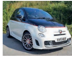
2015 Abarth 595 Turismo, VN64 SFF, Multicolour, 6,000 miles, £15,950. Red Full Leather, 17in Diamond Abarth 10-Spoke Alloys, Sports Seats, Sports Pedals, Side Skirts, Auto Climate Control, ESP.