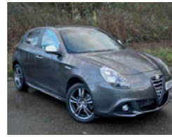
2015 Alfa Romeo Giulietta TB MultiAir Exclusive TCT, VE15 RFK, Anthracite Grey, 7,000 miles, £17,450. Sports Suspension, Visibility Pack, Satin Chrome Door Mirrors, Climate Control, VDC.