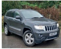
2011 Jeep Grand Cherokee V6 CRD Limited, WV61 NFU, Metallic Charcoal, 43,000miles, £19,950. Leather, Heated Seats, Satnav, Auto Dimming Door Mirrors, Alpine Audio + 9 Speakers, EBD.