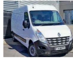
2012 Renault Master LM35 DCI S/R, YG12 AMK, White, 41,334 miles, £12,000. Long Wheelbase, Electric Heated Door Mirrors, Air Conditioning, Satnav, Anti-Intruder Device, Thatcham Alarm.