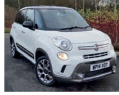
2014 Fiat 500L MultiJet Trekking, WP214 XOT, White, 20,984 miles, £9,950. Cruise, Rear Parking Sensor, Touch Screen Audio, Auto Headlights, Electric Windows, Front Fog Lights, ESP.