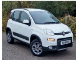
2015 Fiat Panda Multijet, VVA15 WHS, White, 704 miles, £13,450. Risico Cloth/Eco-Leather, 15in Smoked Alloy Wheels, Raised Suspension, 6 Speakers, Blue & Me, Hill Holder, Air Conditioning.