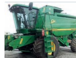
2005 John Deere 9780 CTS Hill Master Combine, 1318 threshing hrs, yield & moisture £54,000 RL