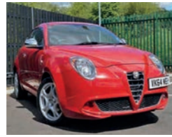
2014 Alfa Romeo MiTo JTDM-2 Distinctive, VE64 WEH, Alfa Red, 5,800 miles, £10,950. Auto Headlights, Electric Heated Door Mirrors, Cruise, Sports Pedals and Dials, Electric Windows, PDC.