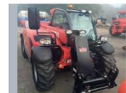
2012 MANITOU MLT625 75H, new Manitou headstock, hydrostatic, tyres 35%, 2,900 hrs £25,000 JW