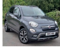
2015 Fiat 500X MultiJet Cross, VN15 HNH, Grey, 2,000 miles, £16,950. Cloth/Leather, Auto Dualzone Climate Control, Cruise, Electric Windows, Electric Heated Door Mirrors, Chrome Tailpipe.