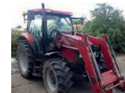
2010 Case IH Maxium 100, 3,300 hrs, tyres 80%, air con, air seat and loader £26,000 BW