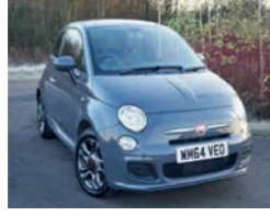
2014 Fiat 500 S, WM64 VEO, Grey, 10,432 miles, £8,250. Half Leather, Sport Kit, Auto Climate Control, Seat Memory, 7in Colour Screen, Rear Parking Sensor, Front Fogs, Electric Door Mirrors.