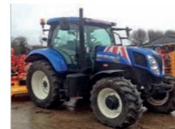
2012 New Holland T7.200 Range Command, 40kph, 4560 hrs £33,000 RL