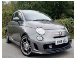
2015 Abarth 500 Custom MTA, VD62 ZPH, White, 30,751 miles, £11,950. Leather, Auto Aircon, Heated Seats, Black Roof Rails, 18in Alloys, Cruise, Front Fog Lights, Thatcham Alarm, ESP.