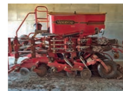
2009 VADERSTAD RDA4005 Drill, 3400 hrs £25,000 RD