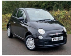
2013 Fiat 500 POP, WN13 ENE, Metallic Black, 18,036 miles, £6,450. Start/Stop, Electric Front Windows, Radio/CD/MP3, Dualdrive PAS, Airbags, Remote Central Locking, ABS, EBD.