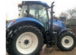
2012 NH T7.185 Range Cmd, 50kph, cab & front axle susp, front linkage & PTO, 1650 hrs £39,900 PC