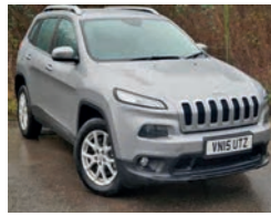
2015 Jeep Cherokee M-Jet Longitude Plus, VN15 UTZ, Silver, 6,250 miles, £19,950. Dual Zone Climate Control, Rear Park Assist with Stop, 8.4in Touchscreen, Cruise, Hill Descent Control, Fogs.