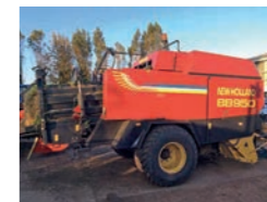
New Holland BB950 Packer Cutter £23,500 AT