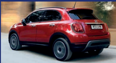
Amazing Fiat Group spring finance offers