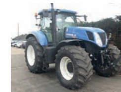
2012 New Holland T7.250 Power Cmd, c/w front linkage, PTO, sidewinder, 50kph £46,000 RL