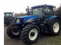
2011 New Holland T6030, 50kph, c/w new tyres, loader brackets £34,500 BW