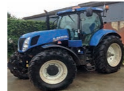
2012 NH T7.260 Power Command, front linkage, full TRK guidance, 710/60R42 wheels at 30%. £45,000 RL