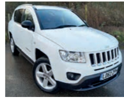
2012 Jeep Compass Limited, LD62 ZPH, White, 30,751 miles, £11,950. Leather, Auto Aircon, Heated Seats, Black Roof Rails, 18in Alloys, Cruise, Front Fog Lights, Thatcham Alarm, ESP.