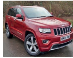
2014 Jeep Grand Cherokee V6 CRD Overland, WM64 UMS, Red, 8,000 miles, £33,950. Nappa Leather, Heated Seats, 8.4in Smarttouch Satnav, Dual Zone Climate Control, Deep Tint Glass.