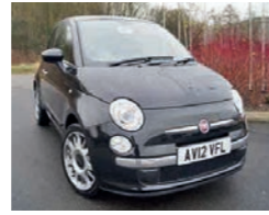
2012 Fiat 500 Lounge, AV12 VFL, Black 25,096 miles, £6,950. Leather, Chrome Pack, Front Fog Lights, Rear Parking Sensor, Heat Insulated Glass, Bluetooth, Radio/CD/MP3, Bi-Xenon Headlights.