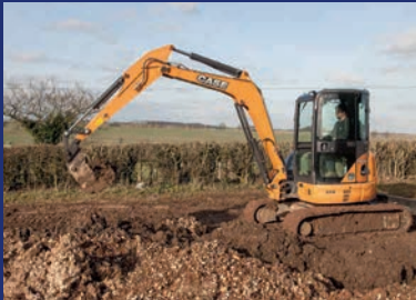
Big dig, small excavator